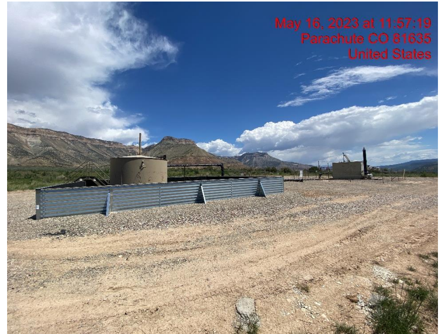
SW Corner of Location – Photo #03498