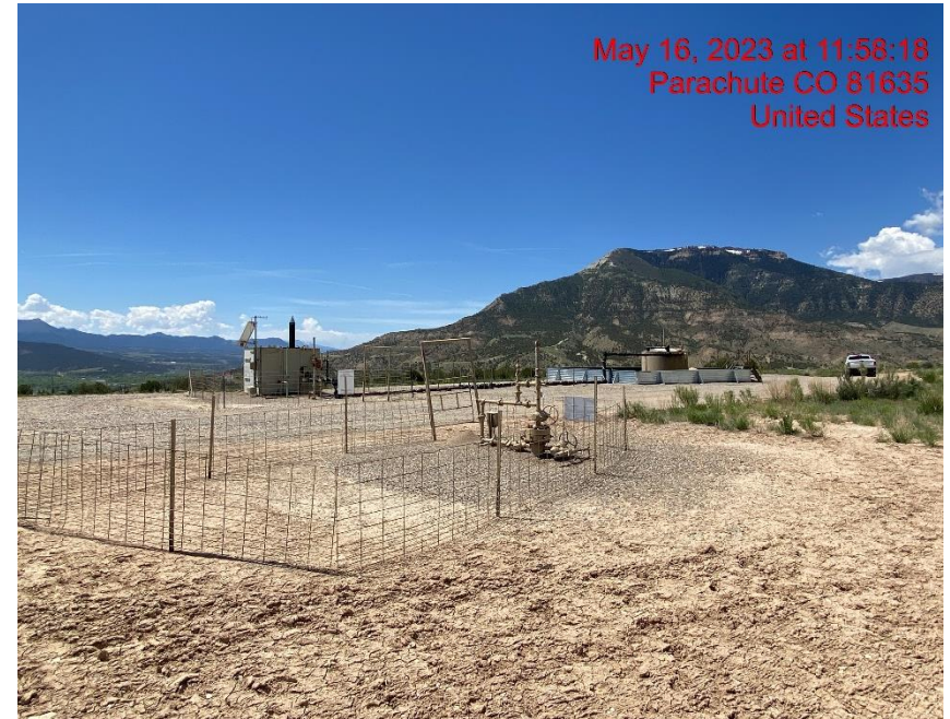
NE Corner of Location – Photo #03500