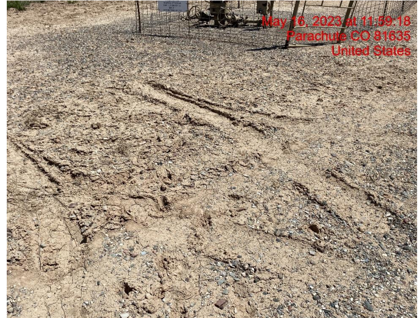
Location Lacks Stabilization – Photo #03506