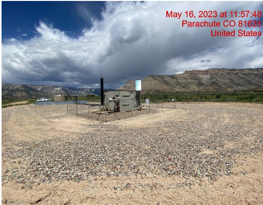
SE Corner of Location – Photo #03499