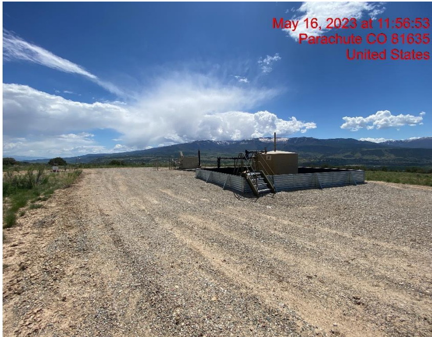
NW Corner of Location – Photo #03497