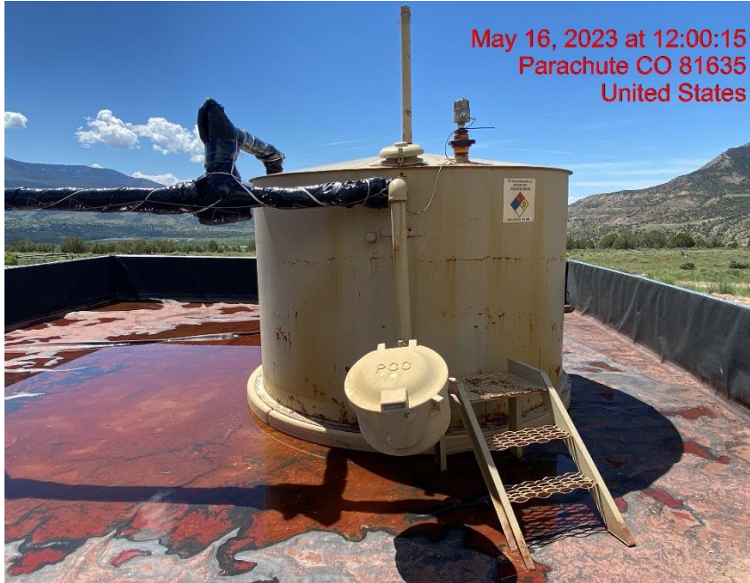
Tank Battery – Photo #03507