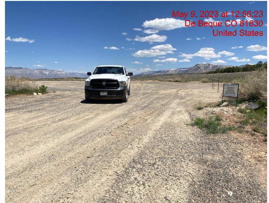
Insufficient Vehicle Tracking BMPs at Location Entrance/Exit – Photo #03125