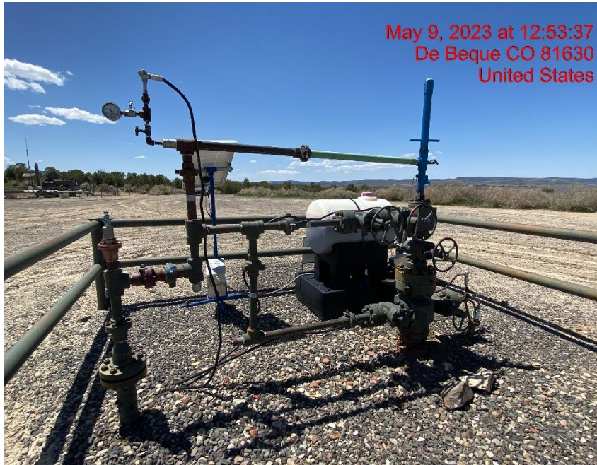
Wellhead – Photo #03114