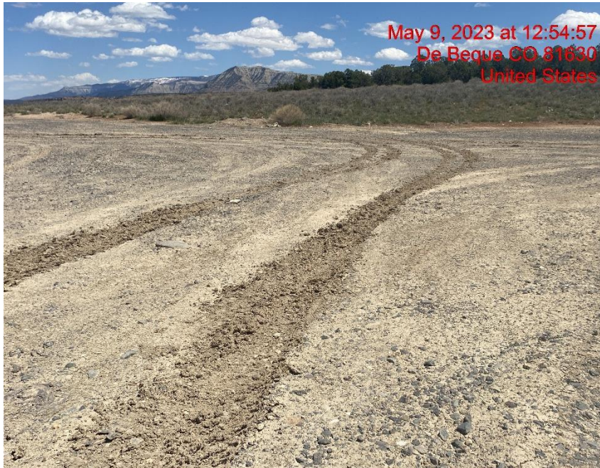
Location Lacks Stabilization – Photo #03119