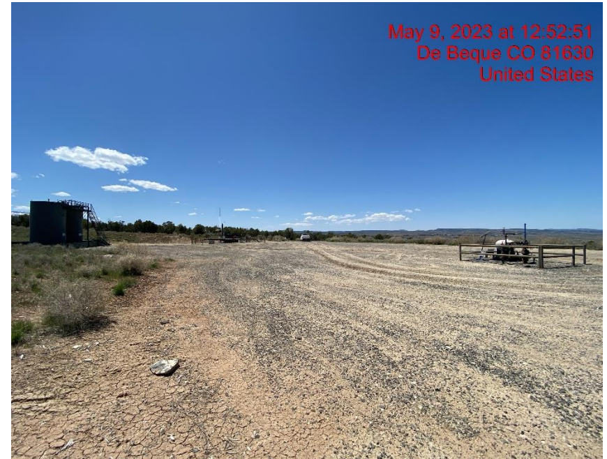
SE Corner of Location – Photo #03112