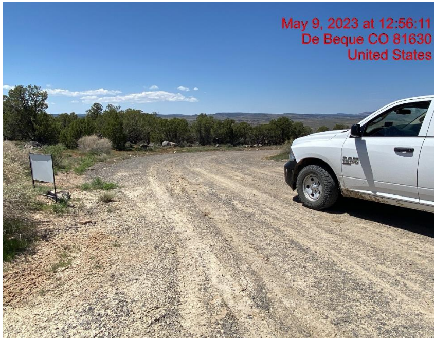
Insufficient Vehicle Tracking BMPs at Location Entrance/Exit – Photo #03124