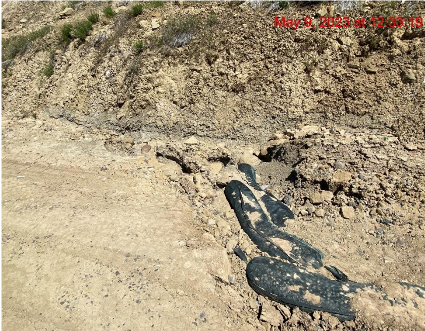
Insufficient BMP on Access Road – Photo #03096