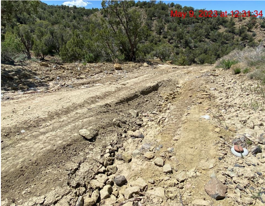
Access Road Degradation – Photo #03093