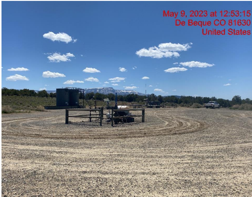
NE Corner of Location – Photo #03113