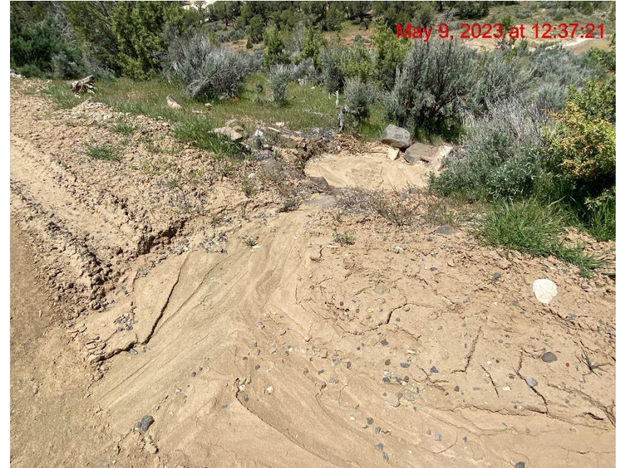
Erosion from Access Road/Sediment Trap Needs Maintenance – Photo #03104