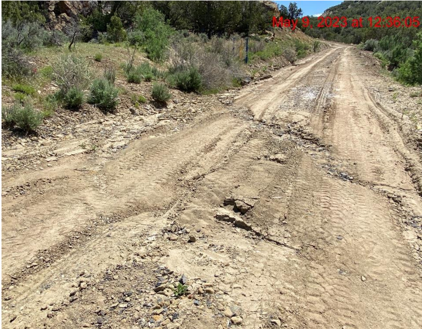
Rill Erosion Through Access Road – Photo #03103