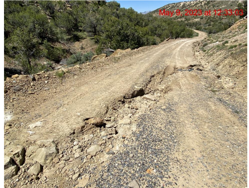
Erosion Through Access Road – Photo #03095