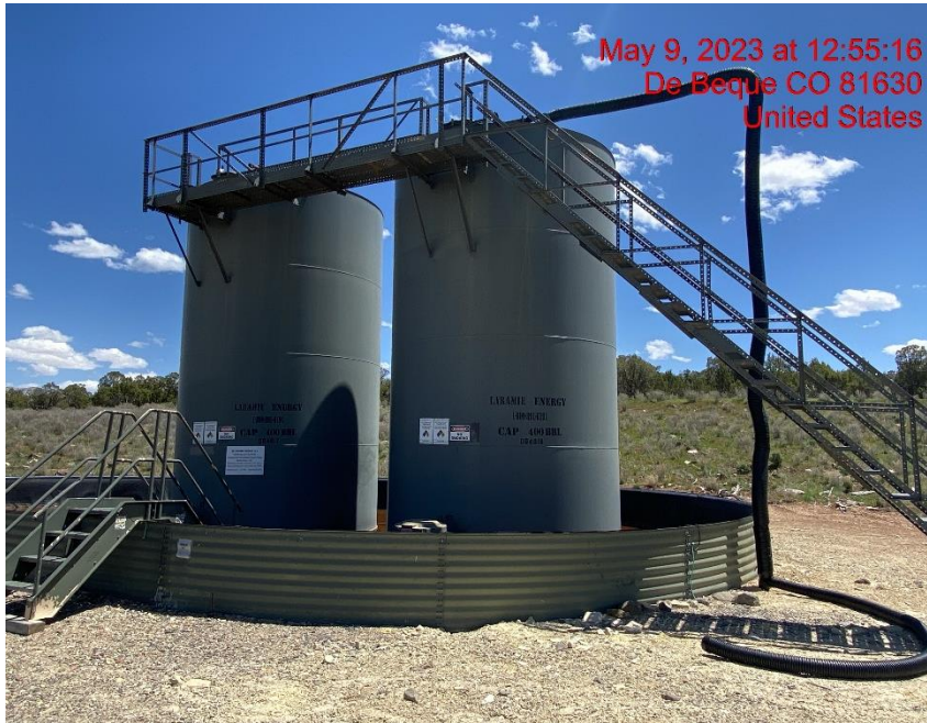
Tank Battery – Photo #03120