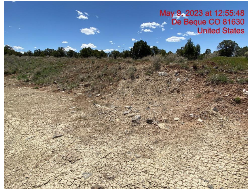
Cut Slope Eroding onto Location – Photo #03123