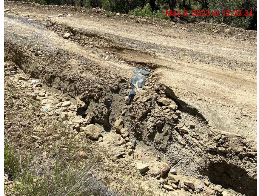
Access Road Erosion/Degradation – Photo #03097