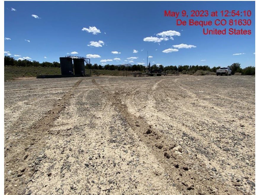
Location Lacks Stabilization – Photo #03117