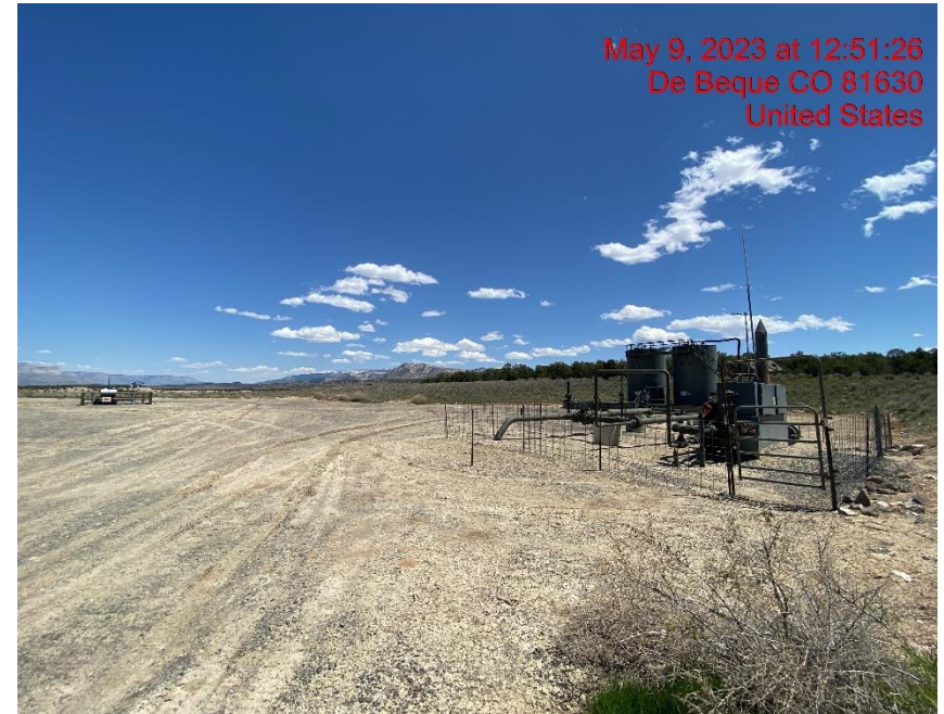
NW Corner of Location – Photo #03110