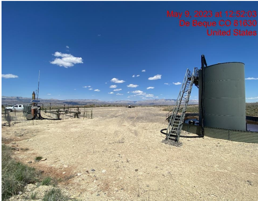
SW Corner of Location – Photo #03111