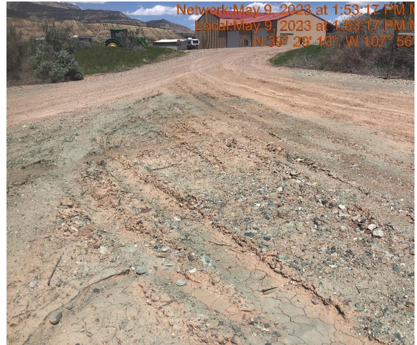
Photo #9914 Insufficient tracking BMP to minimize the transport of sediment.