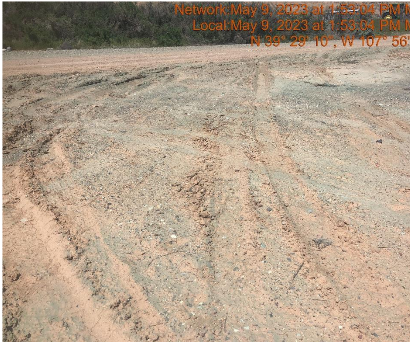
Photo #9913 Insufficient tracking BMP to minimize the transport of sediment.