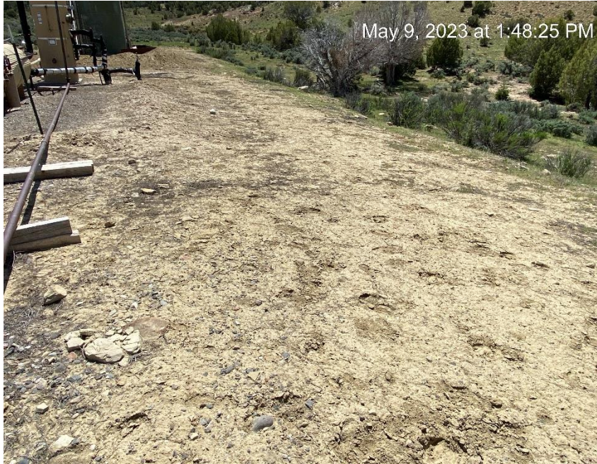
Bare slope allowing sediment to leave location