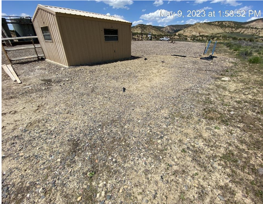
Location view from Southeast corner