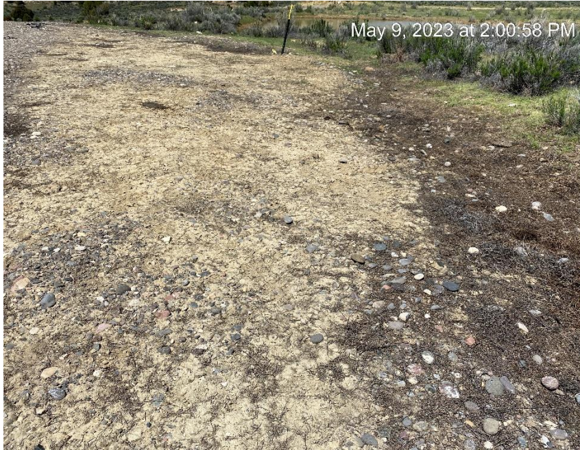
Bare slope along edge of location