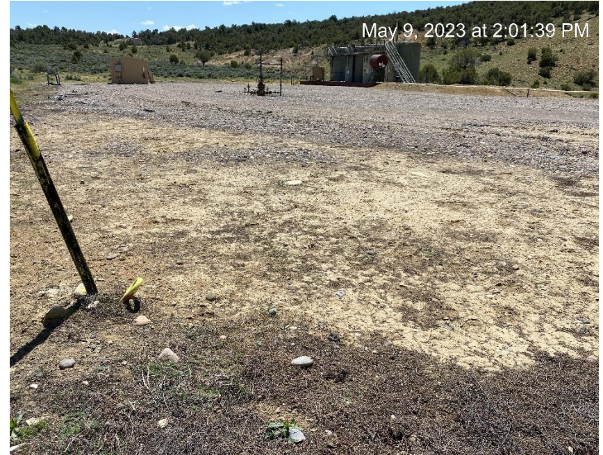
Location view from Northeast corner