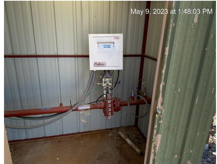
Gas meter calibration card not visibly displayed.