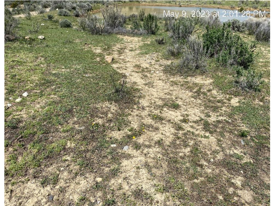
Sediment migration from location