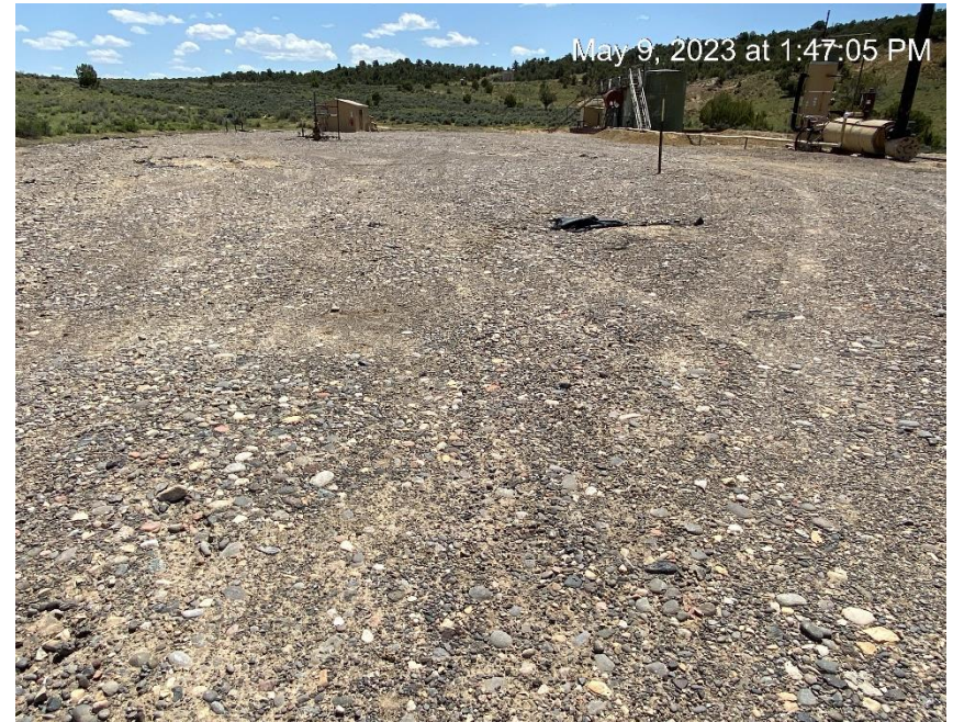
Entrance to location view