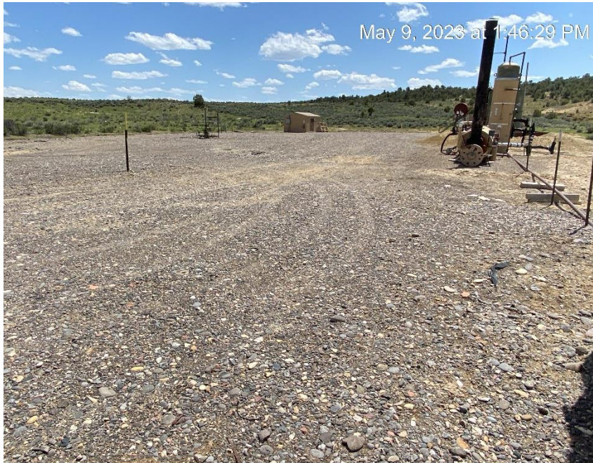
Location view from Northwest corner