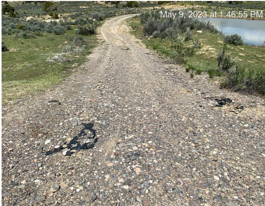
Access road to location