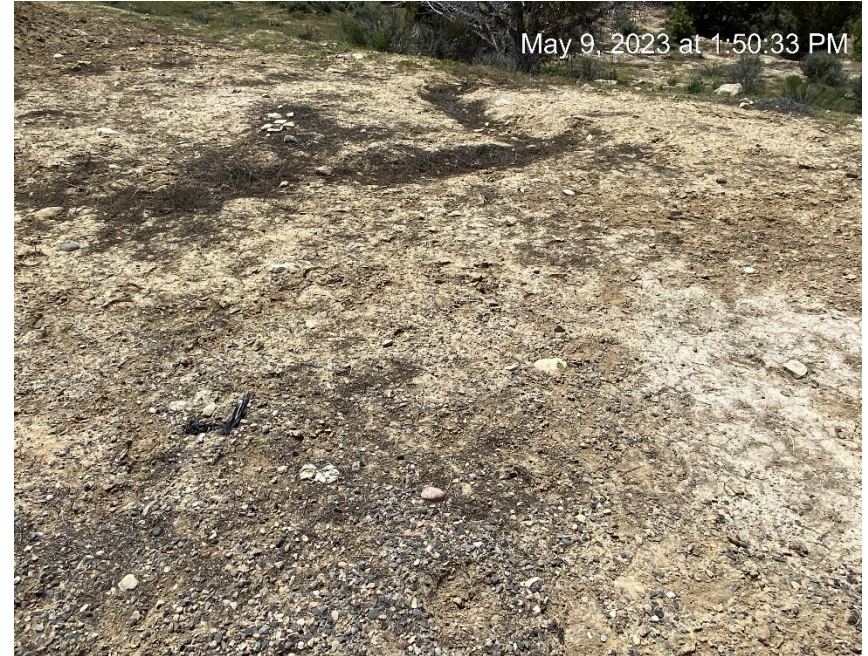
Erosion and sediment migration leaving location