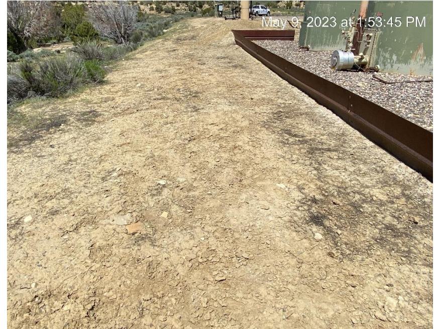
Bare slope allowing sediment to leave location