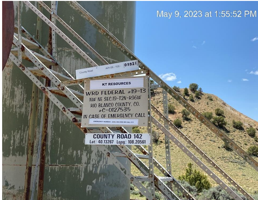
Tank battery signs