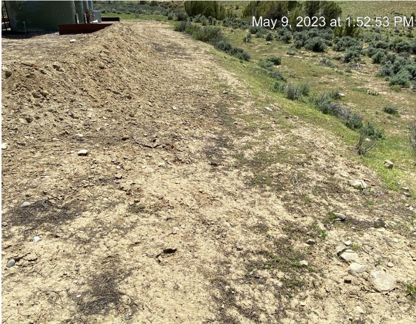
Bare slope and erosion carrying sediment