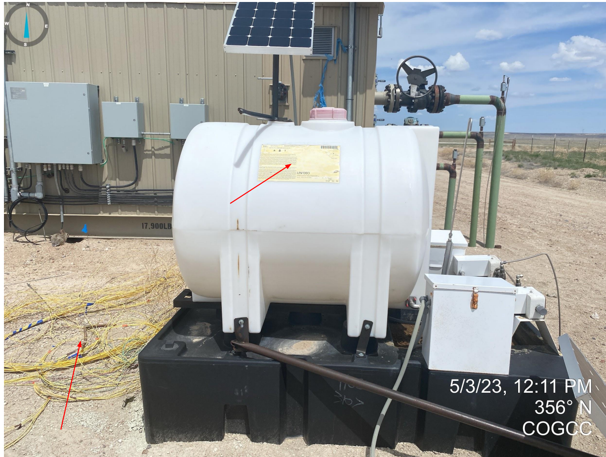
Photo 1. Faded/cracked/peeling tank label will need to be replaced. Additionally, unused wires were observed next to tank and are now considered trash and will need to be disposed of, or removed off location.