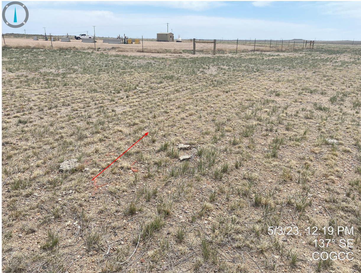
Photo 12. Facing southeast from the northwestern side of the location; see comments in Photo 7. Evidence of road base was seen in this northwestern corner of the interim areas (red arrow); all road base material shall be removed and voids filled with topsoil as part of the reclamation process.