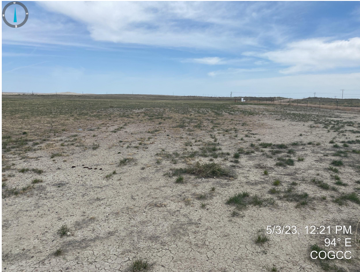
Photo 14. Facing east from the northern side of the location; see comments in Photo 7.