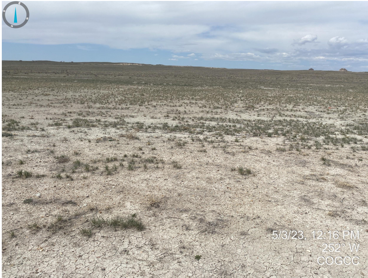
Photo 10. Facing west from the western side of the location; see comments in Photo 7.