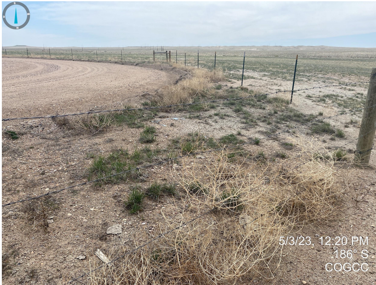
Photo 15. Tumbleweed debris and undesirable plant species observed on location; Operator shall implement a weed management program to control undesirable plant species during the next local growing season.