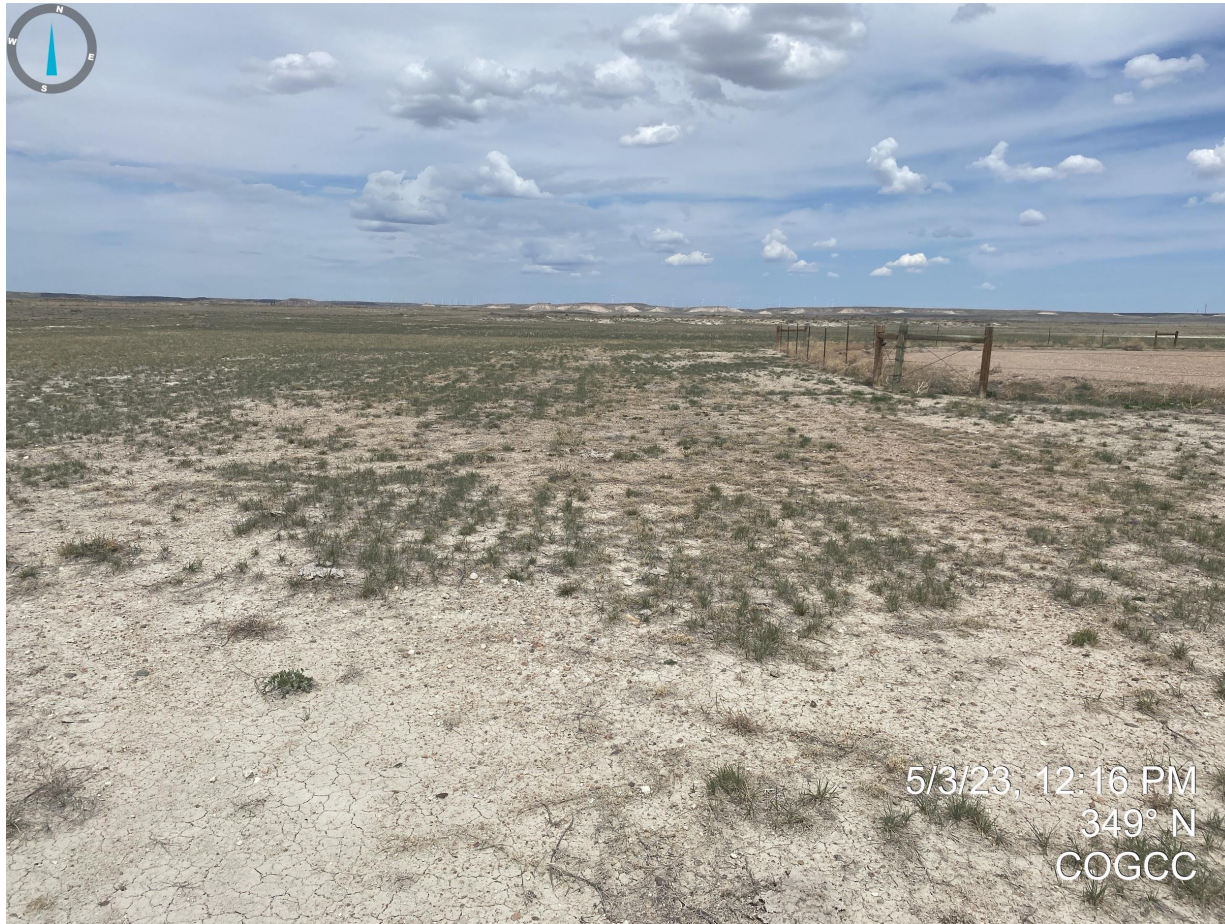
Photo 11. Facing north from the western side of the location; see comments in Photo 7.