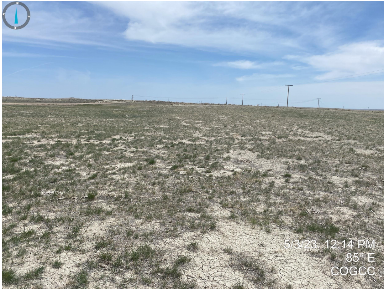
Photo 8. Facing east from the eastern side of the location; see comments in Photo 7.