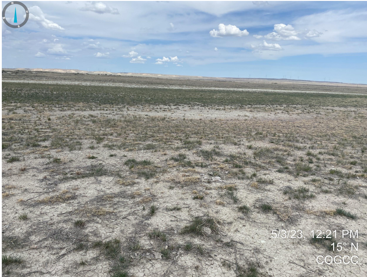
Photo 13. Facing north from the northern side of the location; see comments in Photo 7.