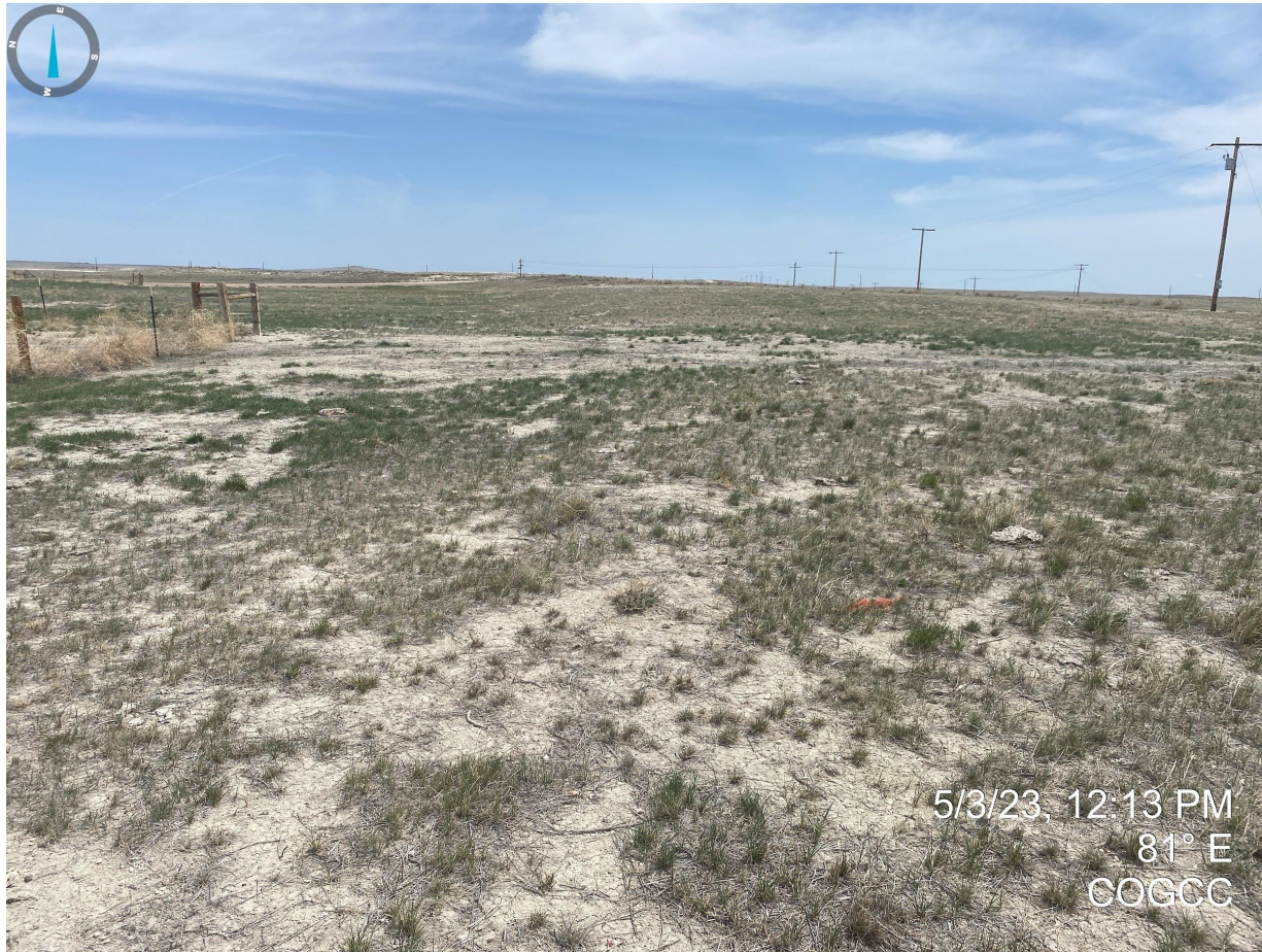
Photo 7. It appears the Operator has performed reclamation activities, however, the majority of the interim areas are not progressing towards Rule 1003 standards. Non-uniform vegetation cover resulting in areas of bare soil was observed throughout the location.