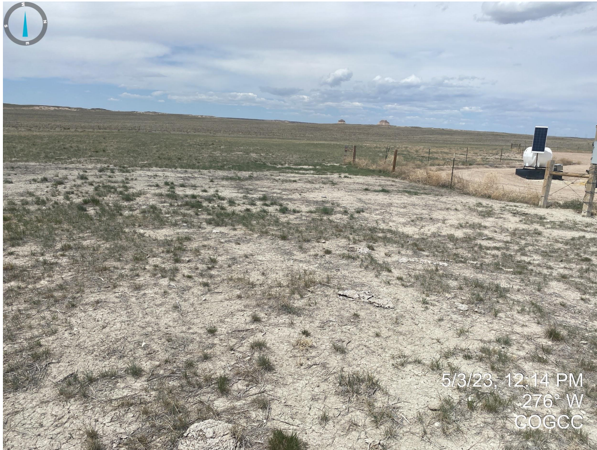
Photo 9. Facing west from the southern side of the location; see comments in Photo 7.