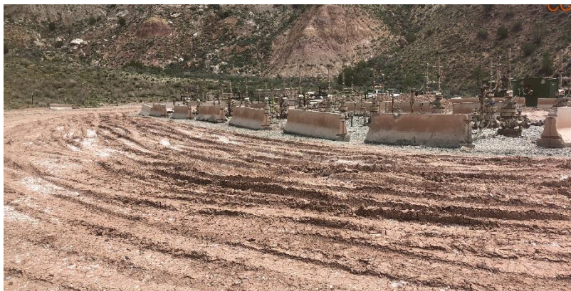
Northwest corner of location.