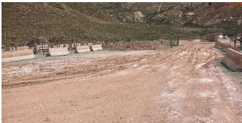
Southwest corner of location.