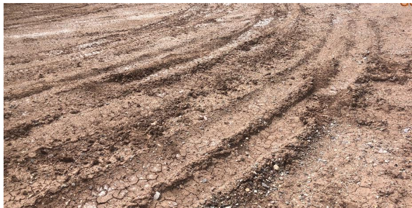
Northeast corner of location.