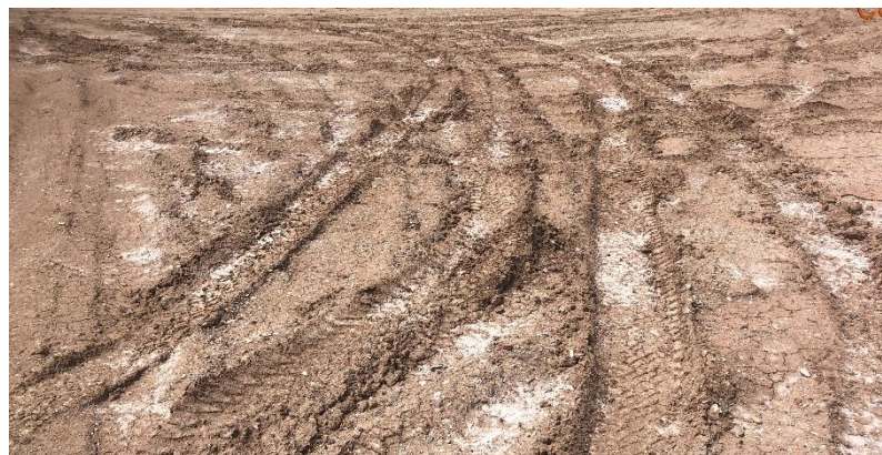
Southeast corner of location.