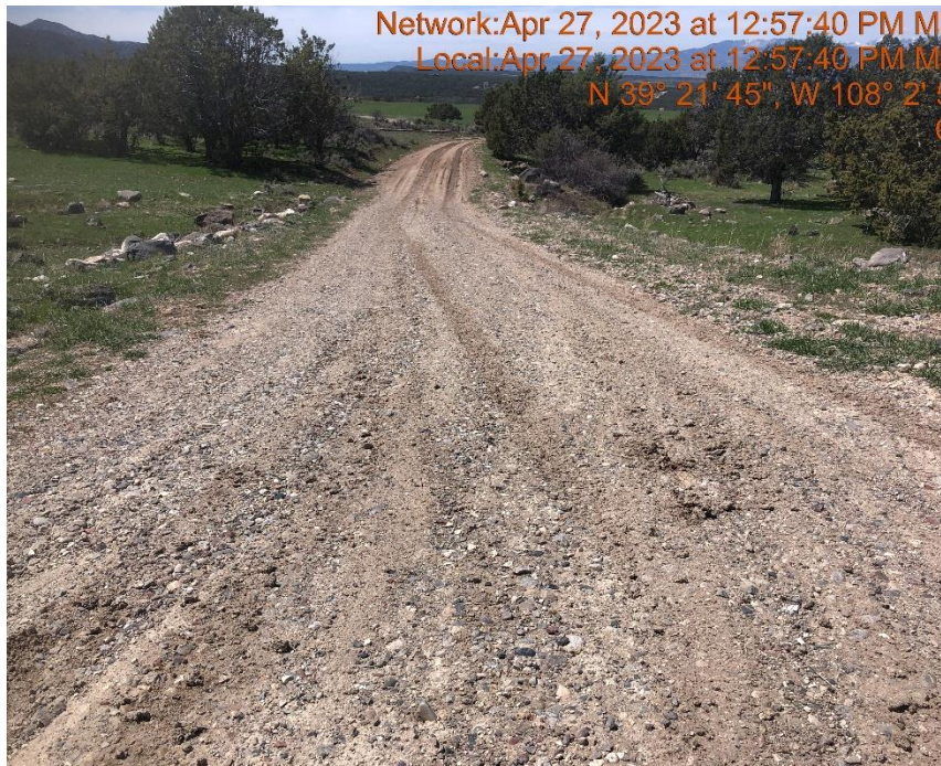
Photo #9766 Insufficient tracking BMP at entrance to location to minimize the transport of sediment off location.