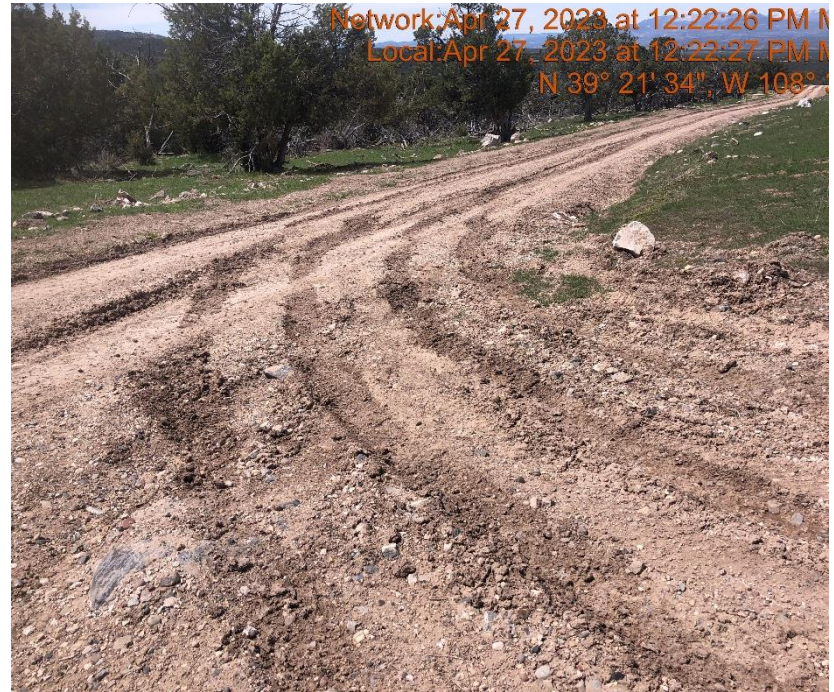
Photo #9753 Insufficient tracking BMP at entrance to minimize the transport of sediment.