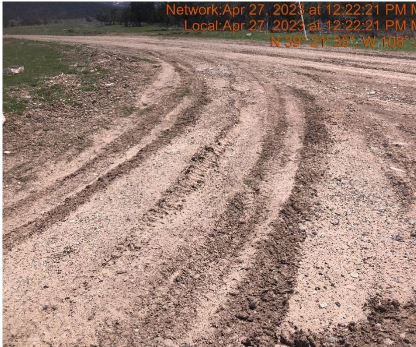
Photo #9752 Insufficient tracking BMP at entrance to minimize the transport of sediment.