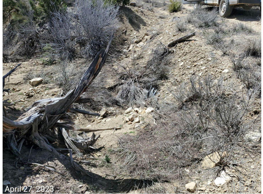
Photo 9: Photos taken from the access road. Photos examples showing final reclamation including, but not limited to, compaction alleviation, recontouring/regrading and reclaiming has not been conducted on the access road. Photos also examples of culverts observed remaining along the access road.