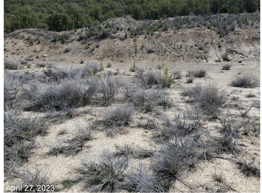
Photo 1: Photos 1-2 taken from the northwest end of the Location. Photos provide an overview of the Location from northeast, southeast, south to southwest. Photos show final reclamation including, but not limited to, compaction alleviation, recontouring/regrading and reclaiming has not been conducted on the Location.