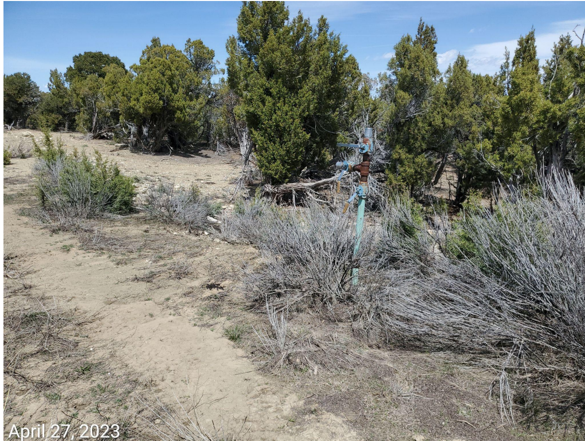
Photo 8: Example of surface equipment remaining along access road.