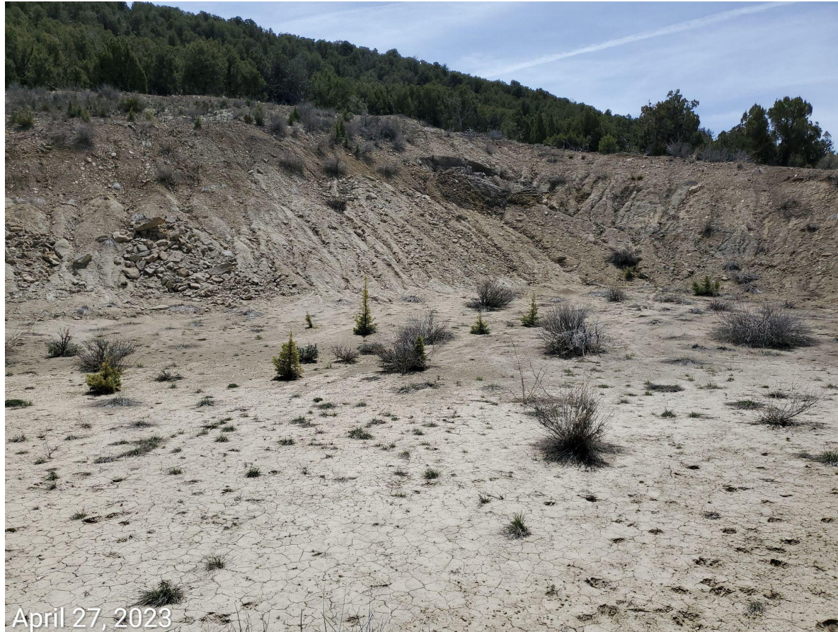
Photo 3: Photo taken from the Location, facing south. Photo shows stormwater and erosion control BMPs on the Location, including the cut slopes, remain missing or insufficient. Erosion degradation and mass soil movement has persisted.