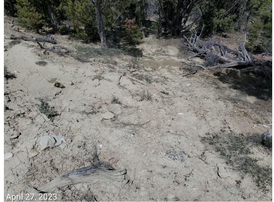
Photo 12: See comments under photo 10. Photo right shows sediment discharge/deposition from the access road.