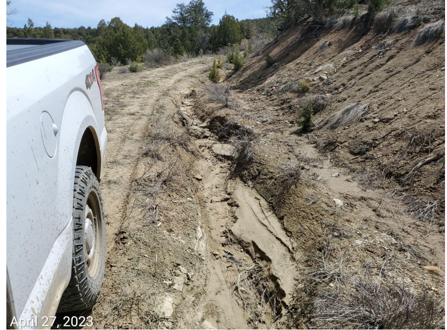
Photo 10: Photos 10-12 taken from the access road. Photos examples showing final reclamation including, but not limited to, compaction alleviation, recontouring/regrading and reclaiming has not been conducted on the entire access road. Photos also show erosion degradation at access road due to inadequate stormwater management and slope stabilization.