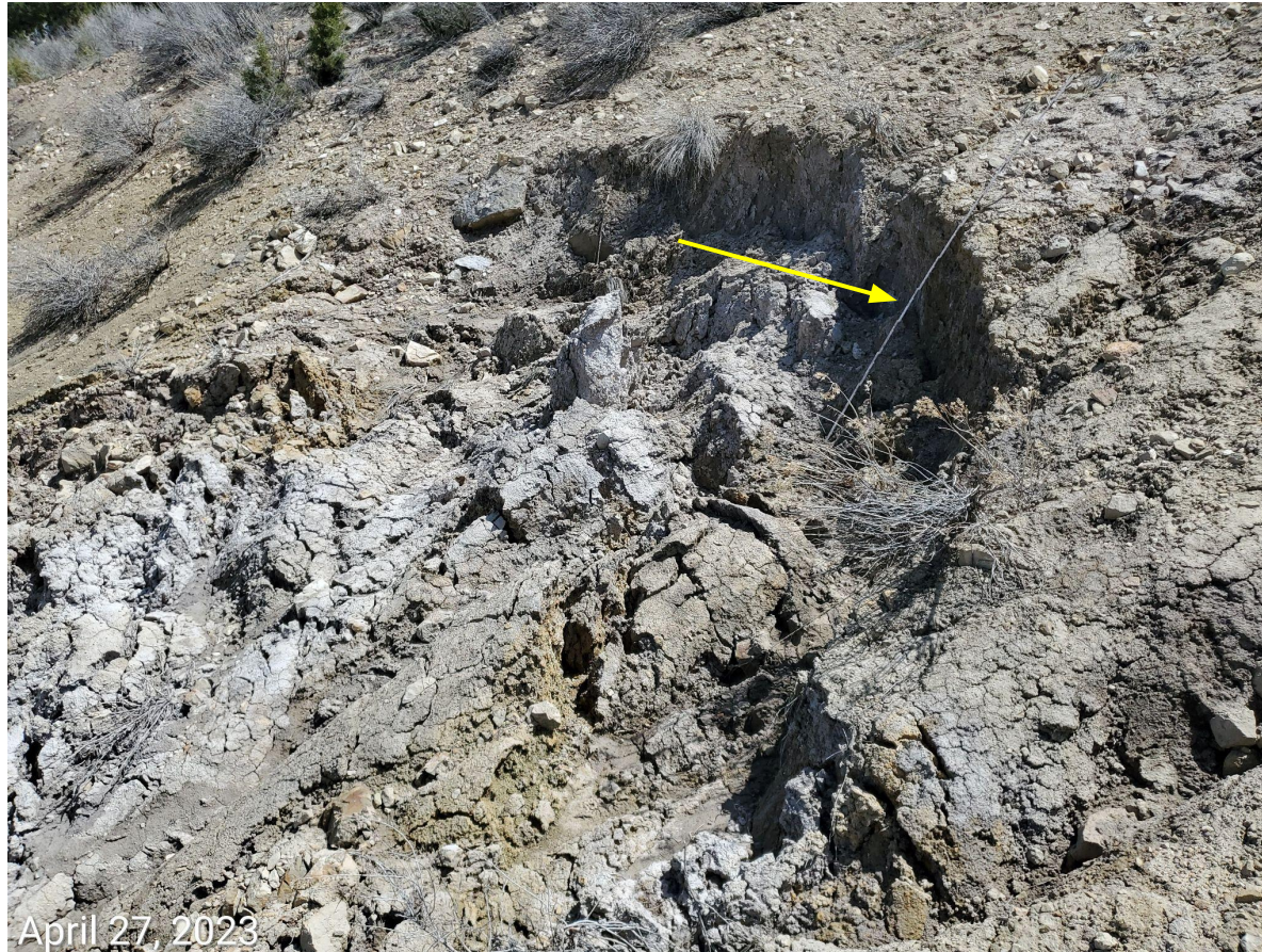
Photo 5: See comments under photo 3. 6 foot measuring stick (arrow) used for reference.