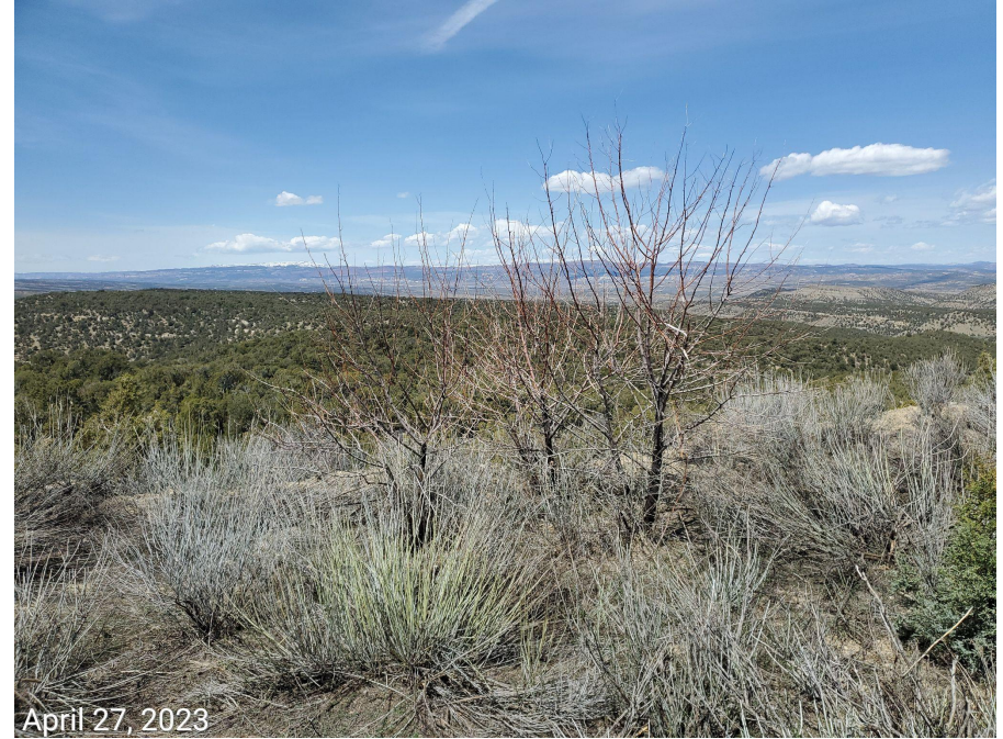
Photo 7: Photos taken from the north end of the Location. Photo provides examples of multiple Russian Olive plants observed established on the Location, and access road. Plant is an Undesirable Plant Species; pursuant to Rule 606.c, Operator shall keep Locations free of all Undesirable Plant Species