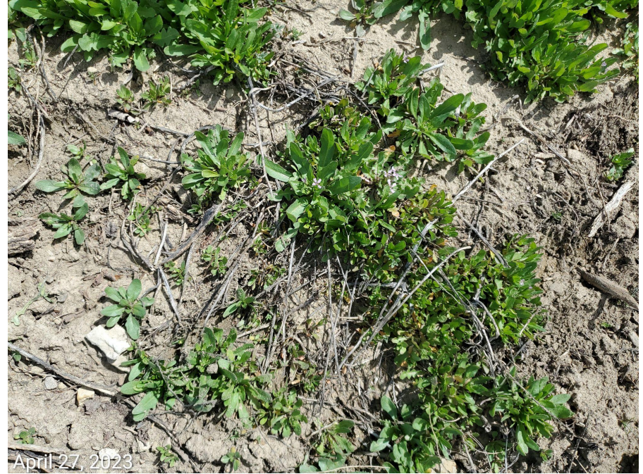
Photo 3: Photos taken from the cut slope/soil stockpile on the northeast end of the Location. Vegetation observed on the soil stockpile predominantly Undesirable Plant Species (Purple Mustard).