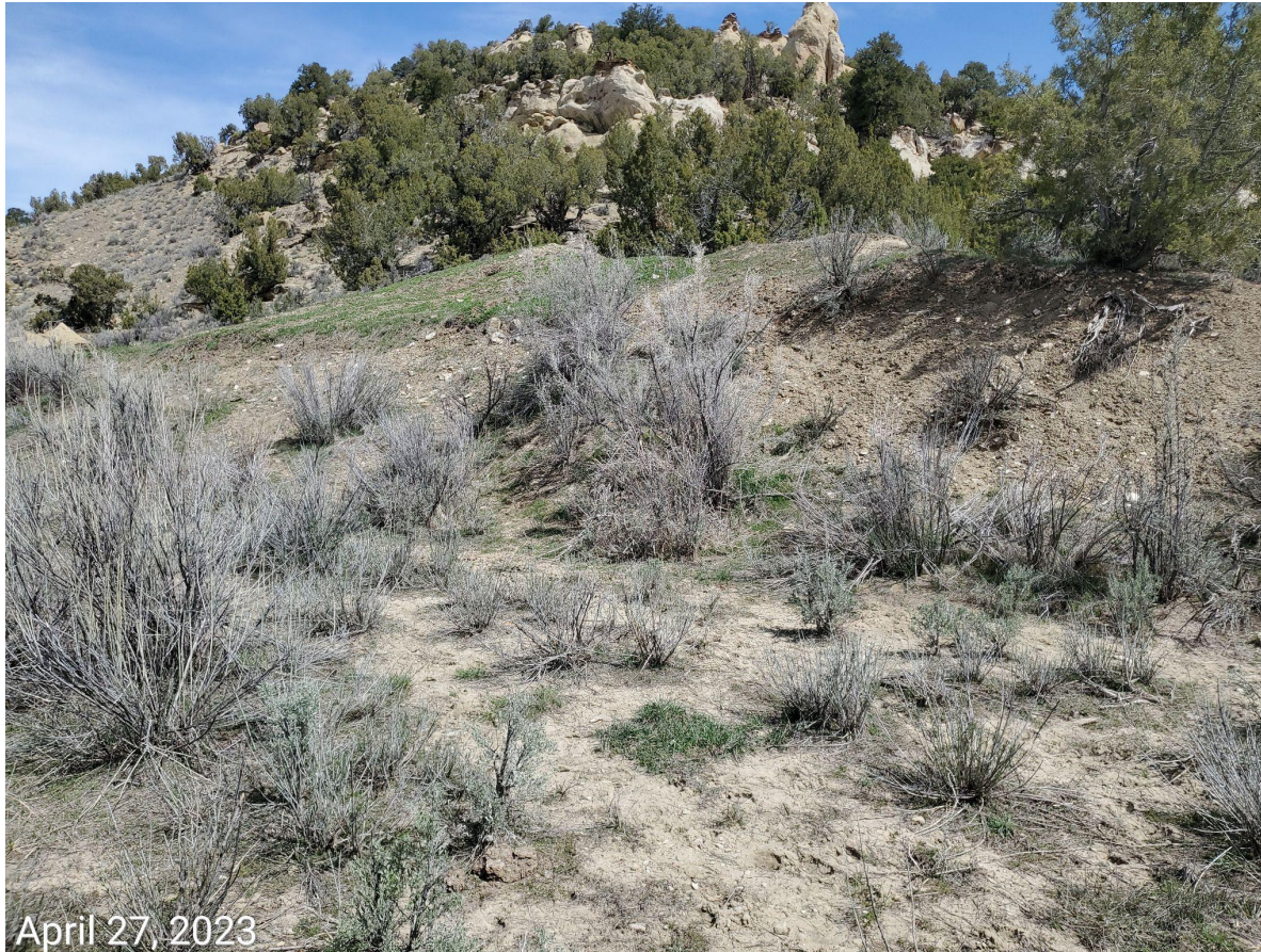
Photo 5: Cut slopes and soil stockpile on the northeast end of the Location.