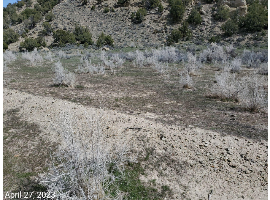
Photo 1: Photos 1-2 taken from the southwest end of the Location. Photos provide an overview of the Location from northwest, north, east to southeast. Photos show final reclamation including, but not limited to, compaction alleviation, recontouring/regrading and reclaiming has not been conducted on the Location.