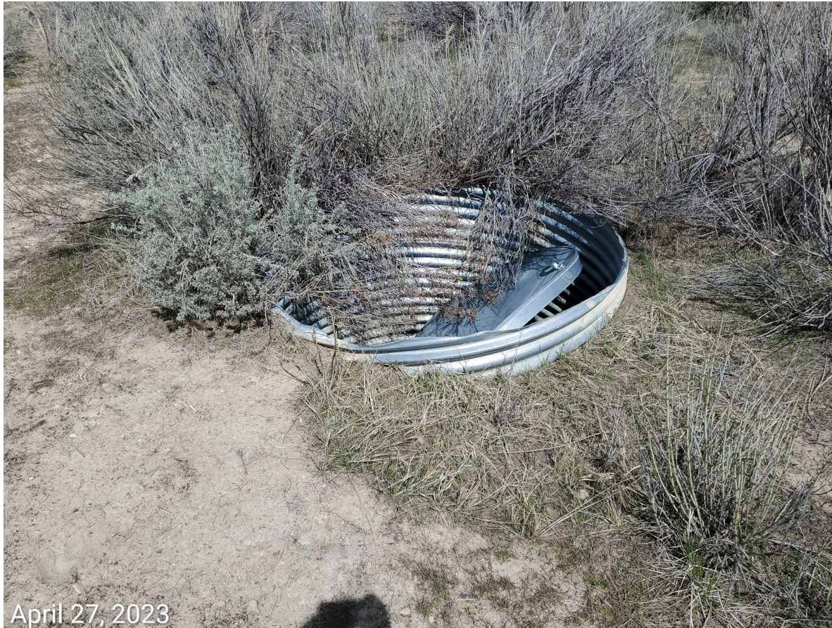
Photo 8: Photo taken from the south end of the Location. Photo shows cellar is not properly covered to prevent wildlife access.