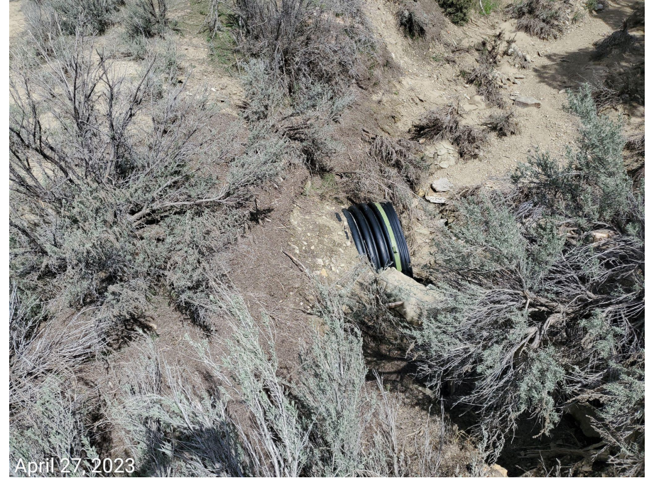
Photo 9: Photos taken from the access road. Photos examples showing final reclamation including, but not limited to, compaction alleviation, recontouring/regrading and reclaiming has not been conducted on the access road. Photos also examples of culverts observed remaining along the access road.