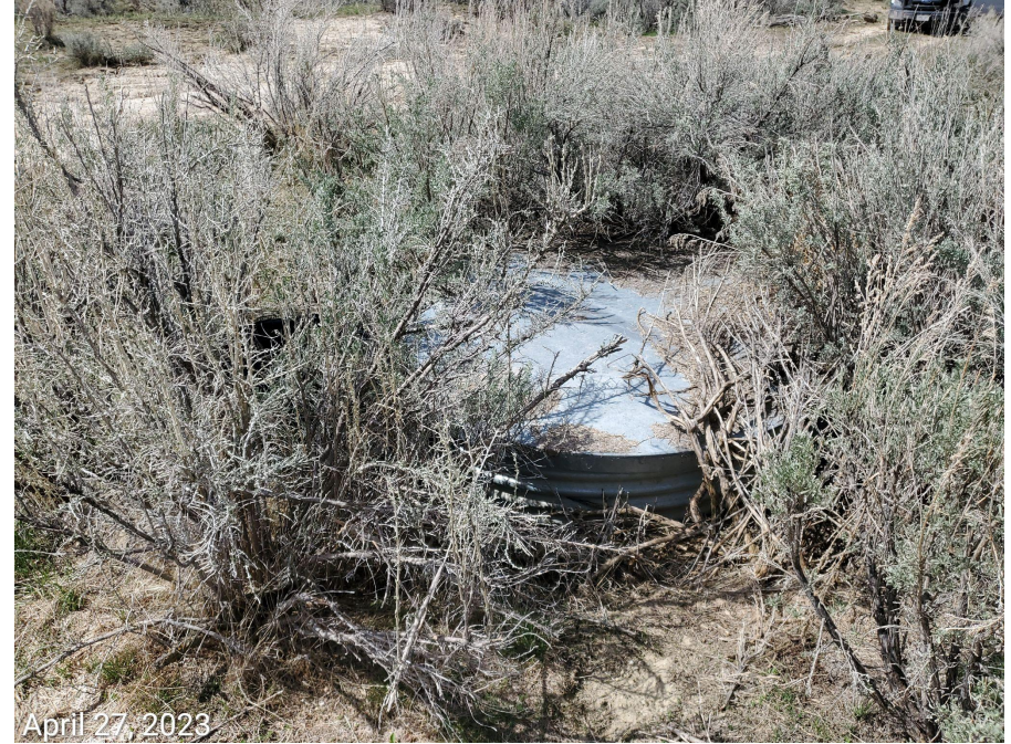
Photo 7: Photos examples showing surface equipment remaining on the Location and access road.