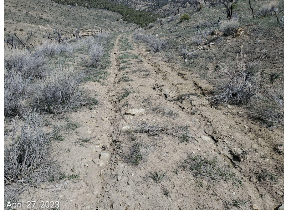
Photo 10: Photos 10-12 taken from the access road. Photos examples showing final reclamation including, but not limited to, compaction alleviation, recontouring/regrading and reclaiming has not been conducted on the entire access road. Photos also show erosion degradation at access road due to inadequate stormwater management. Access road intersects with Co Rd 122 at 40.076157°/-108.637129°.