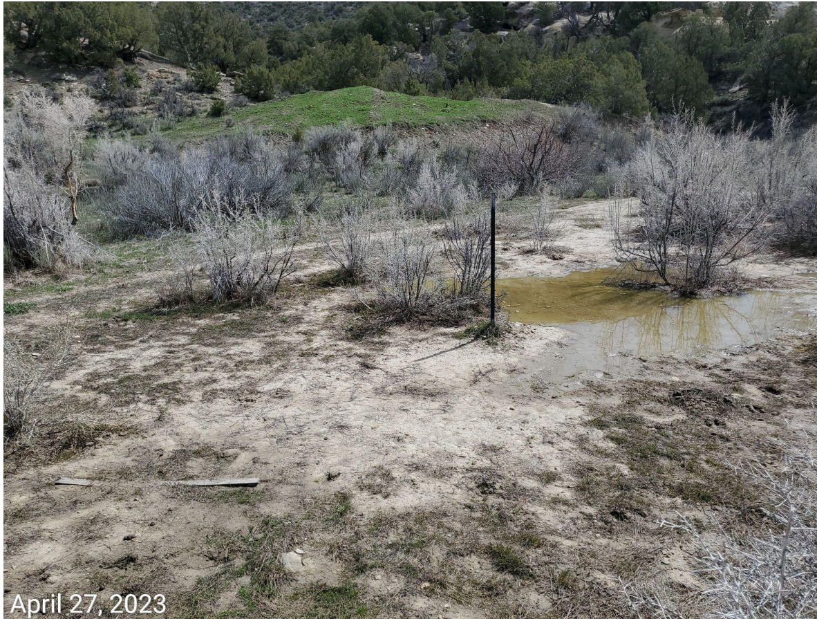
Photo 6: Well marker. Well has not been drilled. All Form 2 and Federal “permits to drill” on file for the Location have expired.