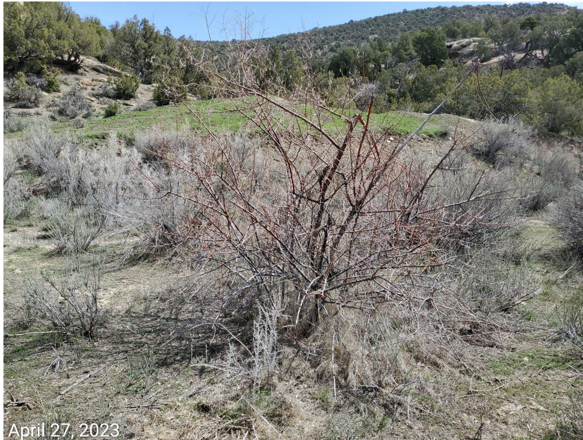
Photo 4: Undesirable Plant Species (Russian Olive) observed on Location.