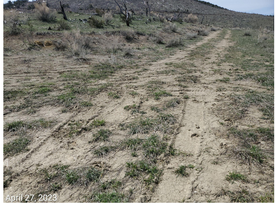
Photo 6: Photo left shows access road leading to the Location. Photo right shows main access road that continues to additional Genesis Locations within Fletcher Gulch. Access road intersects with Co Rd 122 at 40.076157^{\circ}/-108.637129^{\circ}