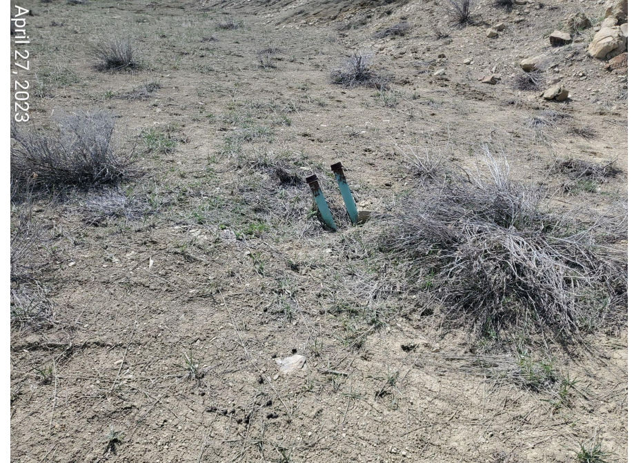
Photo 8: Photos examples showing surface equipment remaining on the Location.