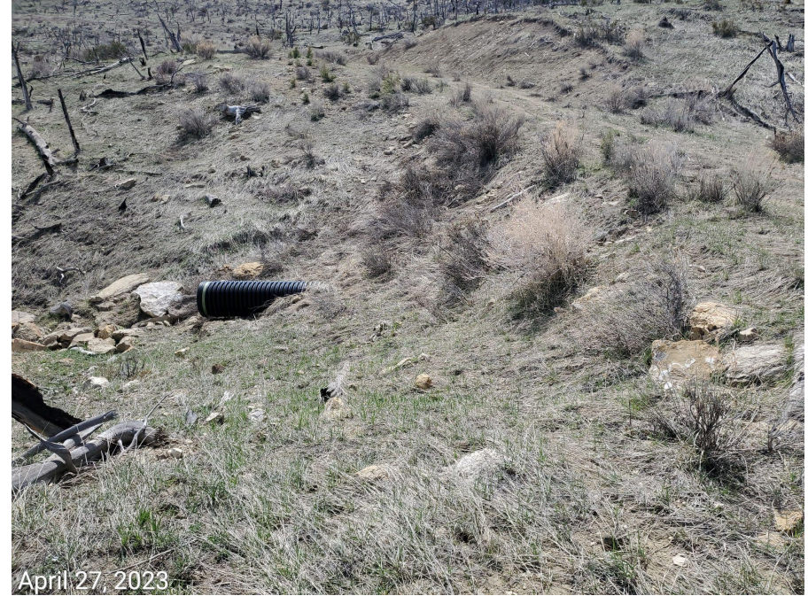
Photo 12: See comments under photo 10. Photos also examples of many culverts observed remaining along the access road.