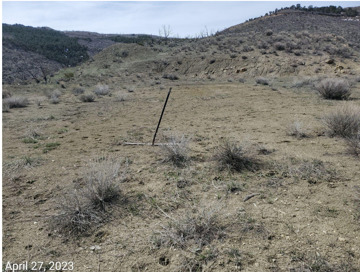
Photo 7: Well marker. Well has not been drilled. All Form 2 and Federal “permits to drill” on file for the Location have expired.