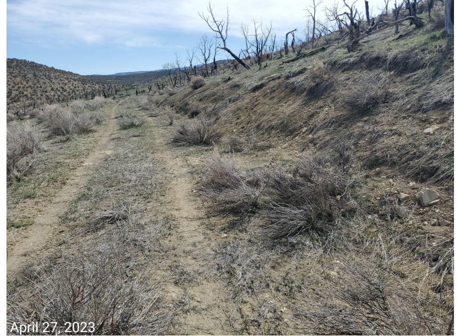
Photo 10: Photos taken from the access road. Photos examples showing final reclamation including, but not limited to, compaction alleviation, recontouring/regrading and reclaiming has not been conducted on the access road. Slopes lack stabilization.