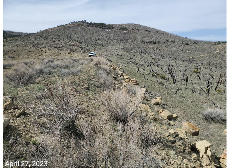
Photo 3: Photos example showing fill slopes of the Location. Photo left taken from the east end of the Location; photo right taken from the west end. Final reclamation including, but not limited to, compaction alleviation, recontouring/regrading and reclaiming has not been conducted on the Location.