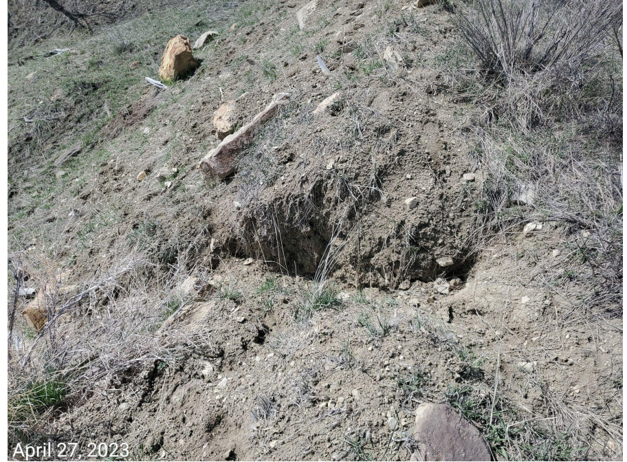
Photo 6: Photo taken from the fill slopes on the east end of the Location. Stormwater and erosion control BMPs to control stormwater runoff in a manner that minimizes erosion, transport of sediment offsite, and site degradation are missing or insufficient; photo shows stormwater runoff from the Location has resulted in gully erosion and off-site sediment transport.