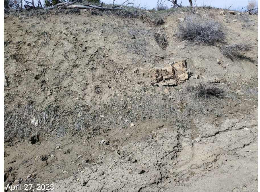
Photo 11: See comments under photo 10. Photo shows erosion degradation observed along cutslopes of the access road; slopes lack stabilization.