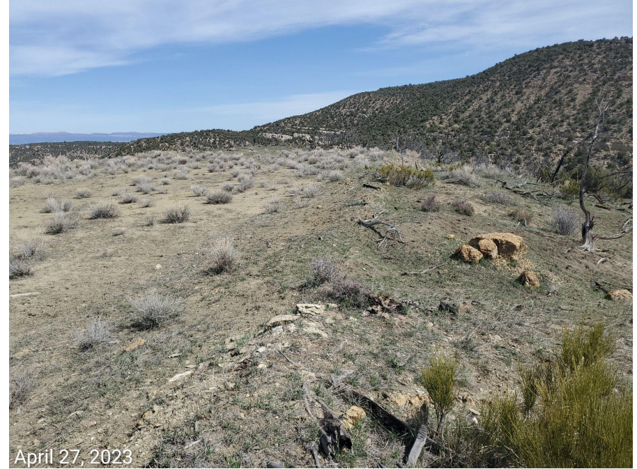
Photo 2: Photos taken from the southeast end of the Location, facing west and north. Photos show final reclamation including, but not limited to, compaction alleviation, recontouring/regrading and reclaiming has not been conducted on the Location. Photo left shows fill cut slopes. Photo right shows fill slopes.