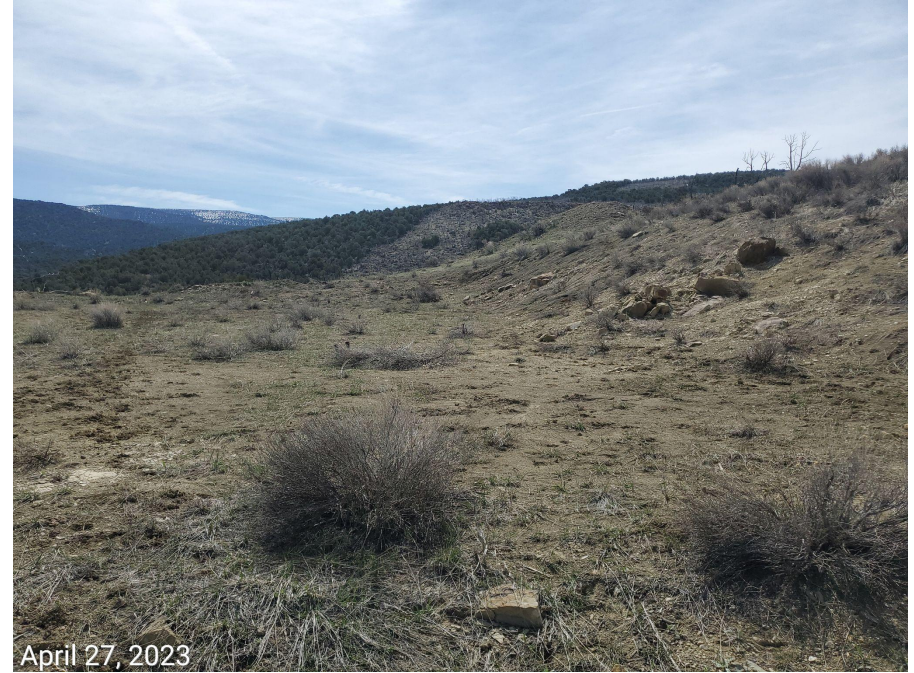
Photo 1: Photos taken from the southwest end of the Location, facing north and east. Photos show final reclamation including, but not limited to, compaction alleviation, recontouring/regrading and reclaiming has not been conducted on the Location. Photo left shows fill slopes. Photo right shows cut slopes.