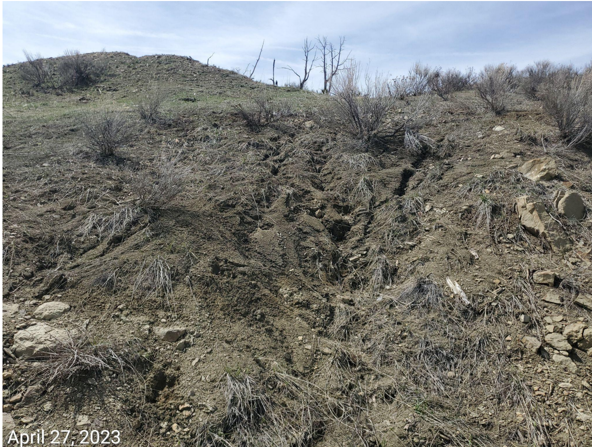
Photo 5: See comments under photo 4. Erosion degradation at the cut slopes of the Location; slopes lack stabilization.