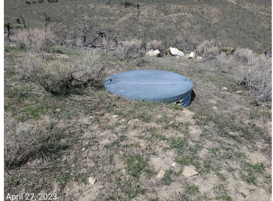
Photo 9: Photos examples showing surface equipment remaining on the Location and access road.