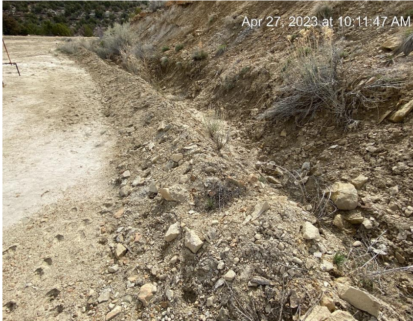
Diversion ditch along unstable slope