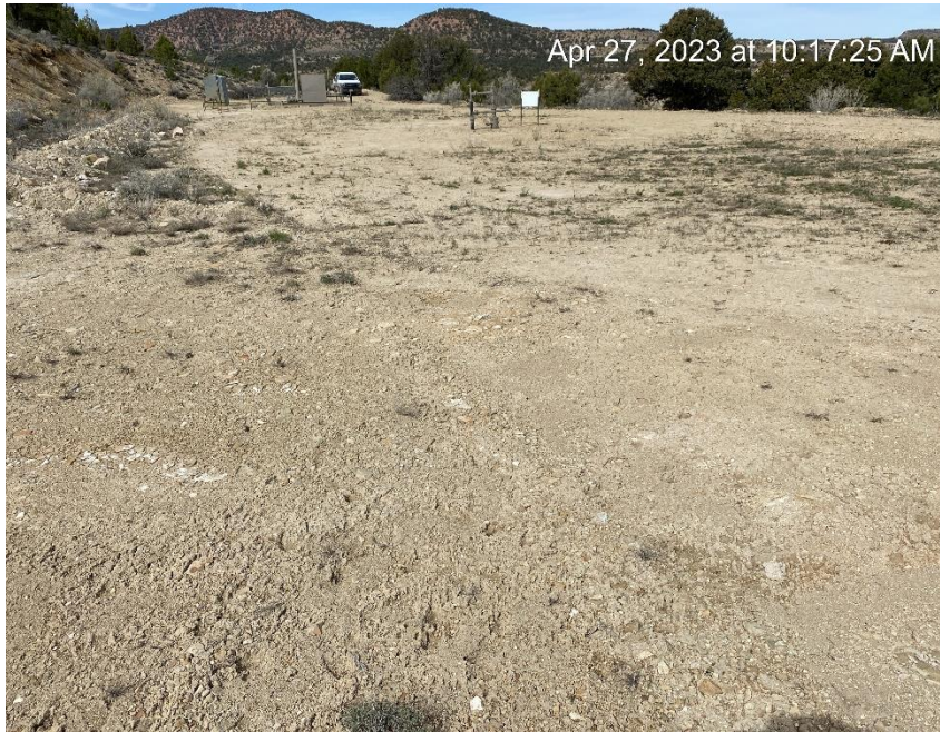
Photo from Southeast corner of location