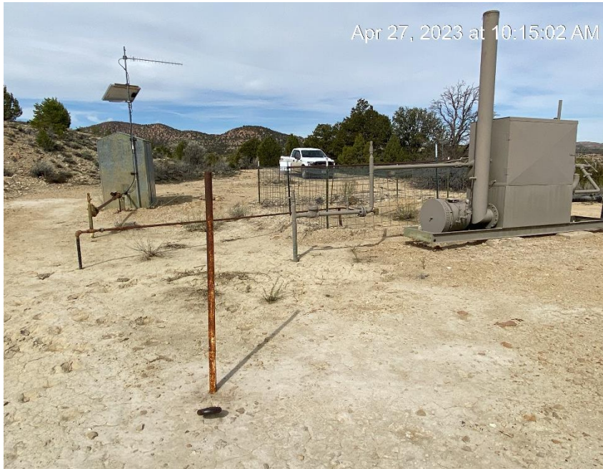
Production equipment. Blowdown pit ID #101783