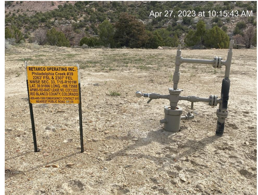
Well sign and wellhead