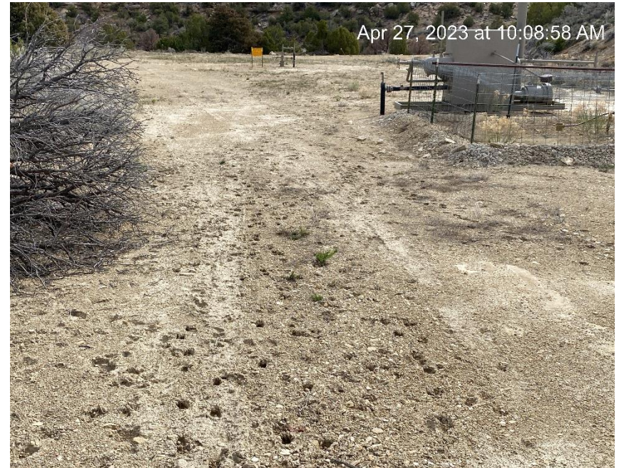
Entrance to location