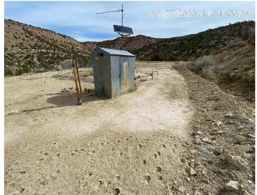
Photo from Southwest corner of location