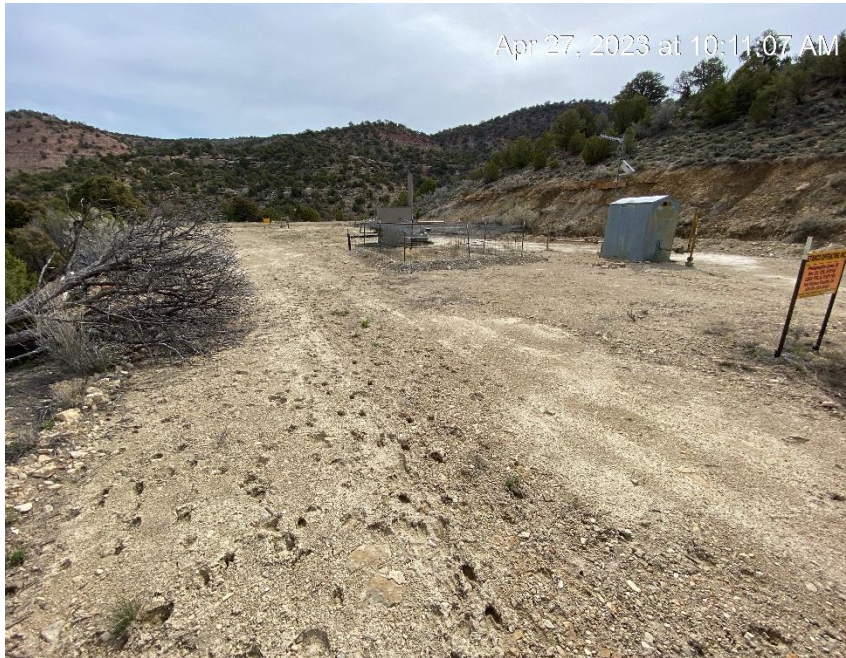
Photo from Northwest corner of location