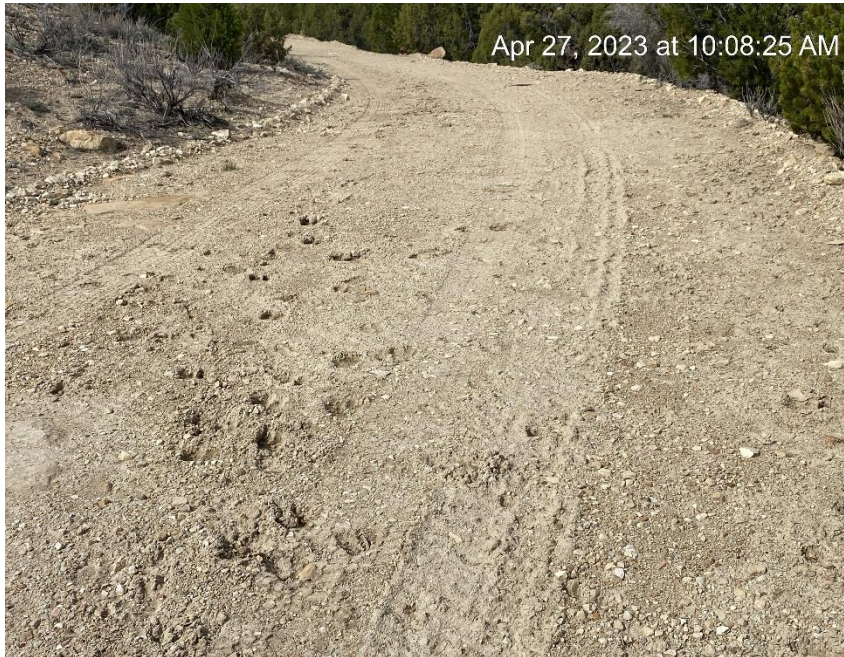
Access road to location.