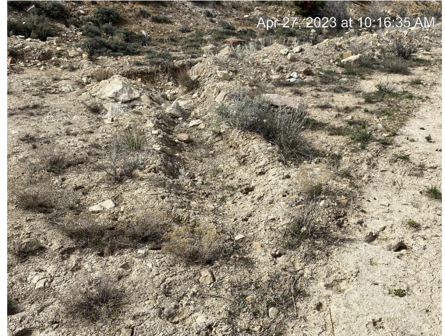
Diversion ditch drains across location