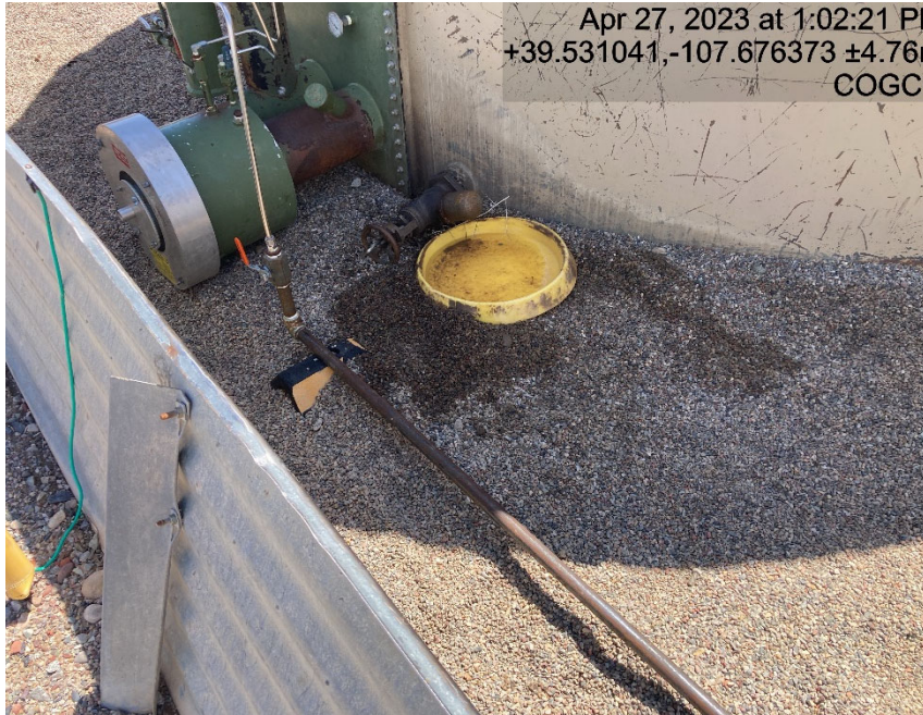
Staining and debris