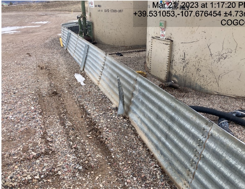
Previous inspection photo of secondary containment