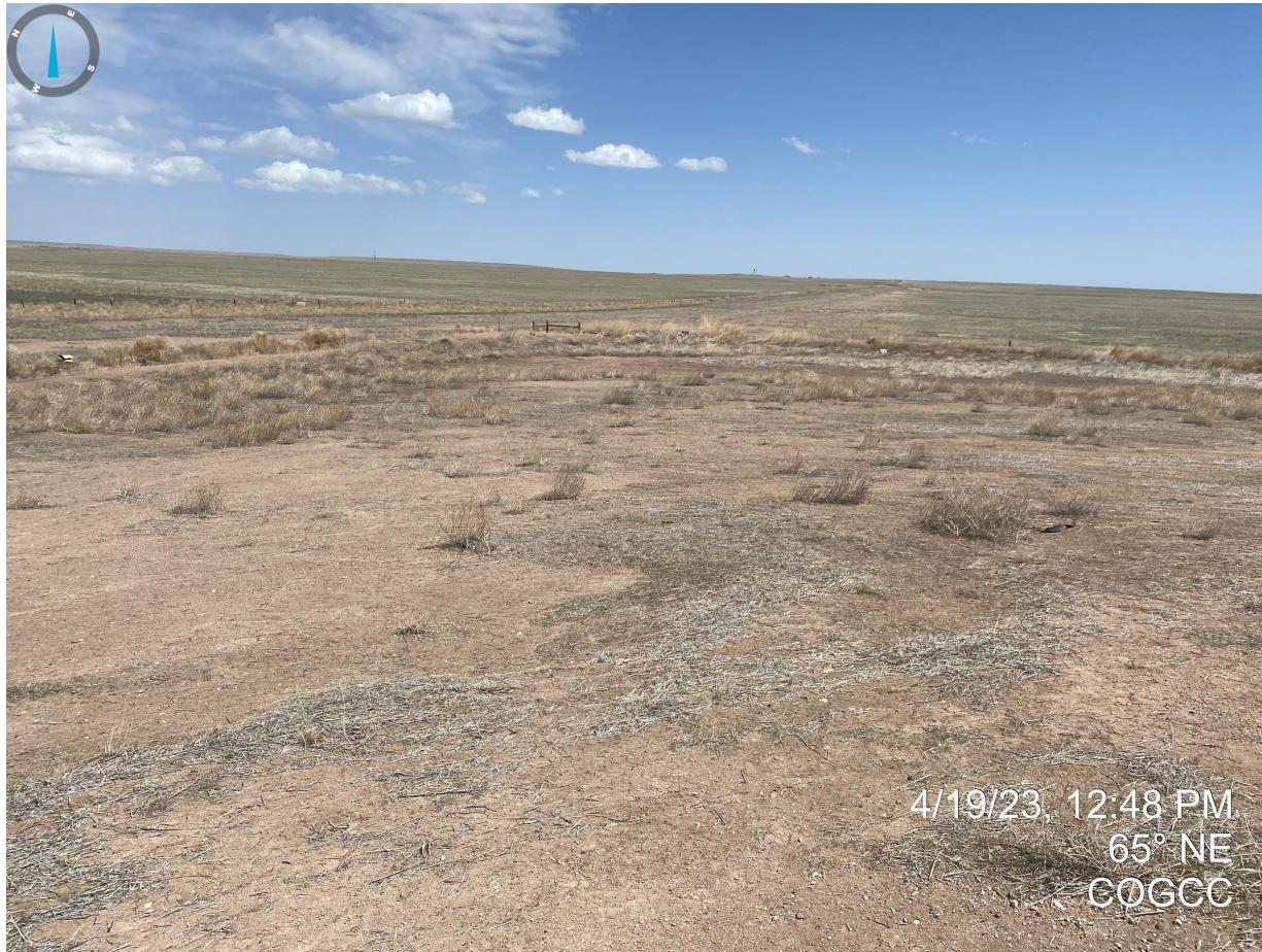
Photo 2. Facing northeast near the northeast corner. See comments in Photo 1.