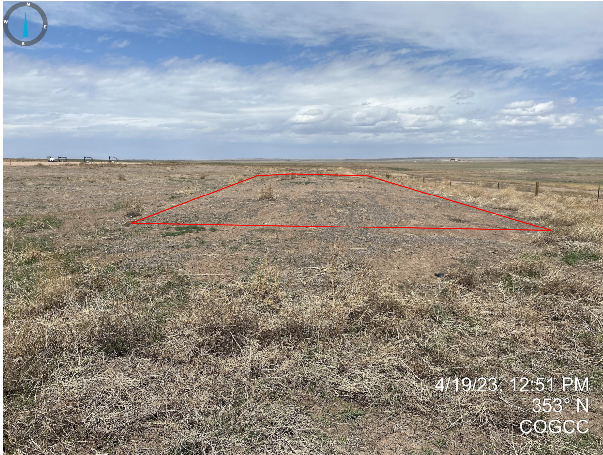
Photo 4. Facing north towards topsoil stockpile (outlined in red). See comments in Photo 1.