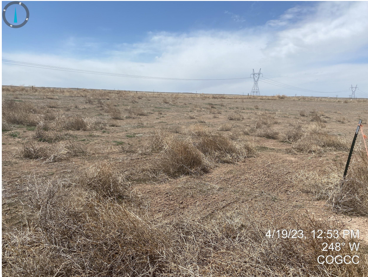
Photo 5. Facing west towards the southwest corner. See comments in Photo 1.