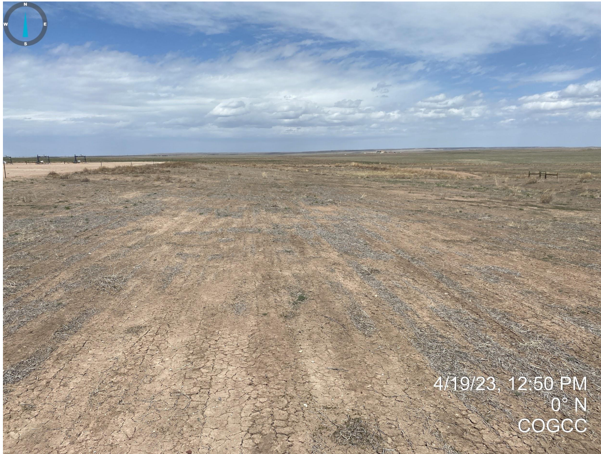
Photo 3. Facing north from the center/eastern portion. See comments in Photo 1.