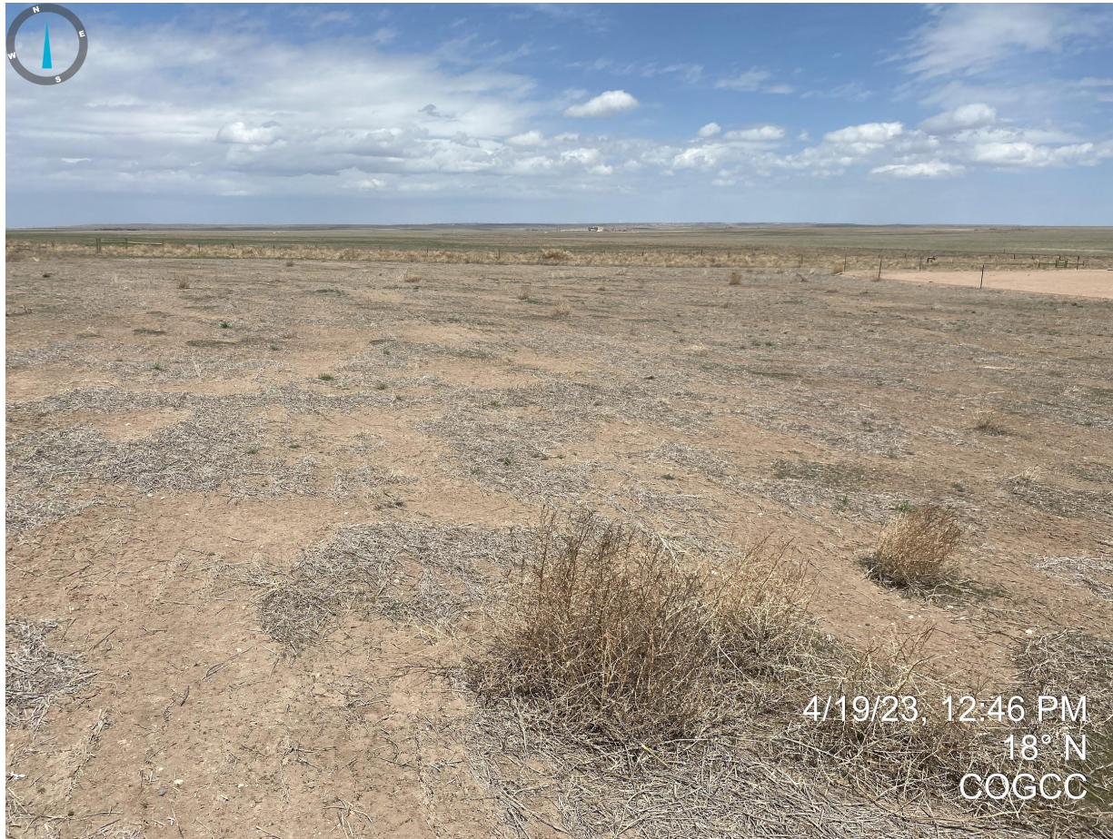
Photo 1. Facing north near the entrance. Interim areas do not appear to be progressing towards reclamation standards with little desirable plant species evident and large areas of bare soil. Additional reclamation activities will need to be performed to meet Rule 1003 standards.