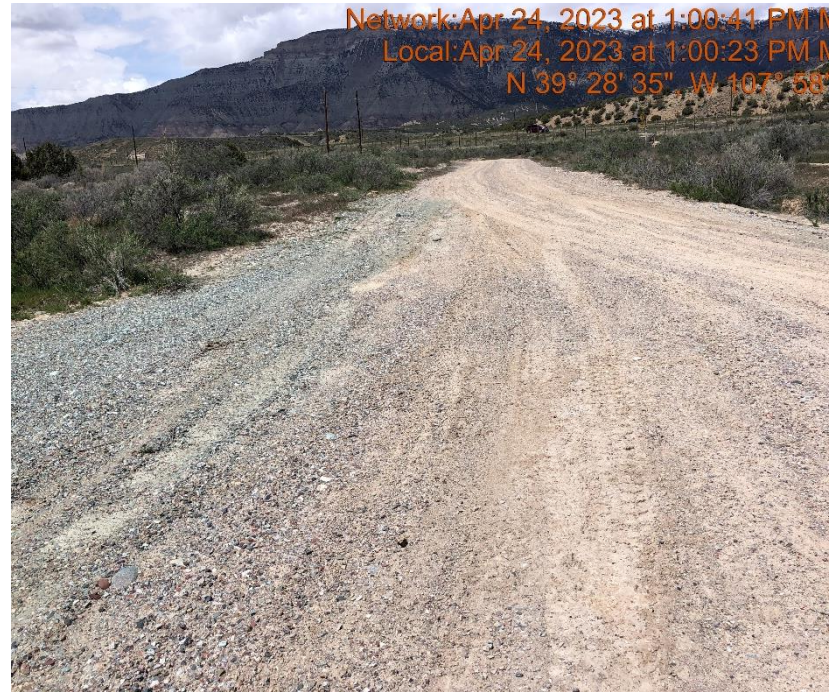
Photo #9735 Insufficient tracking BMP to minimize the transport of sediment.