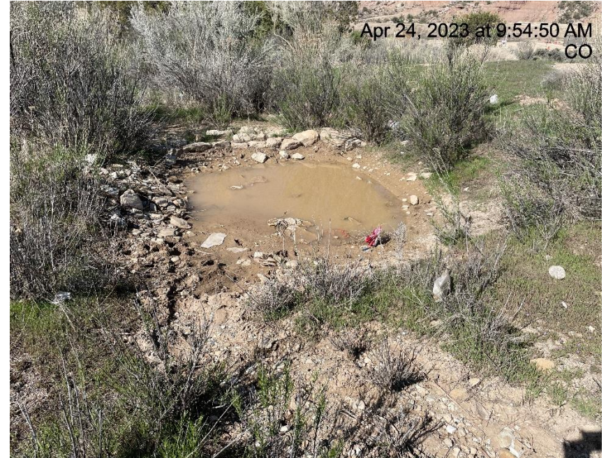
Photo # 6142 Sediment trap needs maintenance (West side of pad approximately 15-20 ft from tank battery)