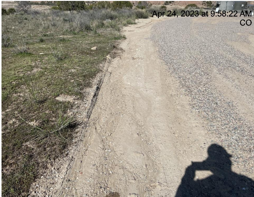
Photo # 6147 Erosion & transport of sediment on spur road near entrance to location