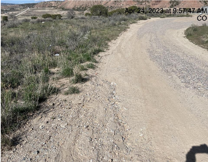
Photo # 6144 Erosion & transport of sediment on spur road near entrance to location