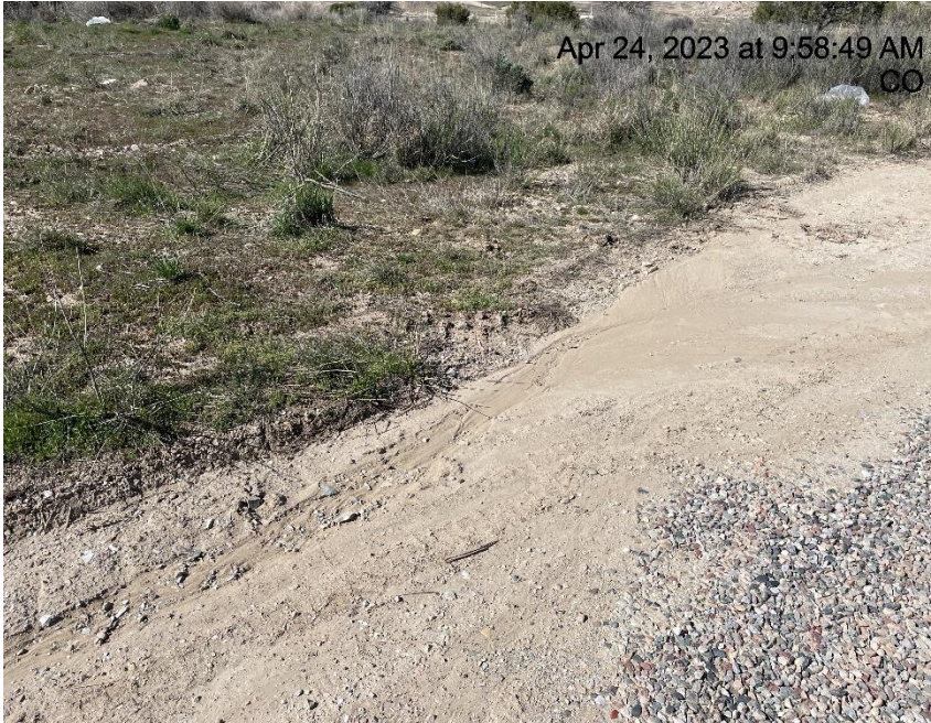
Photo # 6151 Erosion & transport of sediment on spur road near entrance to location