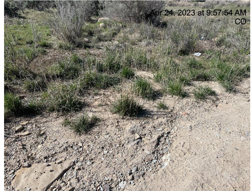
Photo # 6145 Erosion & transport of sediment on spur road near entrance to location