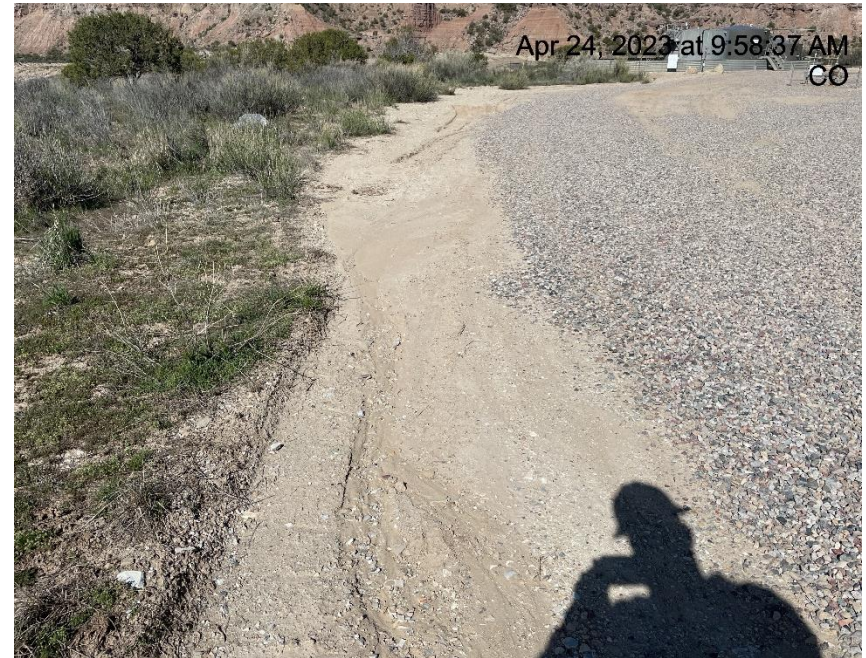
Photo 6149 Erosion & transport of sediment on spur road near entrance to location