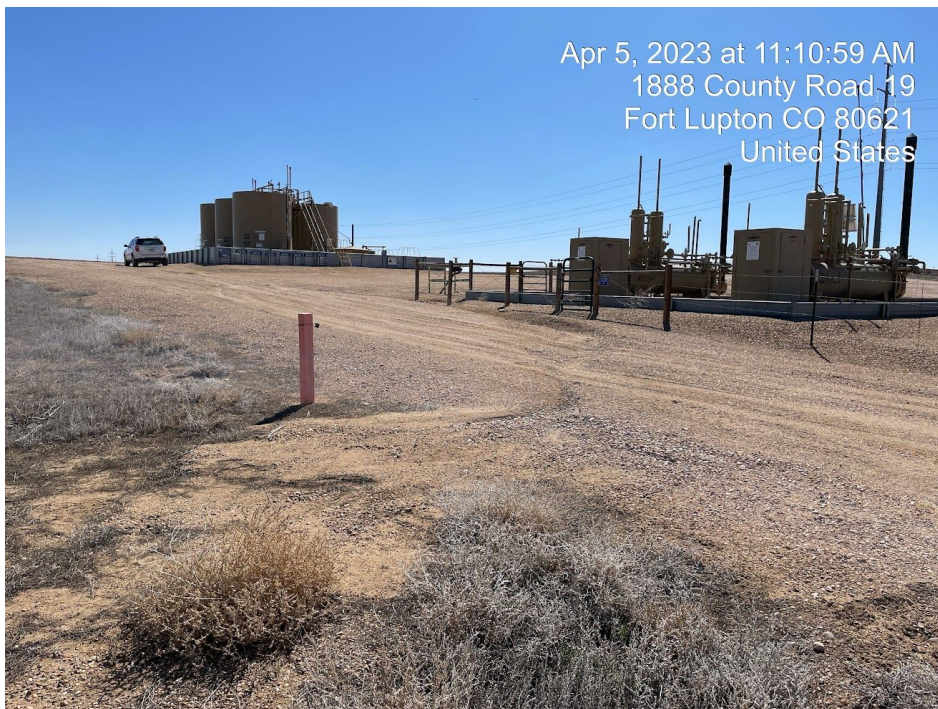
Photo 4. Photo taken of drainage ditch allowing sediment to leave site.