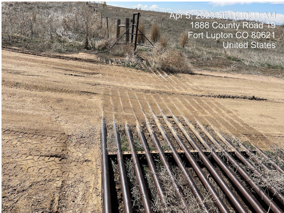
Photo 2. Photo taken of cattle guard at entrance of site.