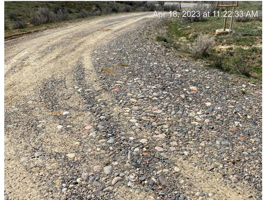
Access road from highway 64 to location