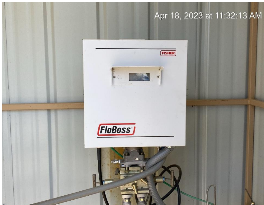
No gas meter calibration card visibly displayed