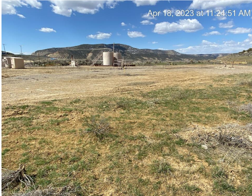
Northeast corner view