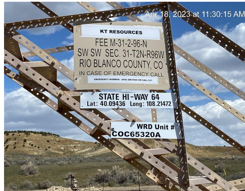
API Number missing from tank battery sign