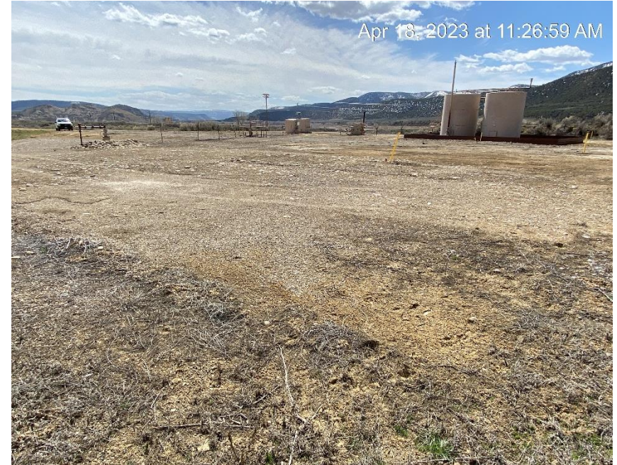
Northwest corner view