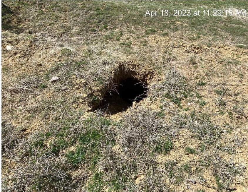
Edge of location sinkhole