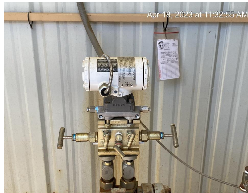
Calibration card visibly displayed