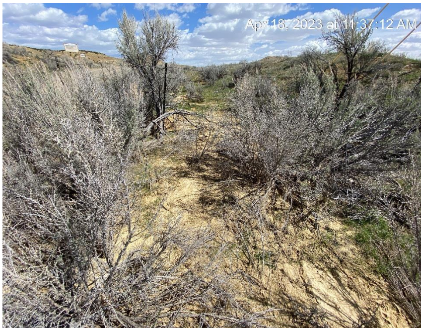
Sediment migration ditch from location to highway 64