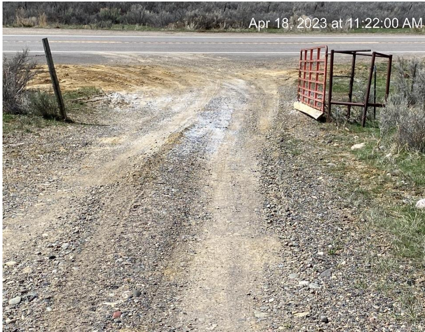
Access off highway 64