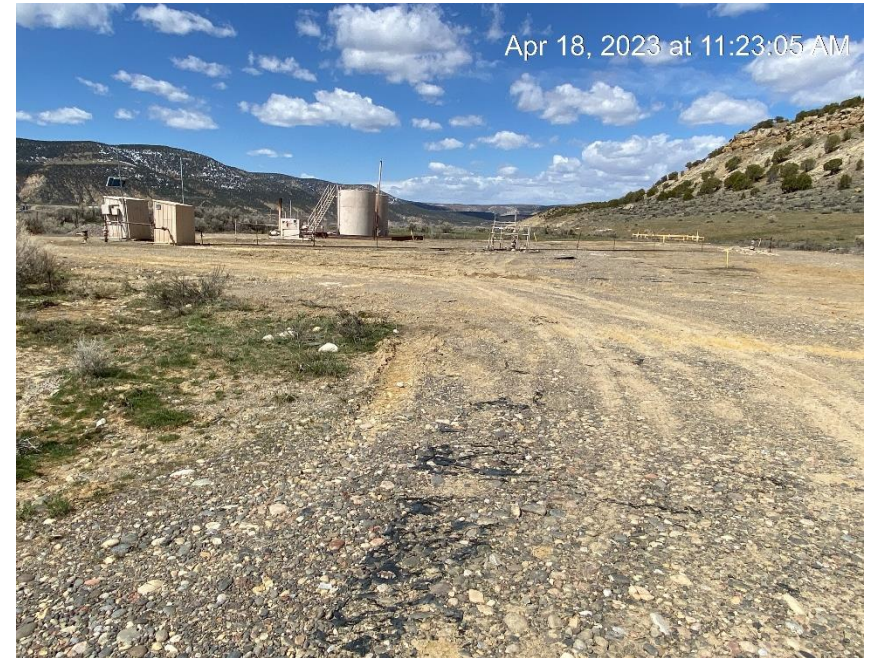
Entrance to location