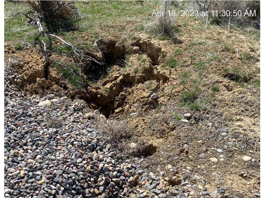
Sinkhole at edge of location