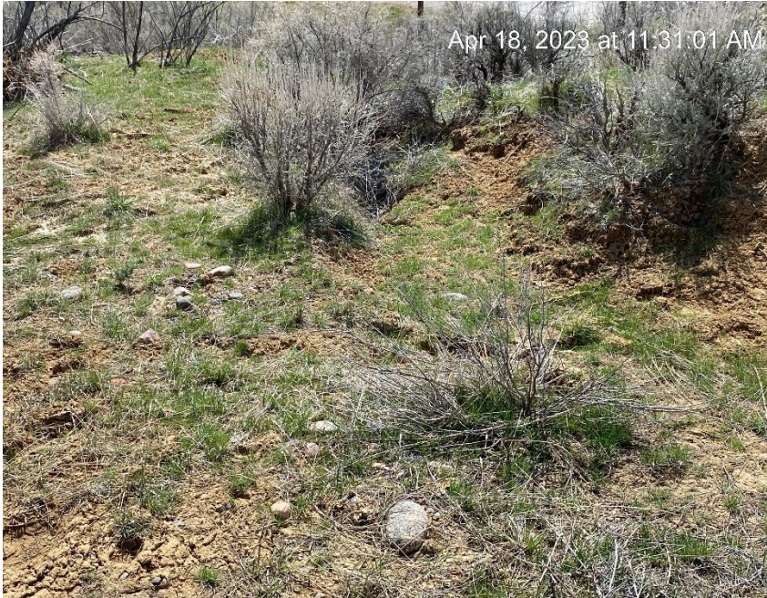
Erosion ditch off location