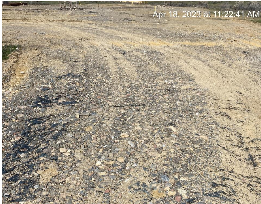
Access road entrance to location