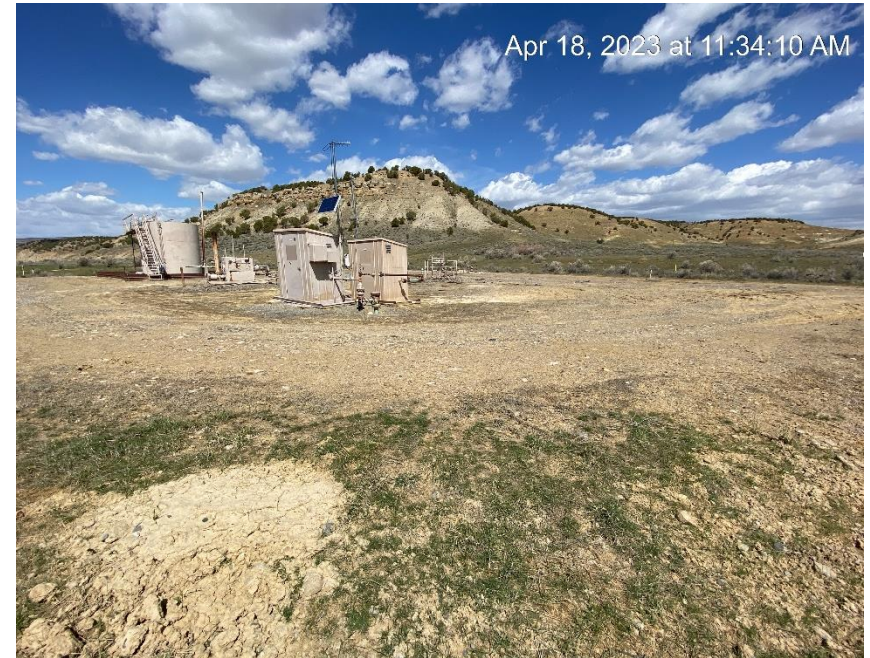
Southeast corner view