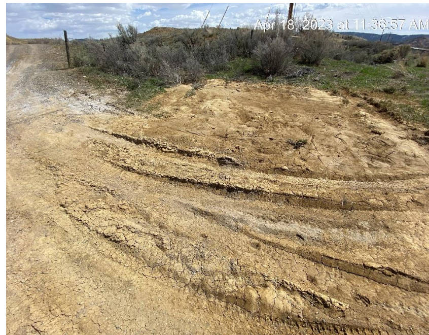
Sediment migration from location to highway 64