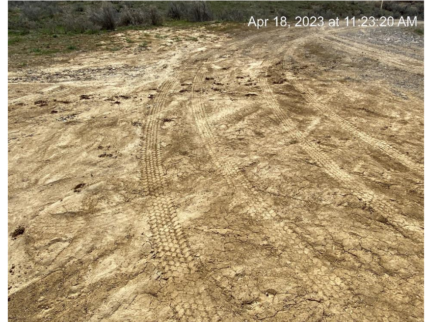
Sediment migration from location and hillside