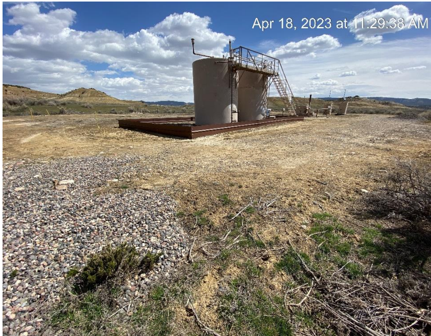
Southwest corner view