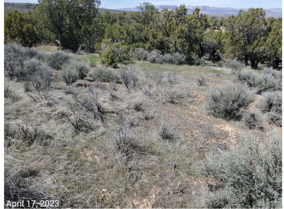
Photo 5: Photo left taken from the spill area north of the Location. Photo right taken from areas immediately adjacent to the spill that were not impacted. Photo shows spill areas remain bare- unable to find evidence that spill area has been remediated and reclaimed.