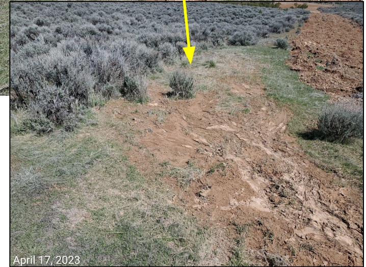
Photo 10: Stormwater and erosion control BMPs at the access road remain missing or insufficient. Photos right show sediment transport/deposition on undisturbed adjacent areas.