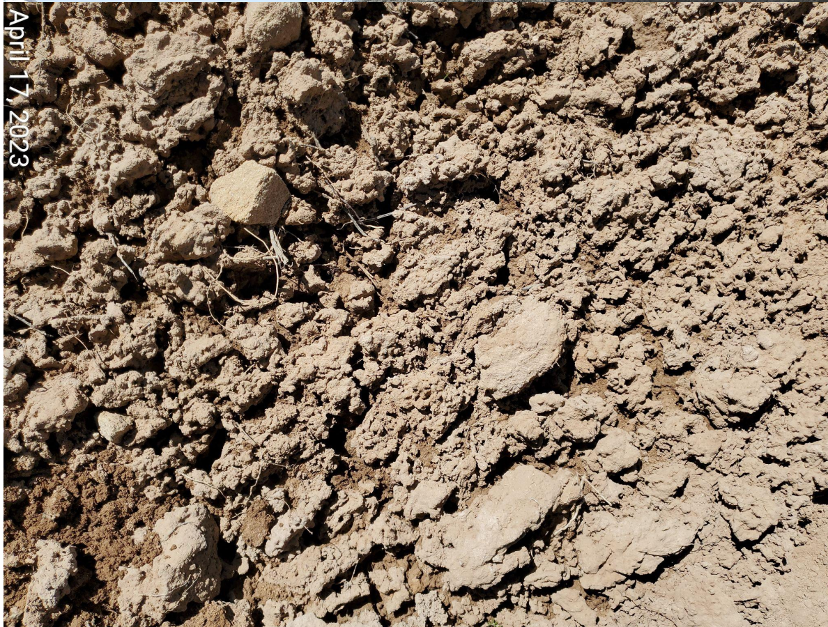
Photo 4: Photo shows an example of the soils surface, taken from the reclamation areas of the Location. Reclamation Specialist was unable to observe seed within the soil surface and subsurface; seeding activities not apparent, and do not appear to have been conducted.