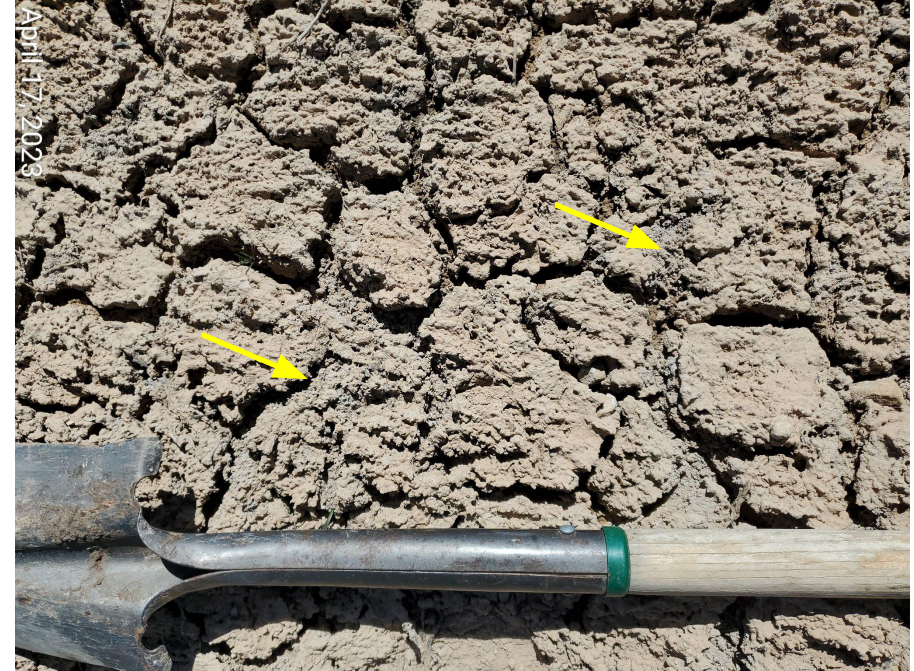
Photo 6: Photos taken from the spill area north of the Location. Photos show waste material remains at spill; spill area has not been remediated or reclaimed.