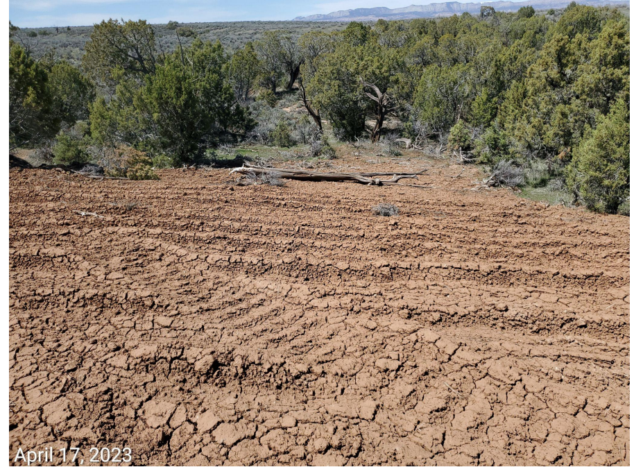
Photo 7: Photos taken from the Location. Photos examples showing stormwater and erosion control BMPs remain missing or insufficient; soils have been left exposed, unstabilized and at risk to wind/water erosion. BMPs to manage runoff and minimize off-site sediment transport along the perimeter also missing or insufficient; surface roughening alone inadequate.