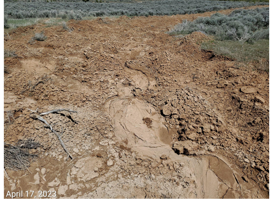
Photo 9: Erosion degradation, sediment deposition observed along access road; stormwater and erosion control BMPs missing or insufficient.