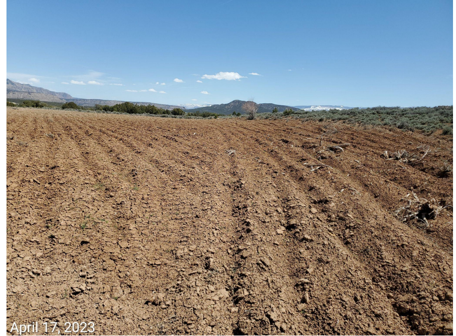
Photo 1: Photos taken from the west end of the Location, facing northeast and southeast. Photos shows Location has been recontoured, soils replaced, and decompacted.