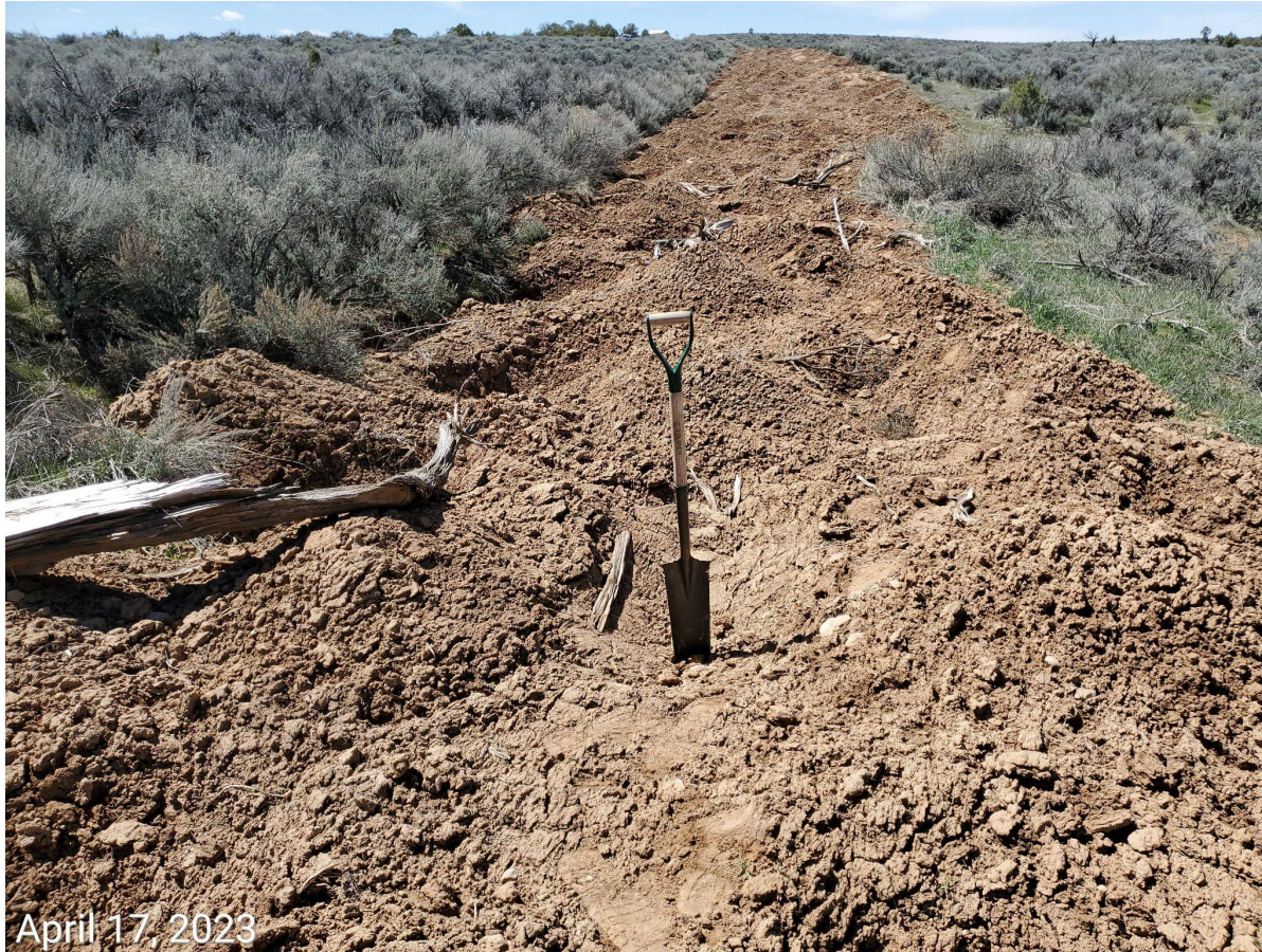
Photo 8: Photo taken from the access road. Photo shows Operator has re “pot-holed” the access road, resulting in large holes and soil piles; soils have been left unstabilized; access road has not been properly contoured and stabilized; seeding activities at access road not apparent.