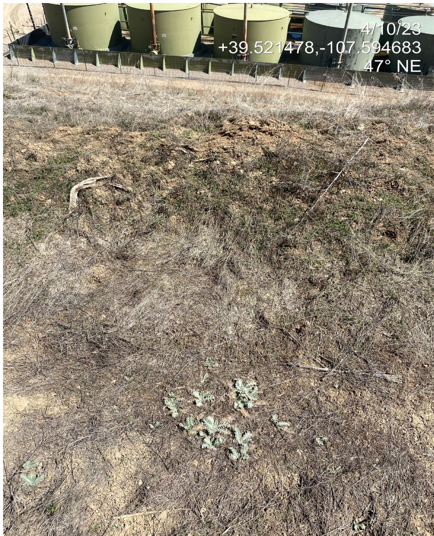
Photo 6. Photo shows the list B noxious weed Scotch thistle.