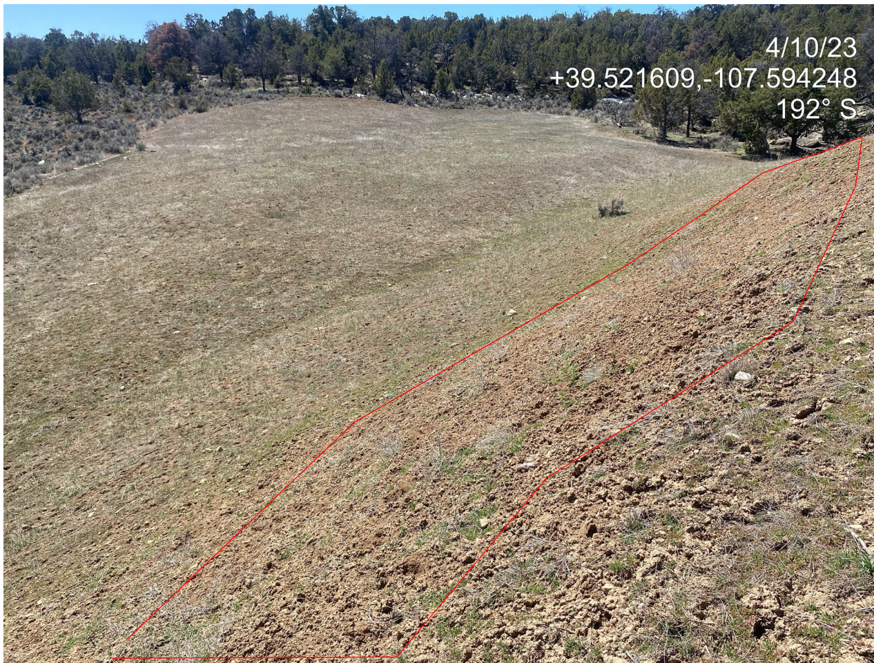
Photo 8. Photos show the interim area to the south. Perennial establishment is sparse in south facing areas.