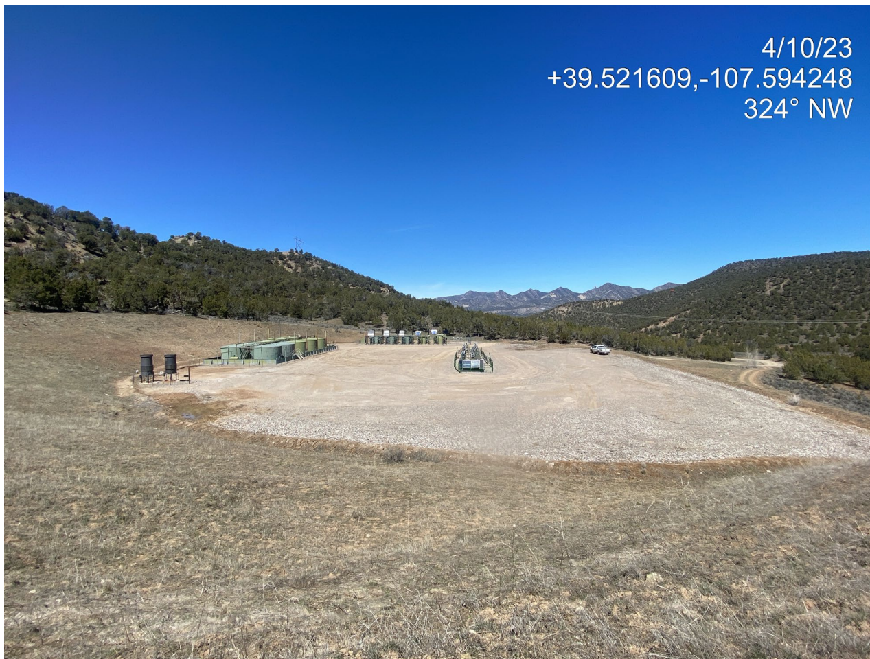
Photo 1. Photo taken from the south shows an overview of the location.