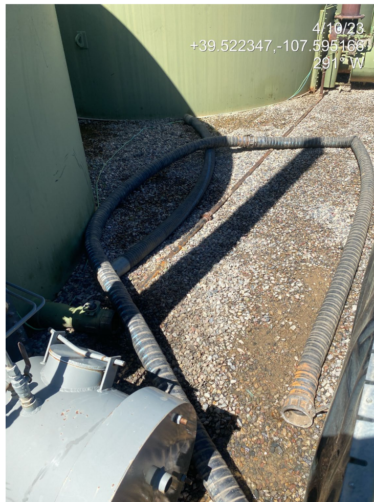
Photo 5. Photos staining adjacent to the tank battery, (left) and unused hose equipment within the tank battery containment (right).