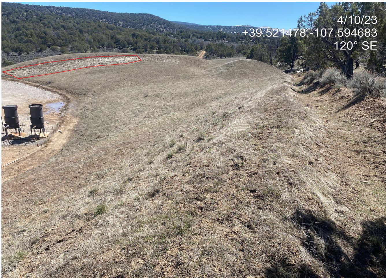
Photo 7. Photos show the interim areas to the west and south. The lightest colored vegetation is cheatgrass.