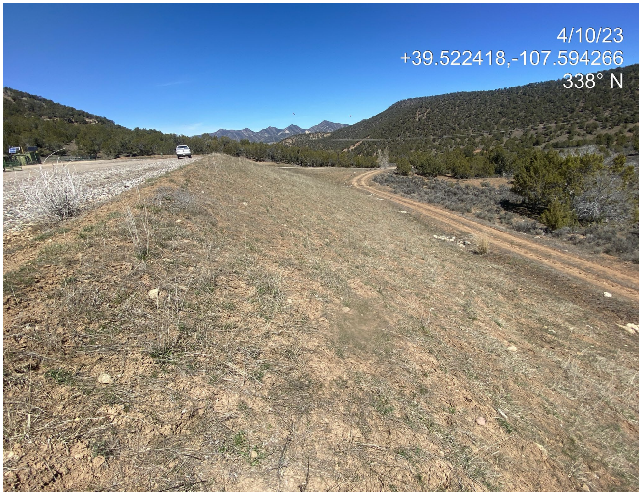
Photo 9. Photos show the interim area to the east. Perennial grasses appear established.