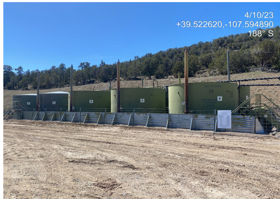
Photo 2. Photos show production areas.