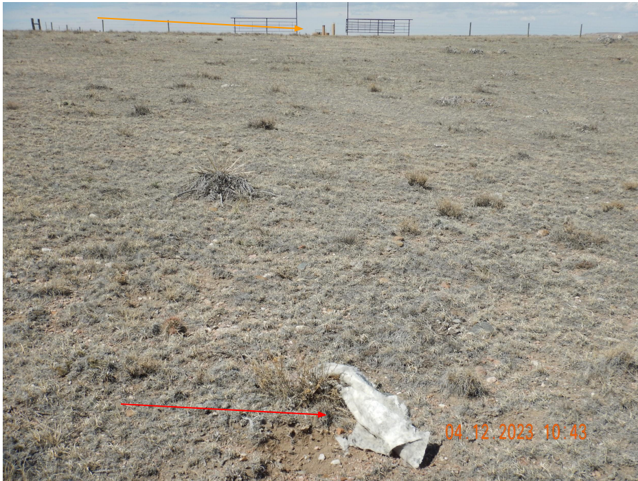
Photo 5. Photo taken southeast of location (orange arrow), facing Northwest. Photo illustrates trash that has blown off location. COGCC staff took nine photos and observed trash in other pastures, which are Pawnee National Grassland.