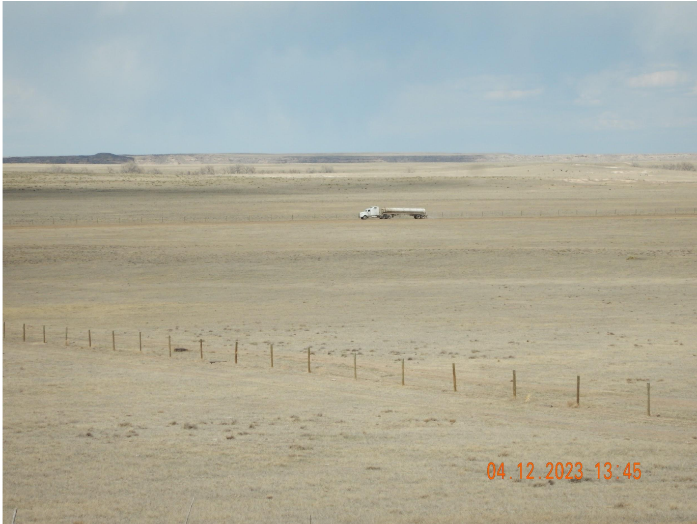
Photo 3. Photo taken of a section of the access road, facing Northeast. Photo illustrates a water truck that is watering the road.