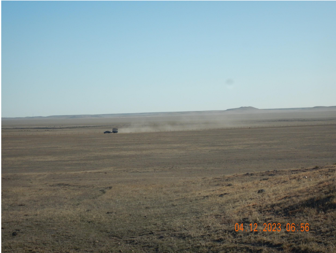
Photo 1. Photo taken of a section of the access road, facing Northeast. Photo illustrates fugitive dust from the what appears to be the crew raking weeds along the ditch. COGCC also has video evidence.