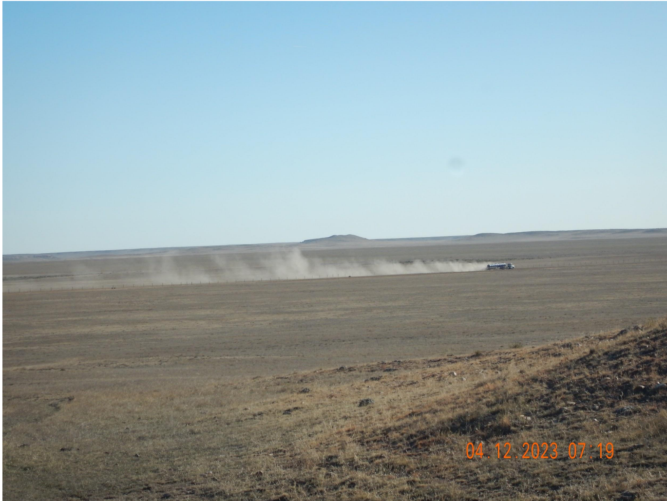
Photo 2. Photo taken of a section of the access road, facing Northeast. Photo illustrates fugitive dust from the produced water truck which left the location. COGCC also has video evidence.