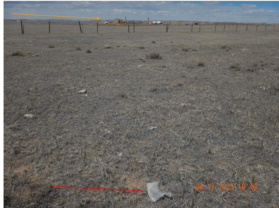
Photo 6. Photo taken southeast of location (orange arrow), facing Northwest. See comments under Photo 5.