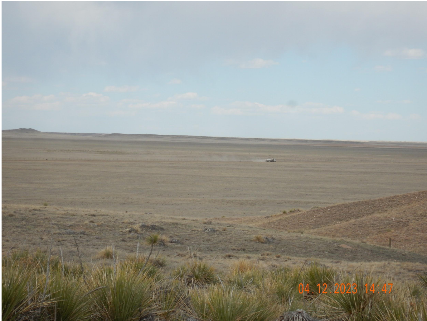
Photo 4. Photo taken of a section of the access road, facing Northeast. Photo illustrates fugitive dust from the produced water truck approximately one hour after the access road was just watered.