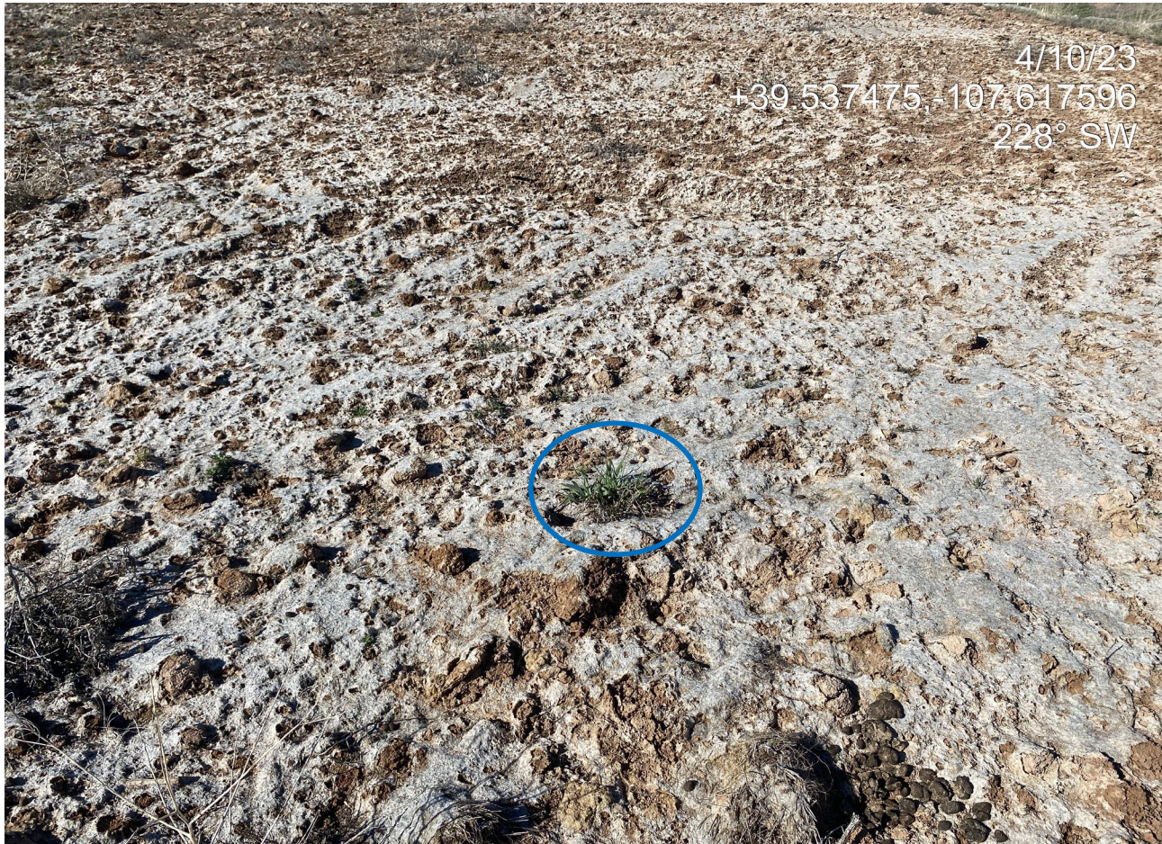
Photo 3. Photo shows interim areas to the north. Note the singular seeded perennial grass (circled).