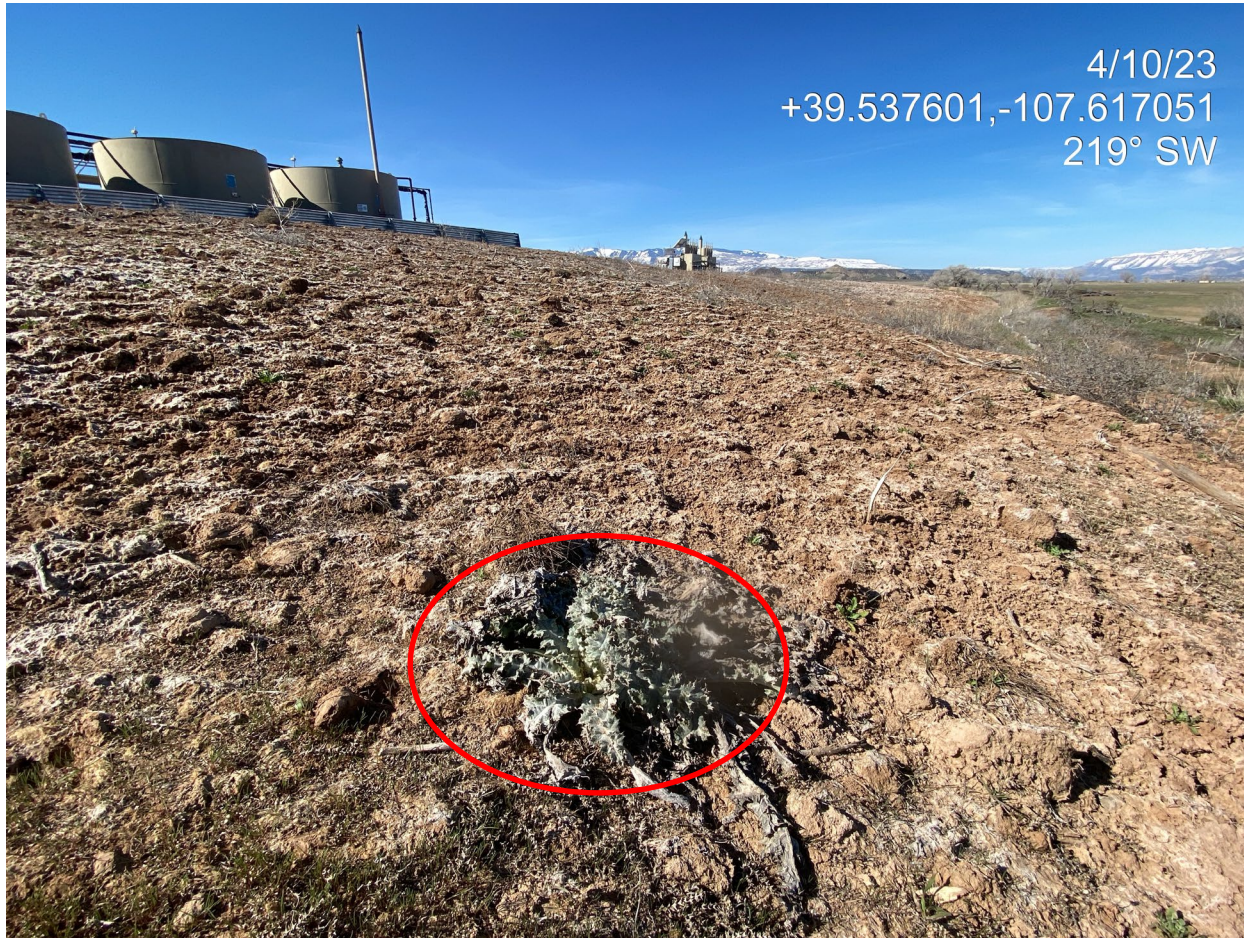
Photo 4. Photo shows interim areas to the north. Note the noxious weed Scotch thistle (circled).