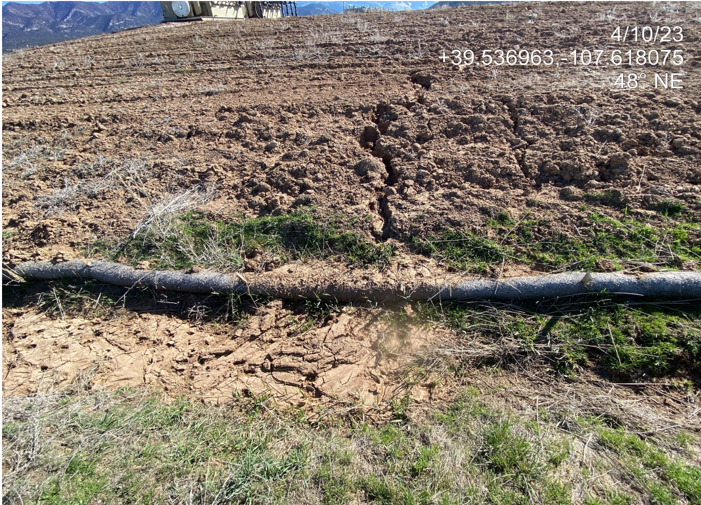
Photo 8. Photo shows rill erosion occurring in western interim areas. Sediment has overtopped a wattle.