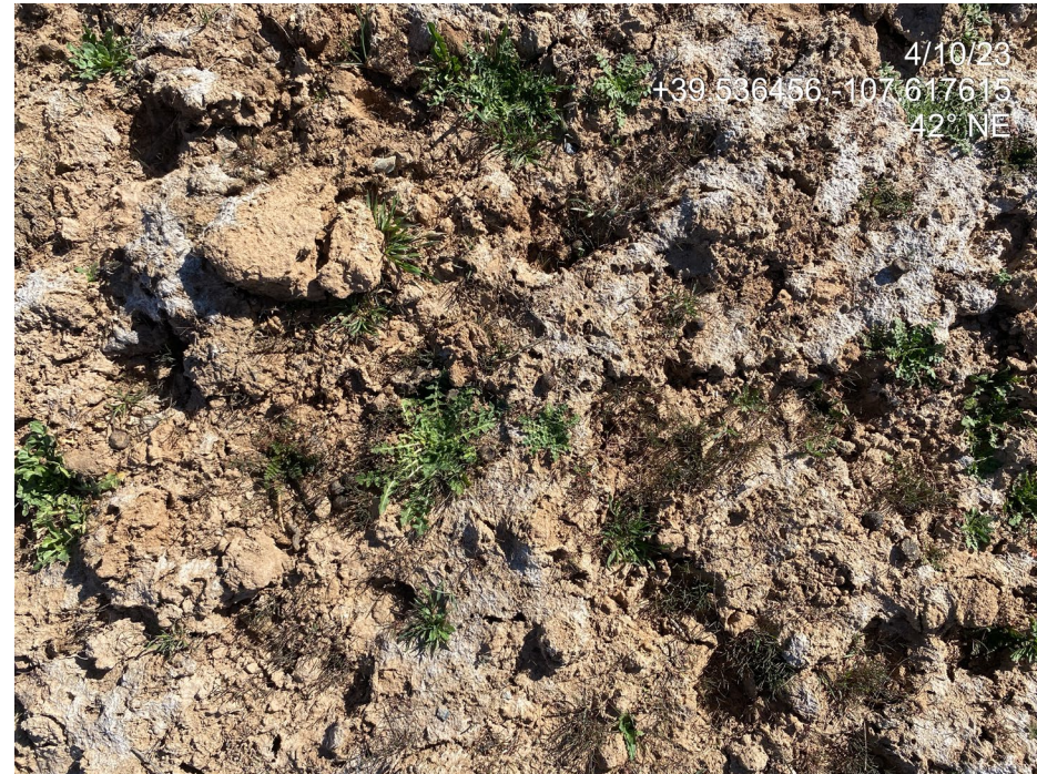
Photo 2. Photos show interim areas to the west. Species shown include cheatgrass (List C Noxious), purple mustard, Russian thistle and common stork's-bill (annual, undesirable plant species).