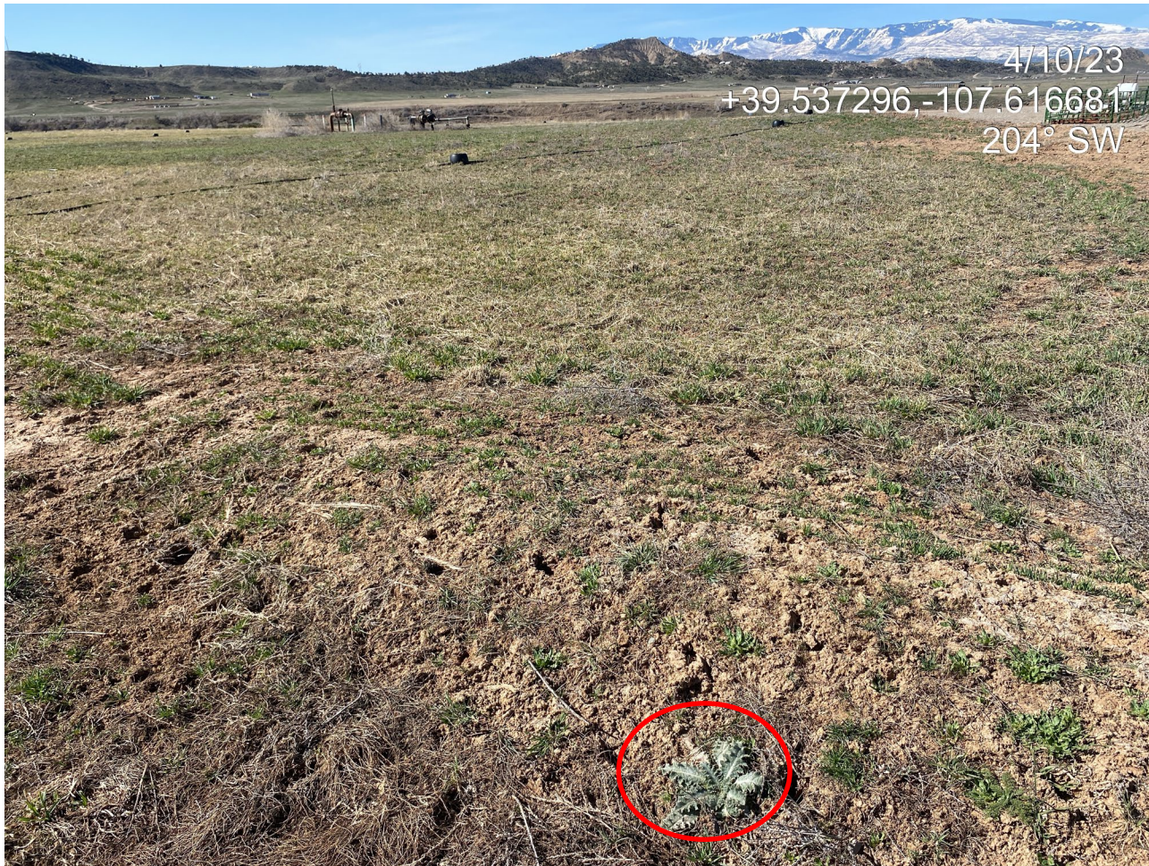
Photo 6. Photo shows the eastern interim areas are established with perennial grasses. Note also Scotch thistle.