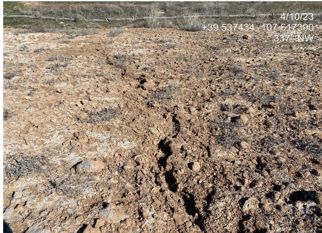
Photo 10. Photo shows rill erosion occurring in northern interim areas.