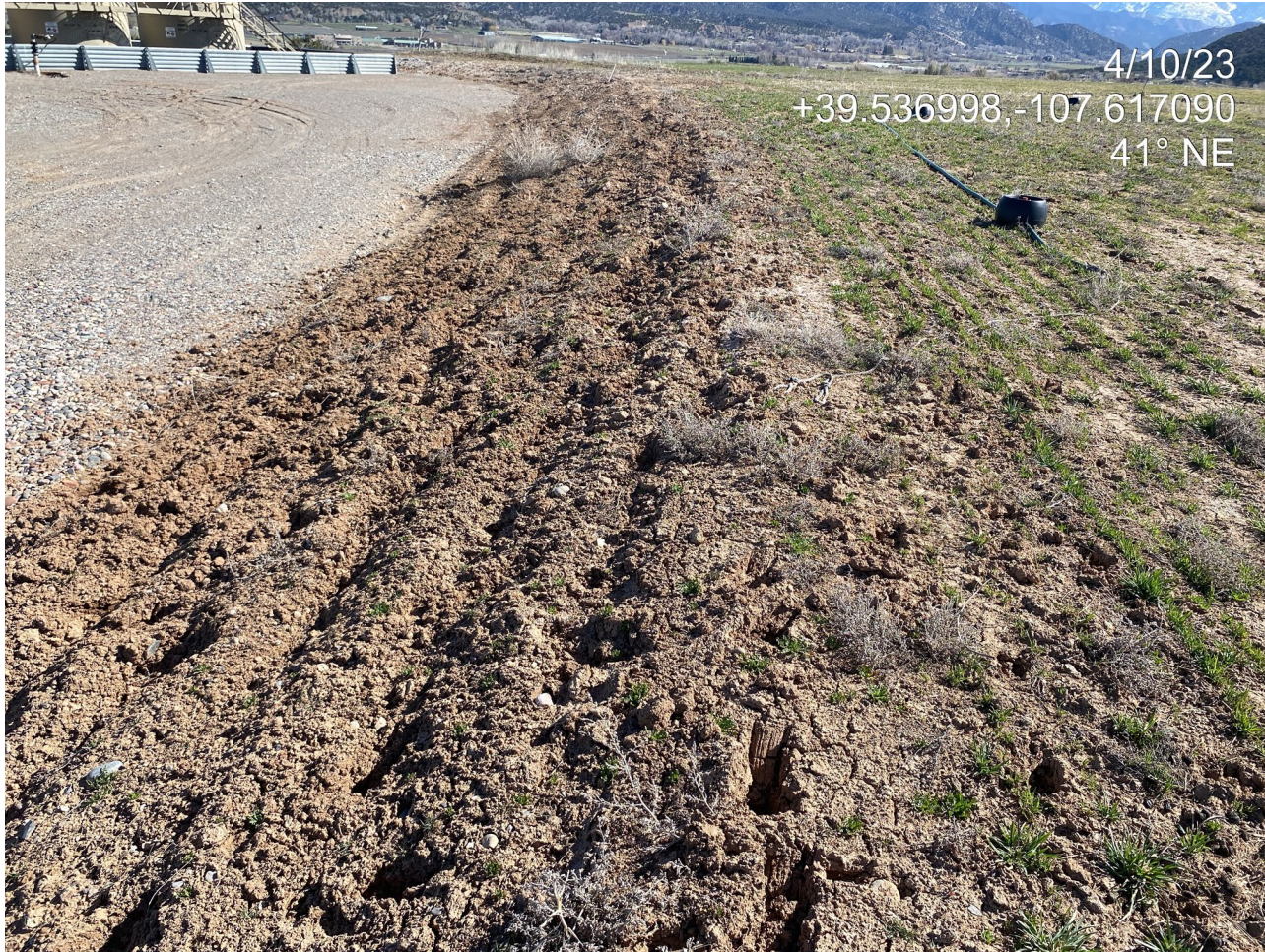
Photo 7. Photo shows the southern and eastern interim areas directly adjacent to the working pad area are bare.