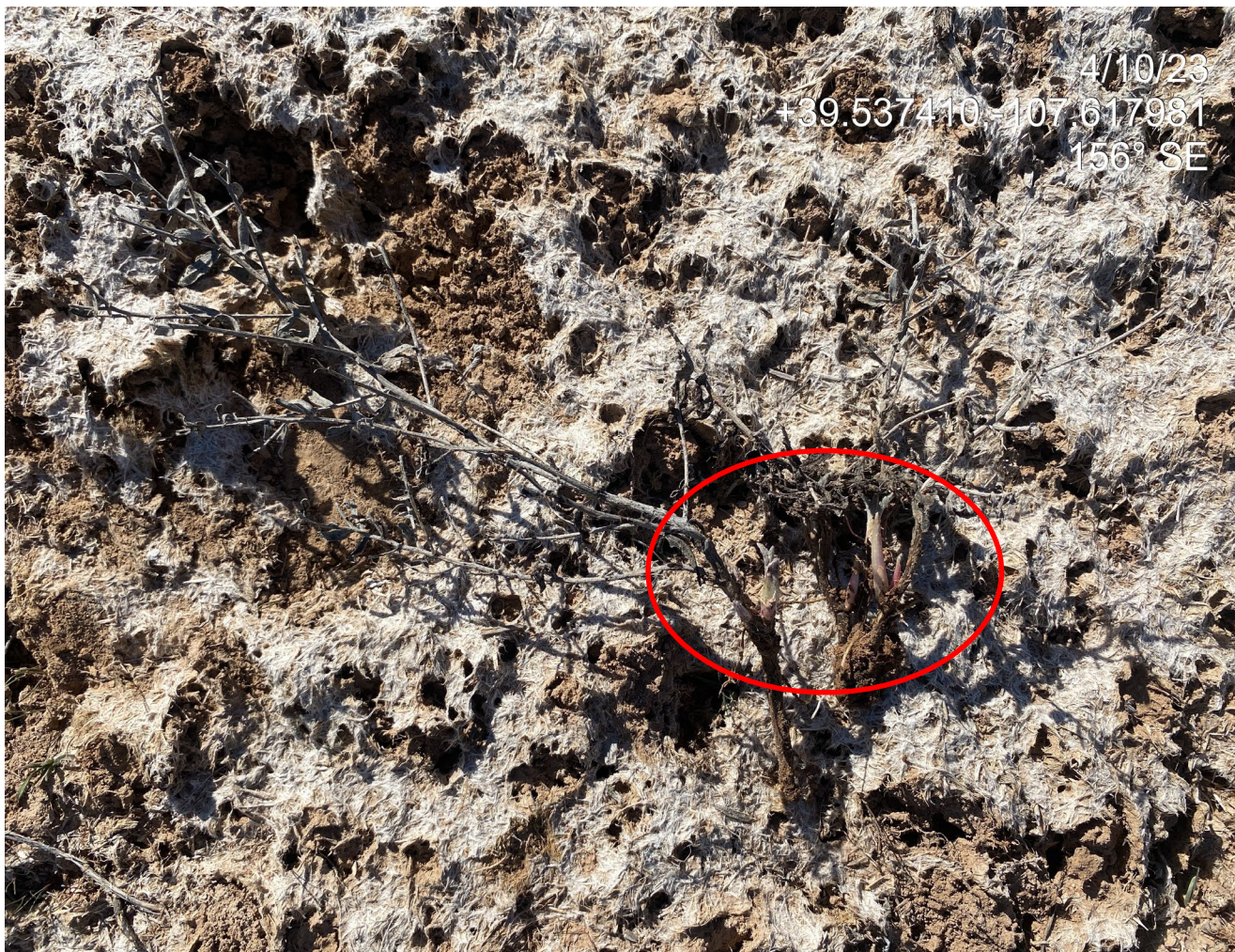
Photo 5. Photo shows a Russian knapweed skeleton with new growth (circled).