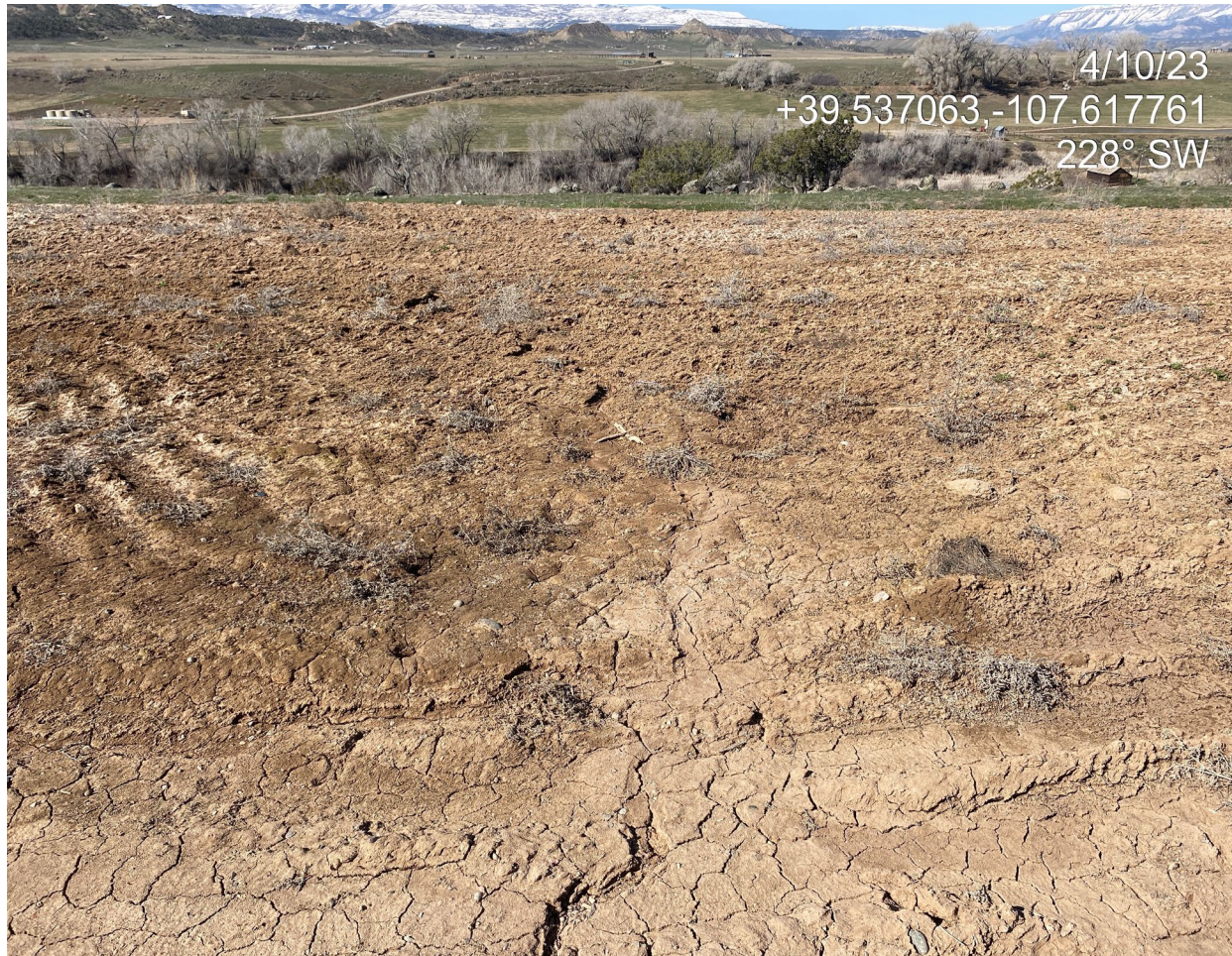
Photo 9. Photo shows rill erosion occurring in western interim areas. Note also dominance of bare ground and lack of perennial vegetation.