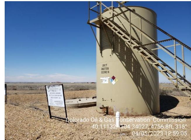
Photo 3 TB sign.