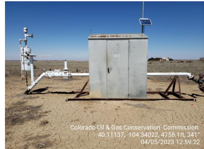
Photo 5 Horizontal Heated Separator.