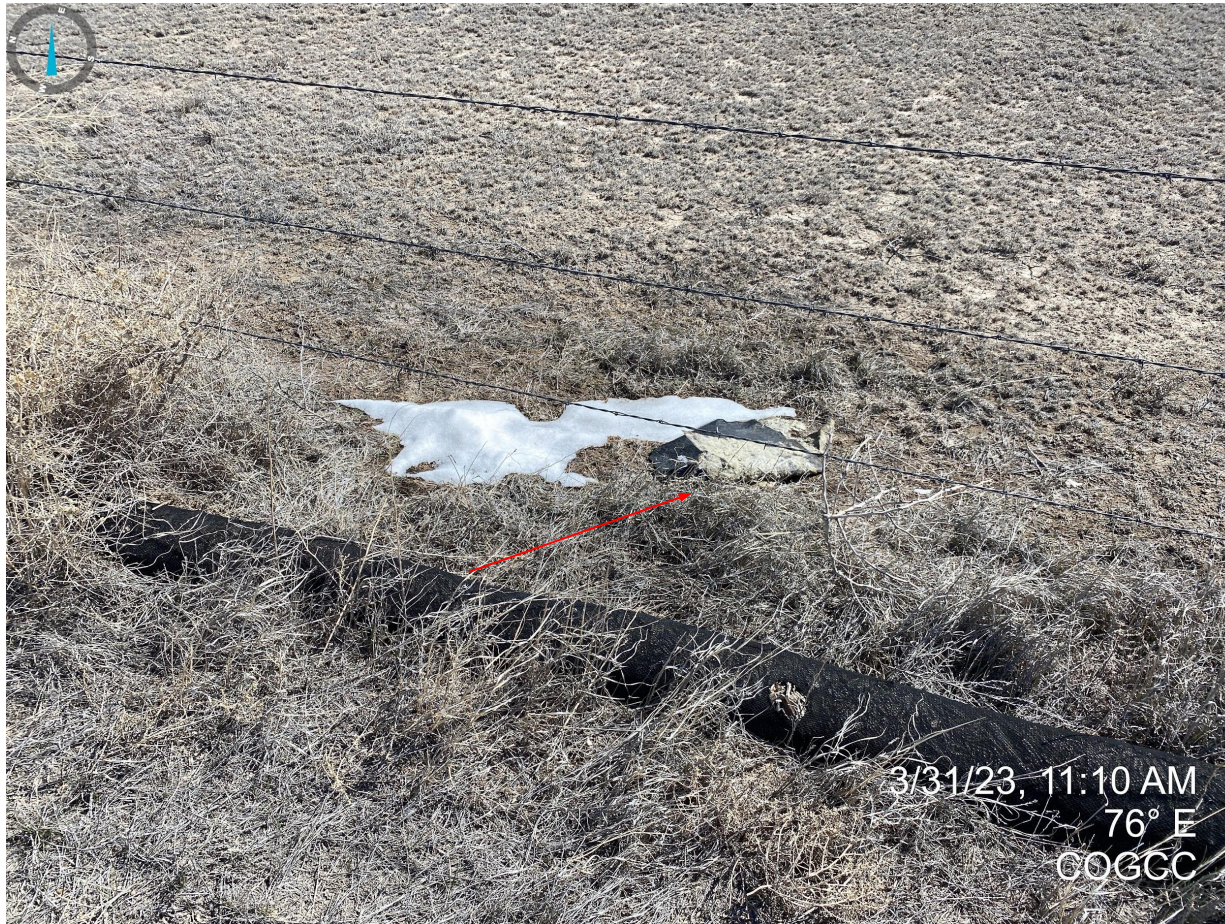
Photo 4. Facing east near the eastern boundary line. Photo illustrates debris that has left location and will need to be disposed of.