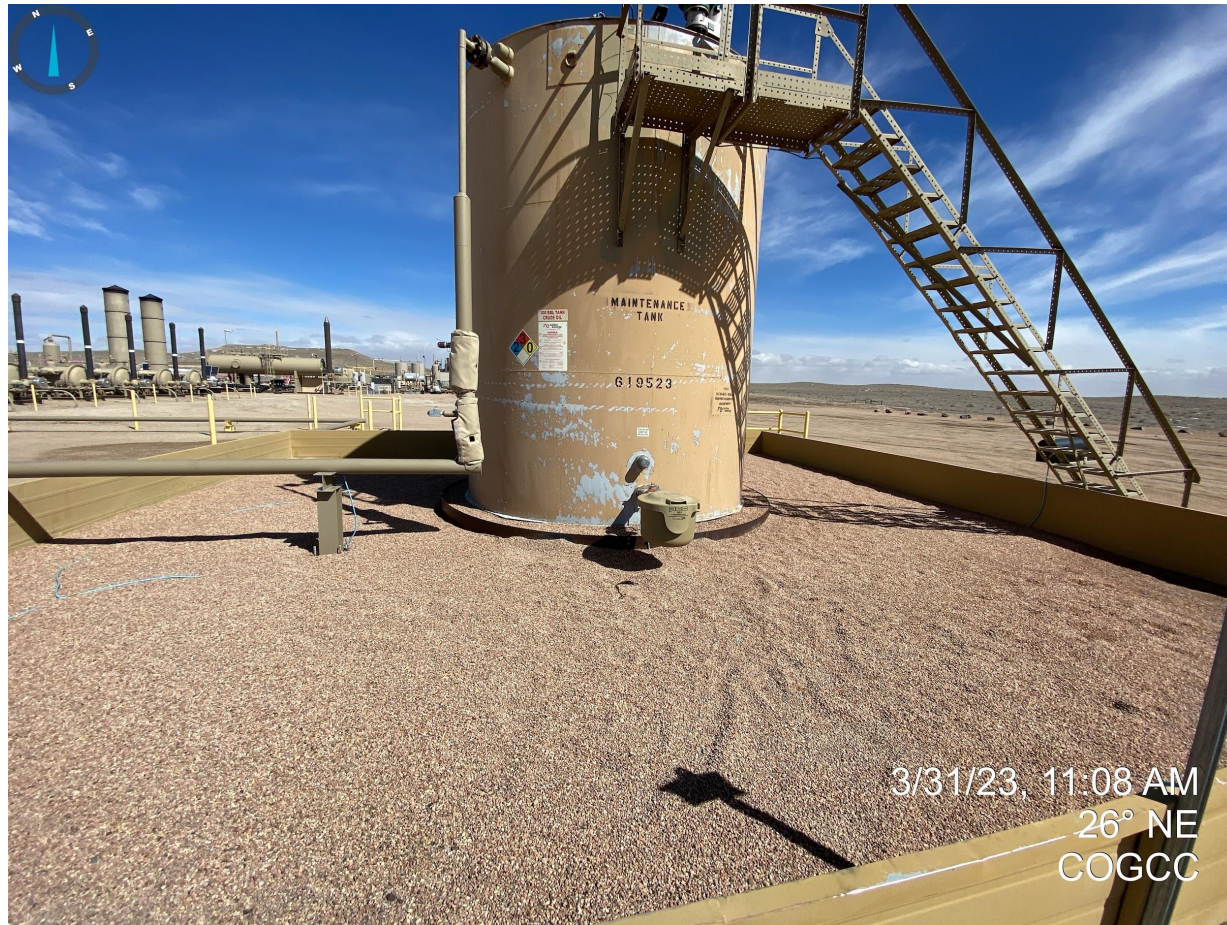
Photo 1. Oily waste appears to have been cleanup up from tank and gravel near the bottom.