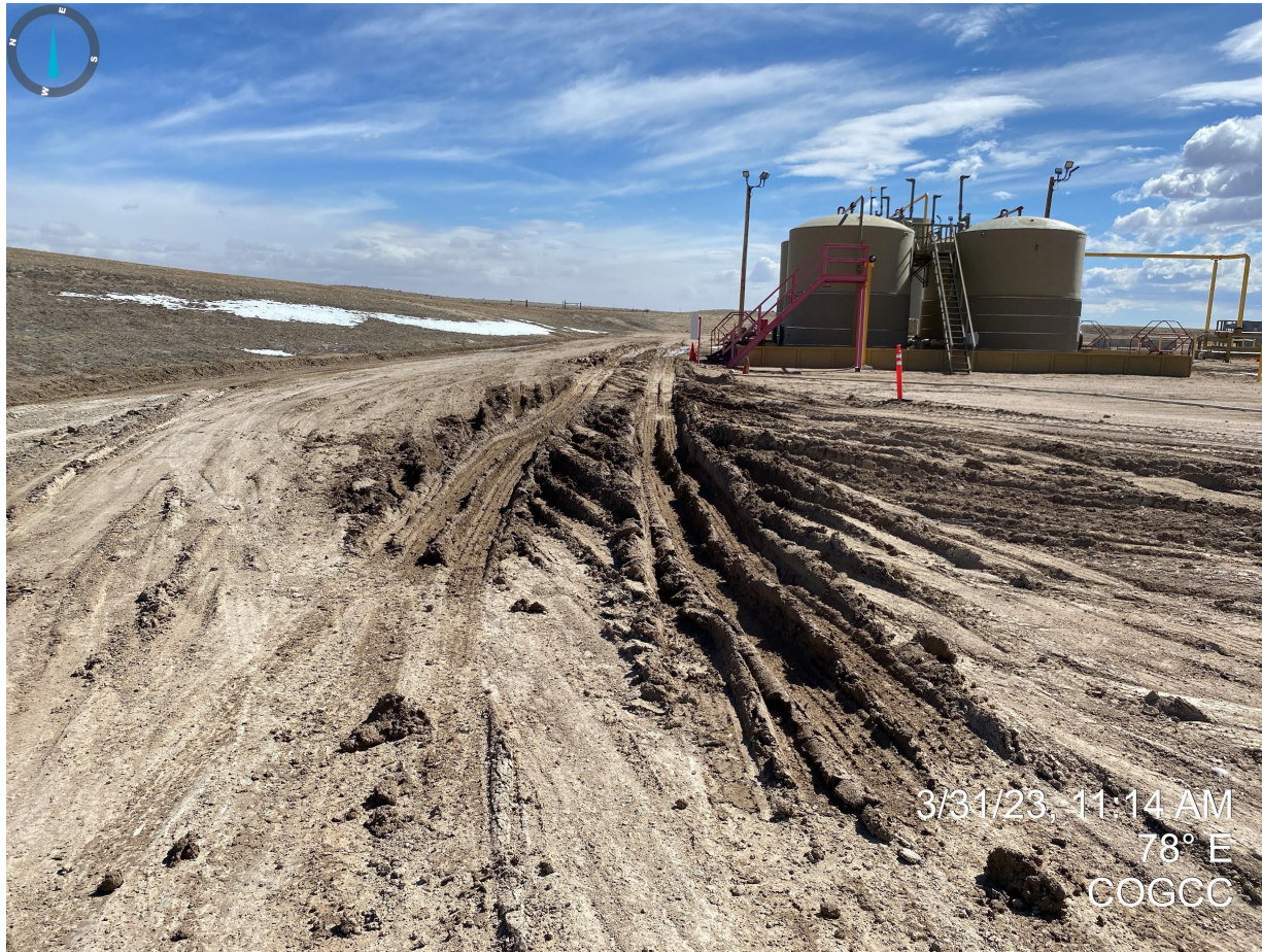
Photo 7. Facing east near the northern portion of the production area. Heavy rutting was observed during this inspection and is being documented for operator awareness at this time.