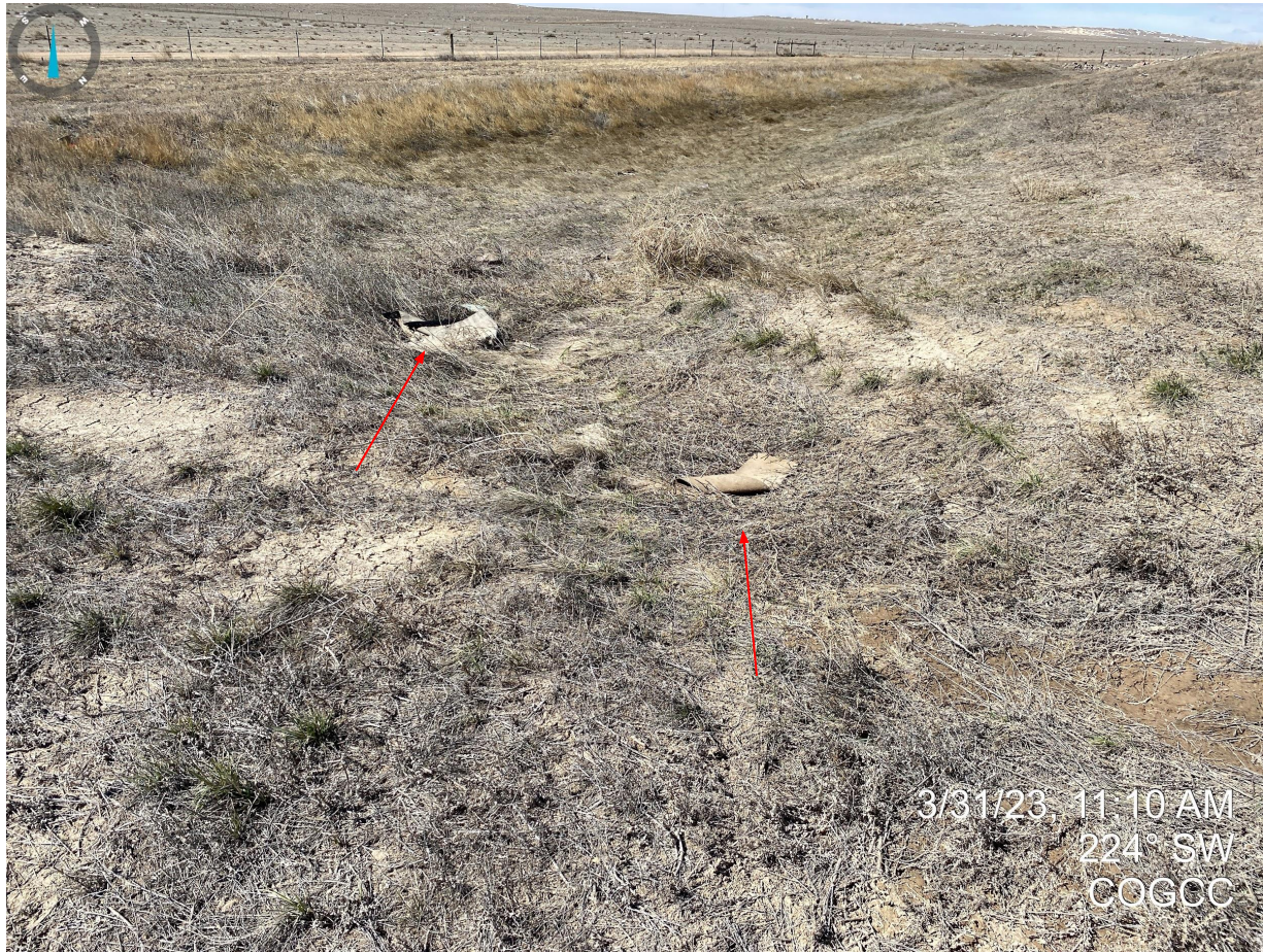
Photo 5. Facing southwest near sediment trap; see comments in Photo 2.