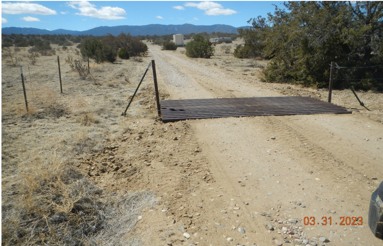
Photo 1. Facing south along the access road. A new cattle guard has been installed.