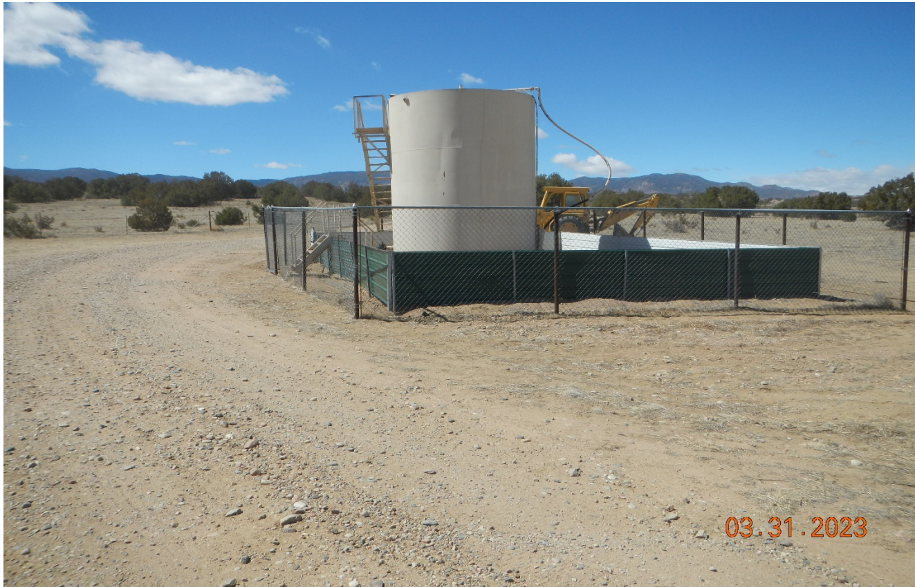
Photo 2. Facing toward the tank battery.