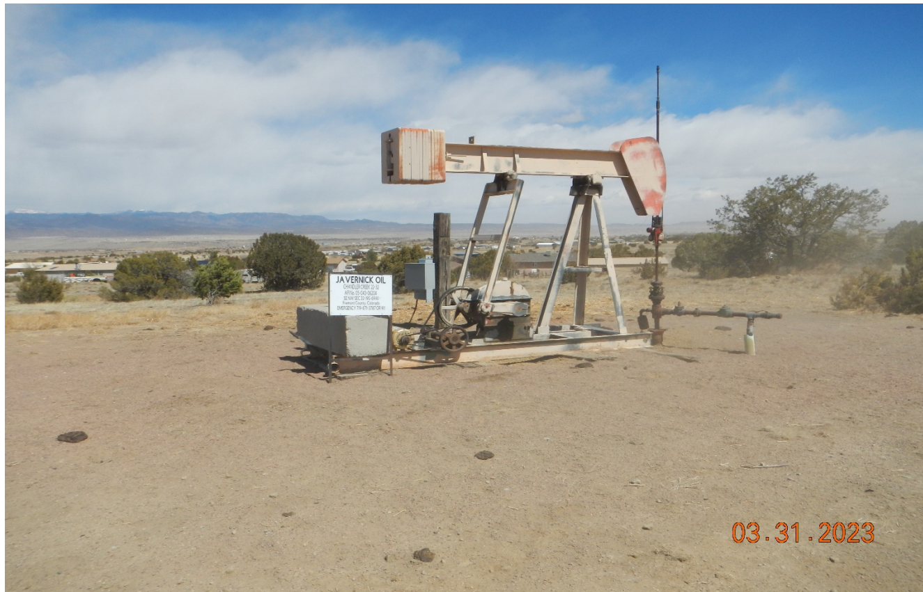
Photo 4. Facing toward the wellsite.