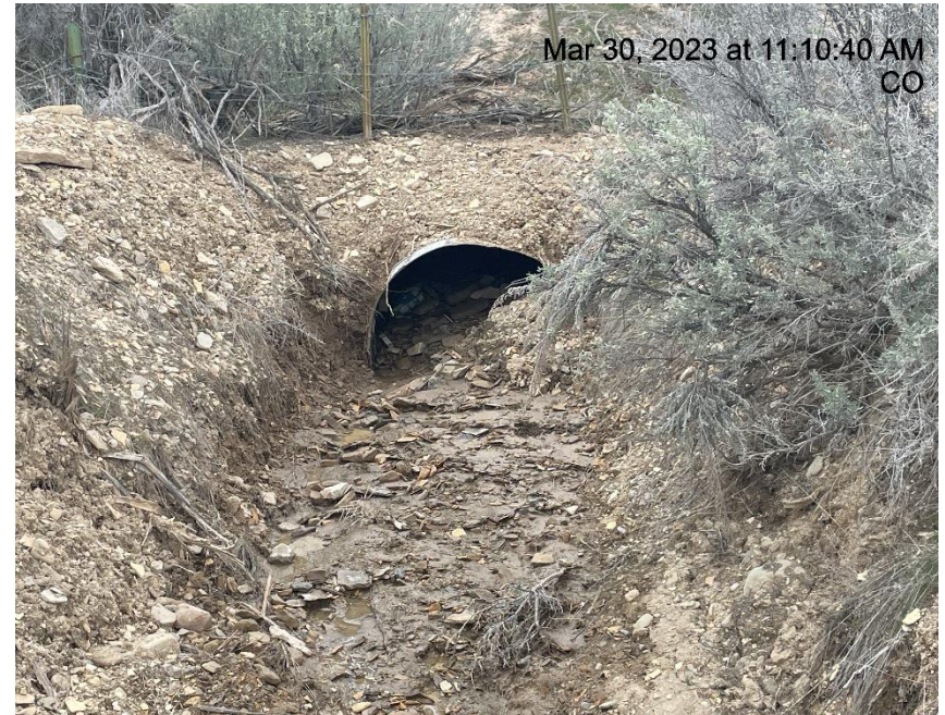
Photo # 3703 Culvert needs maintenance (1/10 th mile down access road)