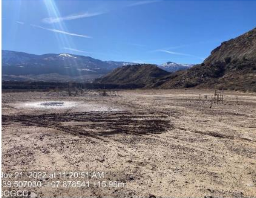
Photo From Inspection 700704723 conducted 11/21/2022