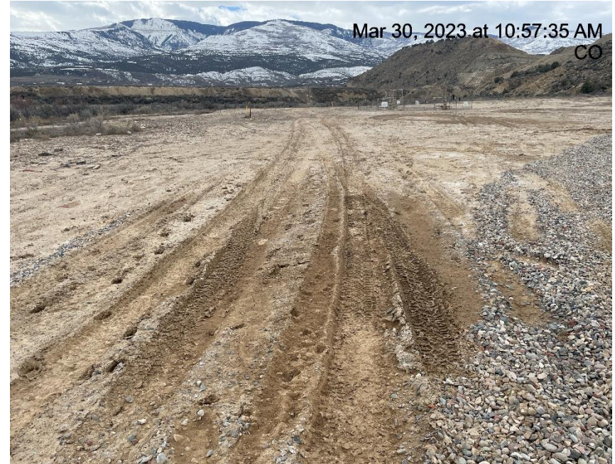
Photo # 3693 Lack of stabilization/Insufficient tracking BMP's on location