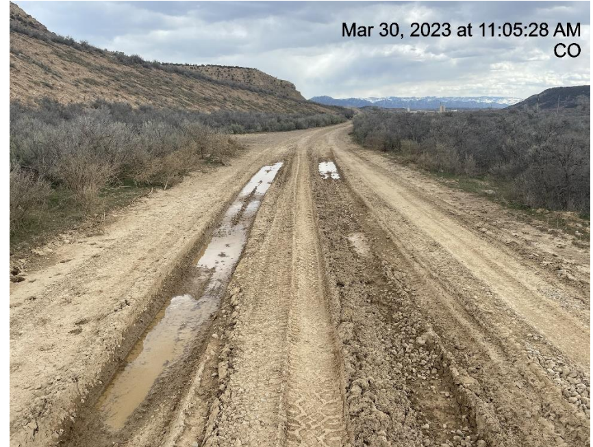
Photo # 3696 Lack of stabilization/Insufficient tracking BMP's on access road