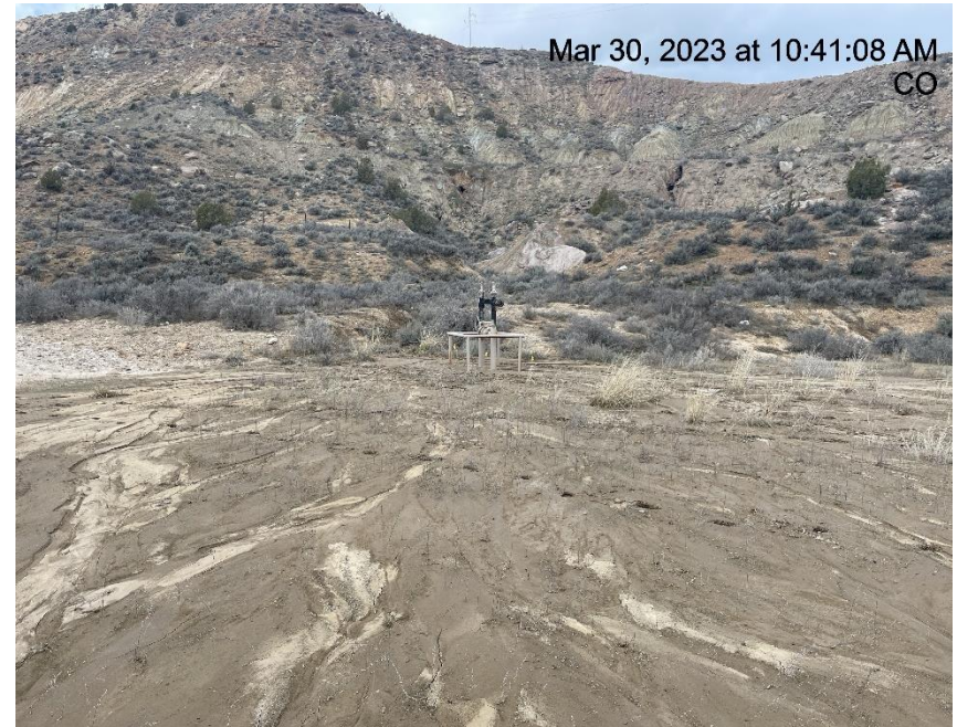
Photo # 3645 Insufficient run on controls/BMP's & transport of sediment onto location/sediment choking off vegetation (NW side of pad)