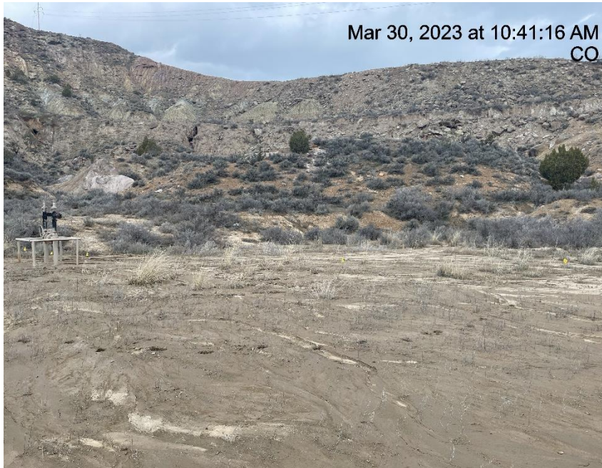
Photo # 3646 Insufficient run on controls/BMP's & transport of sediment onto location/sediment choking off vegetation (NW side of pad)