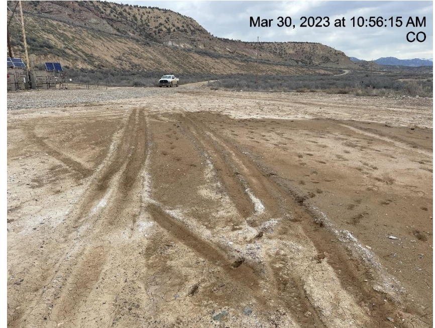
Photo # 3692 Lack of stabilization/Insufficient tracking BMP's on location