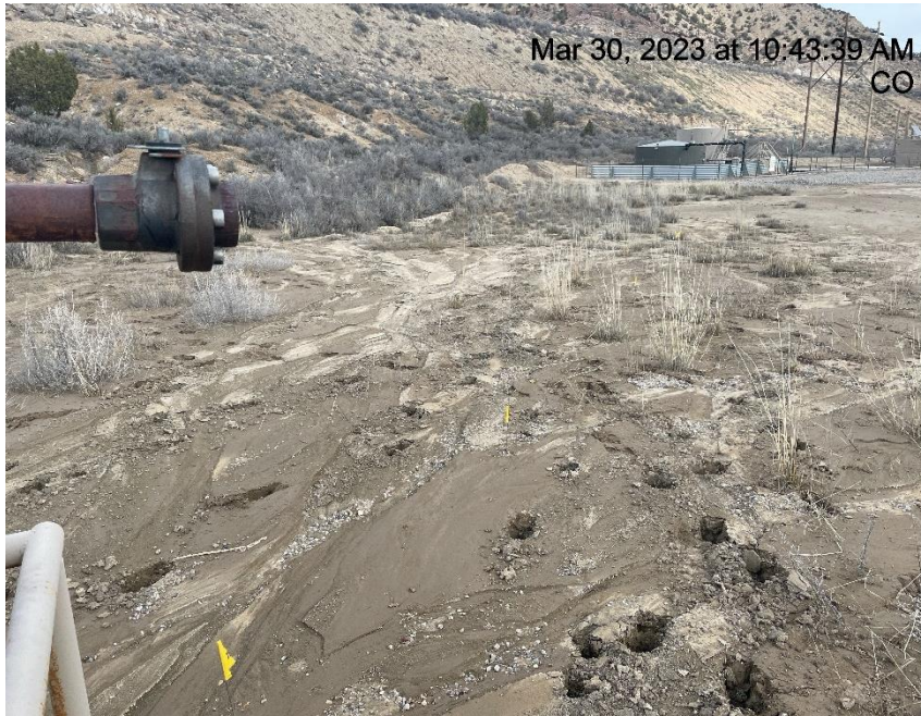
Photo # 3653 Insufficient run on controls/BMP's & transport of sediment onto location/sediment choking off vegetation/Rill erosion (NW side of pad)