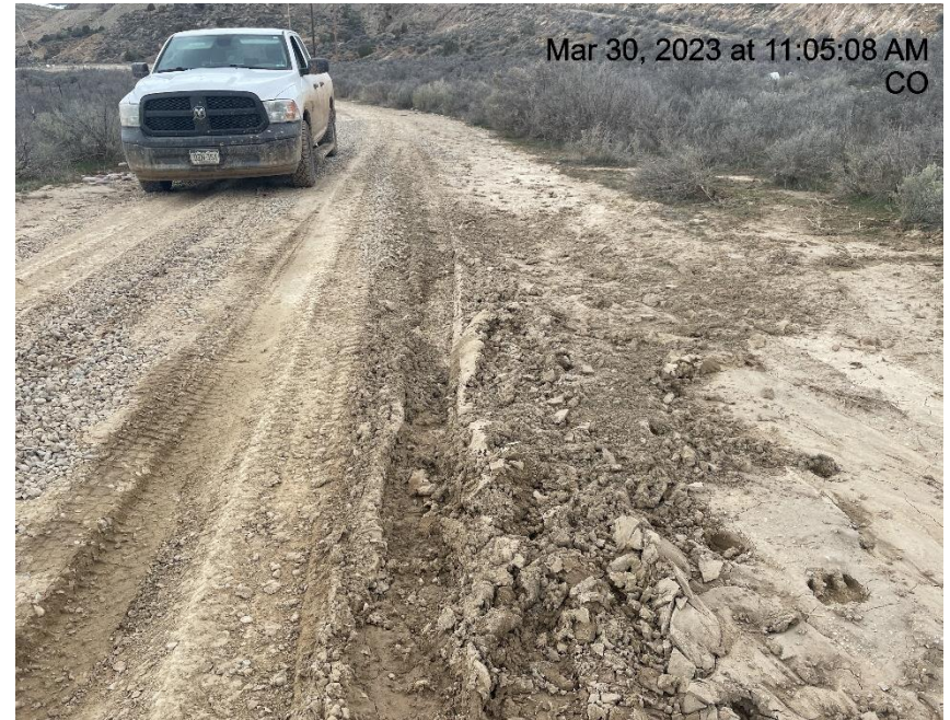
Photo # 3695 Lack of stabilization/Insufficient tracking BMP's on access road