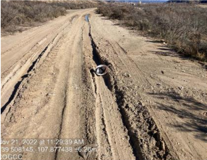
Photo From Inspection 700704723 conducted 11/21/2022