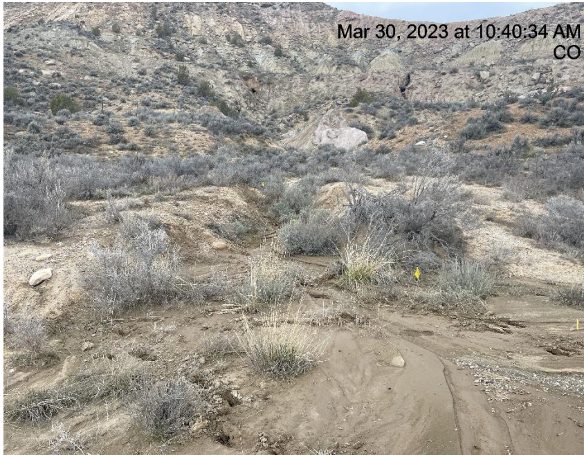
Photo # 3643 Insufficient run on controls/BMP's & transport of sediment onto location/sediment choking off vegetation (NW side of pad)