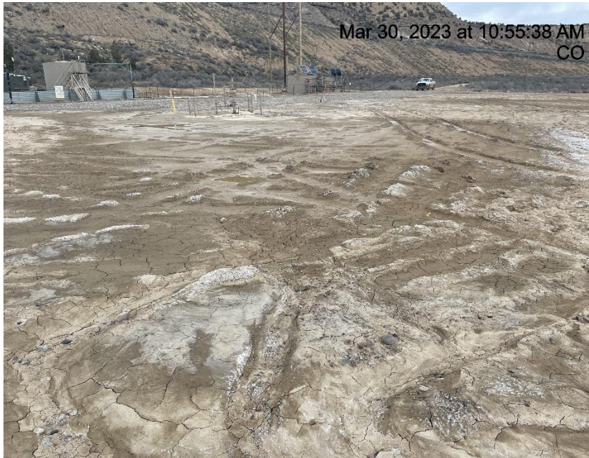
Photo # 3689 Lack of stabilization/Insufficient tracking BMP's on location