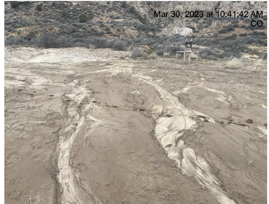
Photo # 3647 Insufficient run on controls/BMP's & transport of sediment onto location/sediment choking off vegetation/Rill erosion (W/NW side of pad)