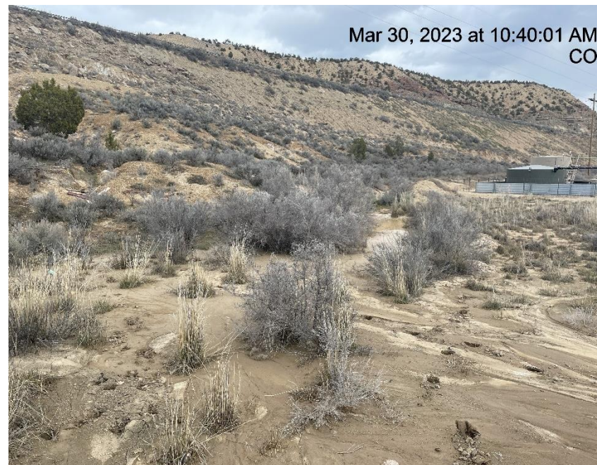
Photo # 3641 Insufficient run on controls/BMP's & transport of sediment onto location (NW side of pad)