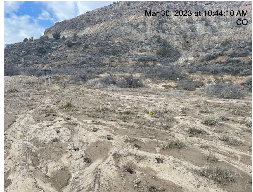
Photo # 3655 Insufficient run on controls/BMP's & transport of sediment onto location/sediment choking off vegetation/Rill erosion (NW side of pad)