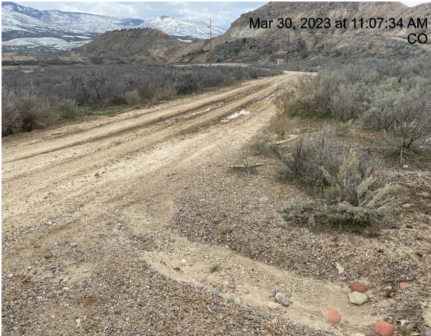
Photo # 3698 Lack of stabilization/Insufficient tracking BMP's on access road