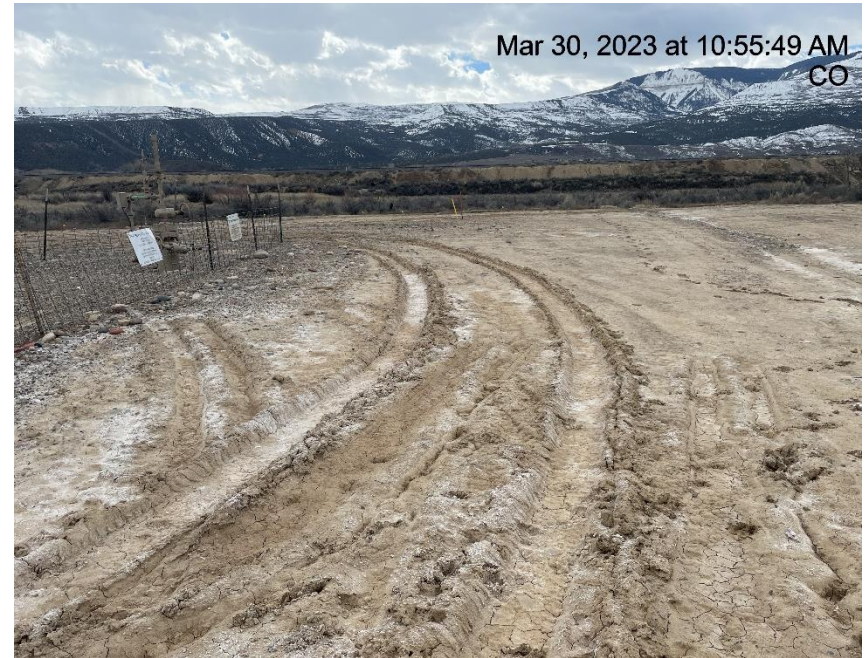
Photo # 3690 Lack of stabilization/Insufficient tracking BMP's on location