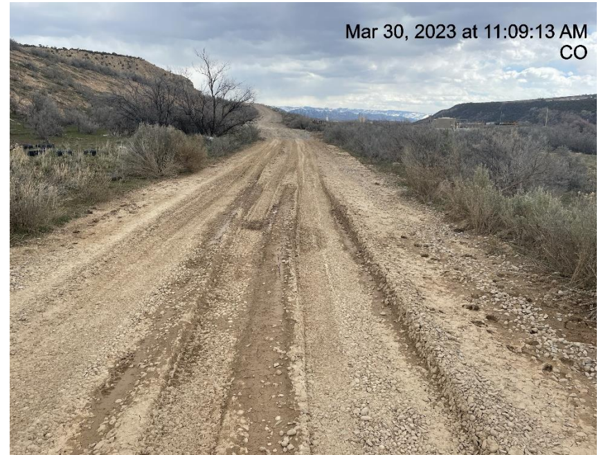
Photo # 3700 Lack of stabilization/Insufficient tracking BMP's on access road