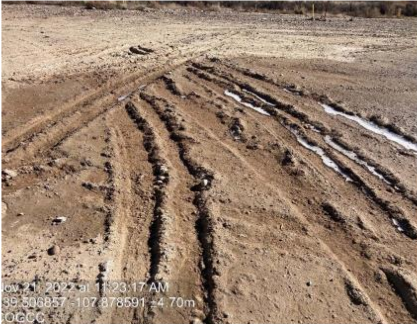
Photo From Inspection 700704723 conducted 11/21/2022