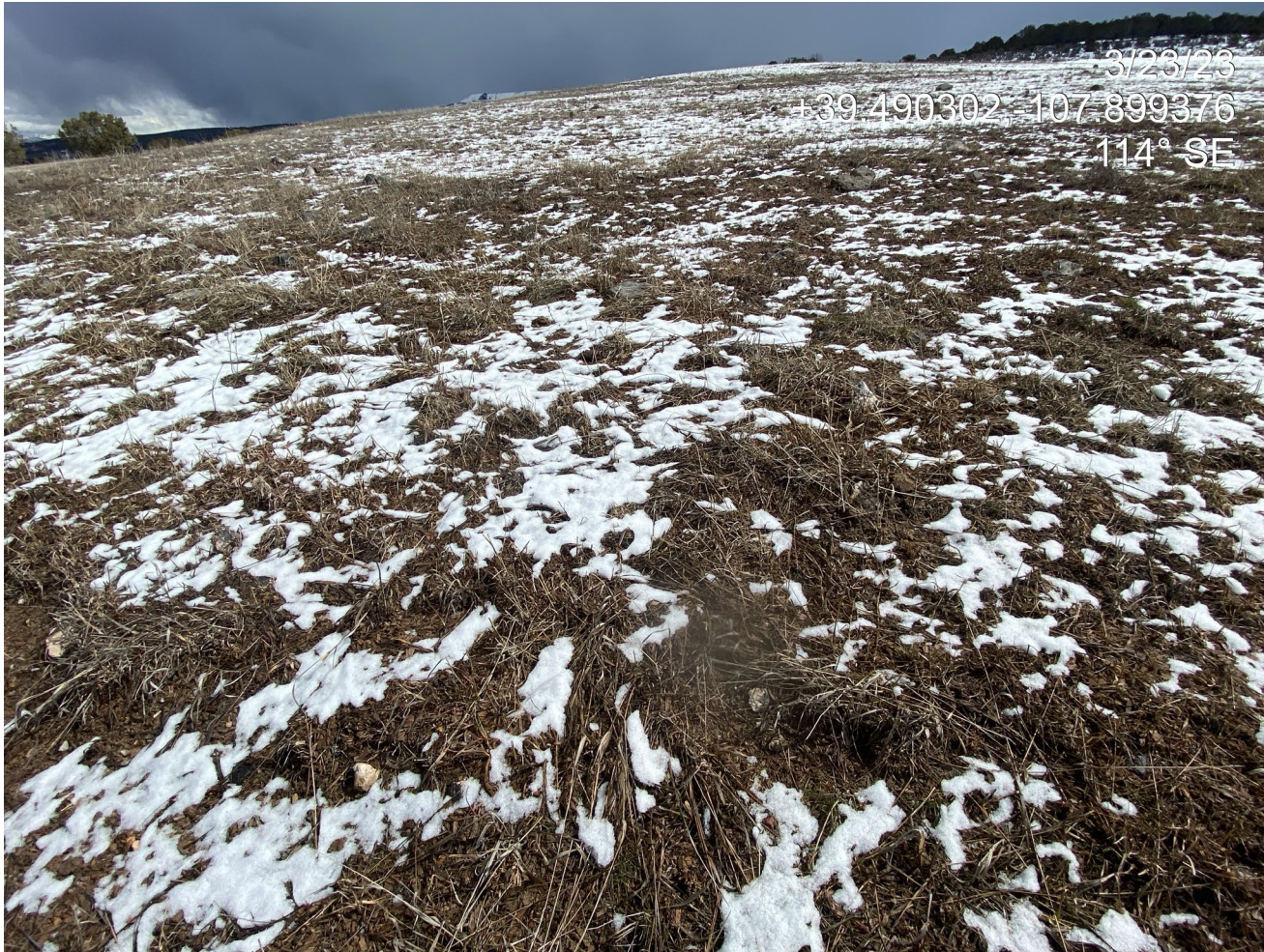
Photo 5. Photo shows interim areas.