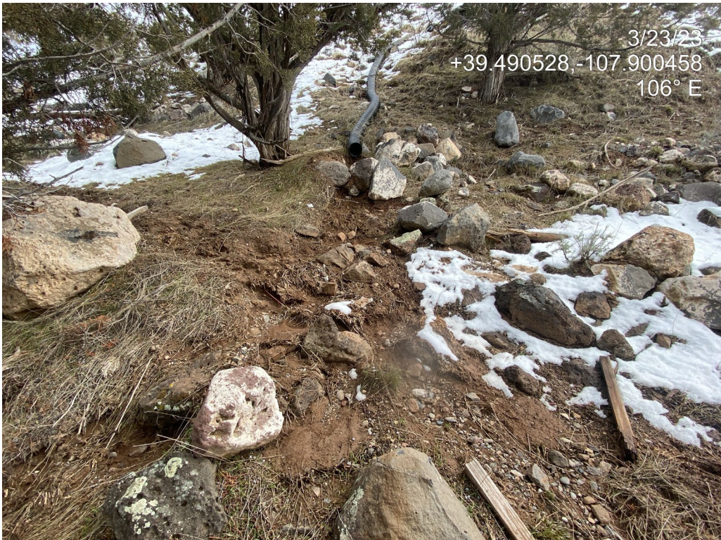
Photo 4. Photos show offsite degradation (erosion, sediment deposition) resulting from concentrated flows discharged from a stormwater drain.