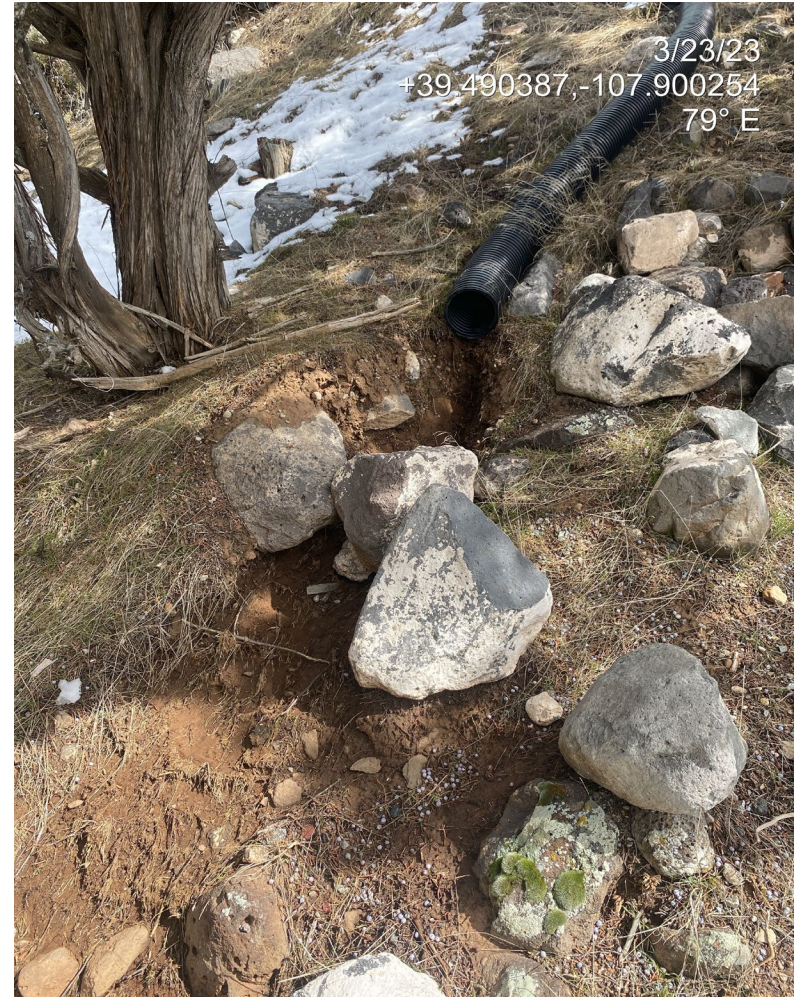
Photo 3. Photos taken from the north of the location show degradation at a stormwater drain inlet/sediment trap (left) and outlet (right).