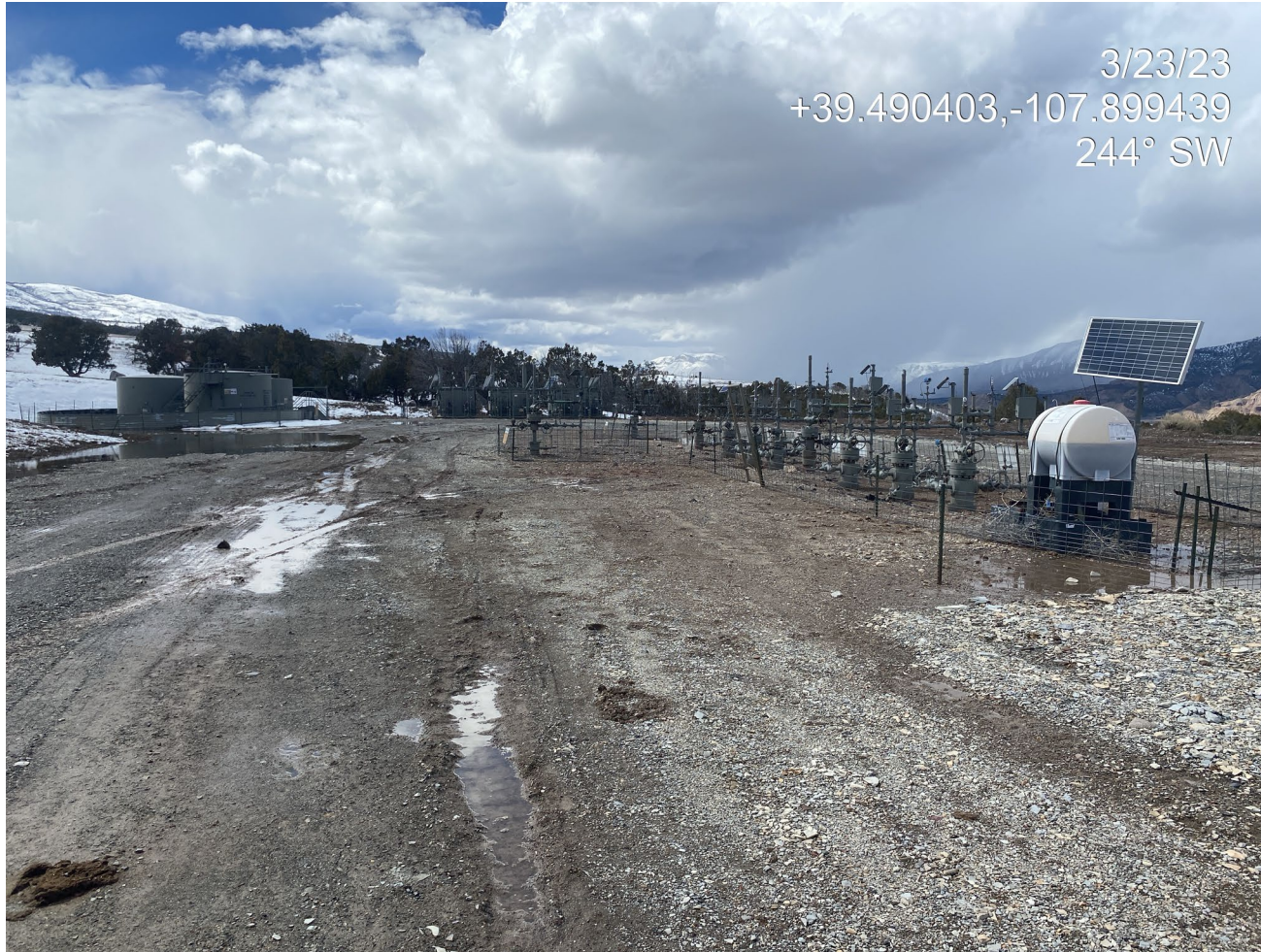
Photo 1. Photo taken from the entrance shows an overview of the location.