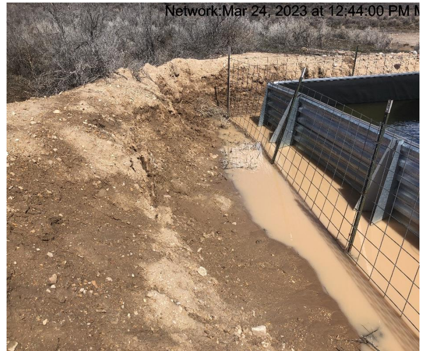
Photo #9404 Berm degradation. Sediment encroaching on secondary containment.