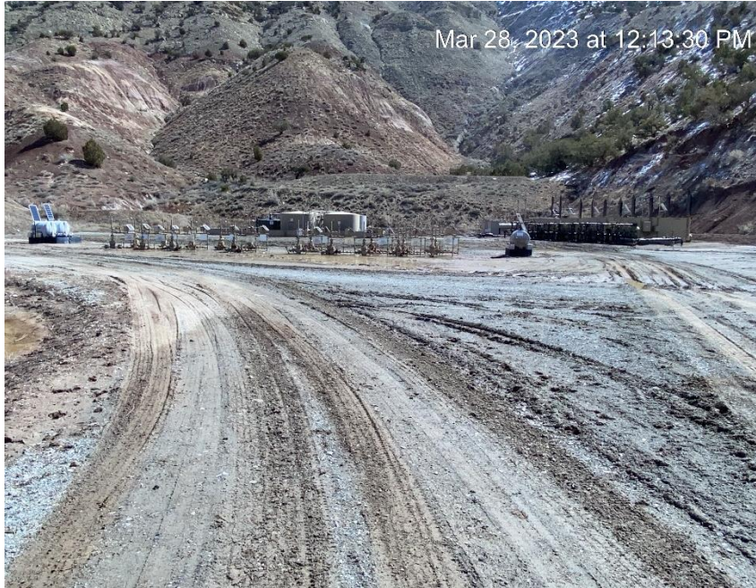
South view from entrance to location