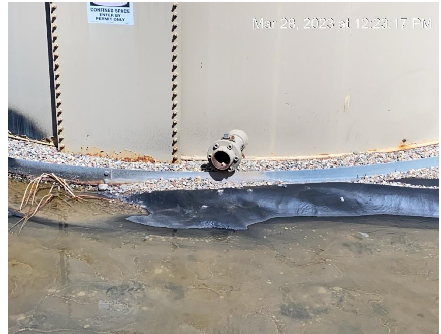
Open end tank valve