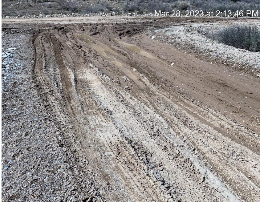
Lease road entrance at Wheeler Gulch Road