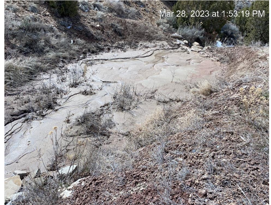
Sediment trap full. Erosion and sediment migration