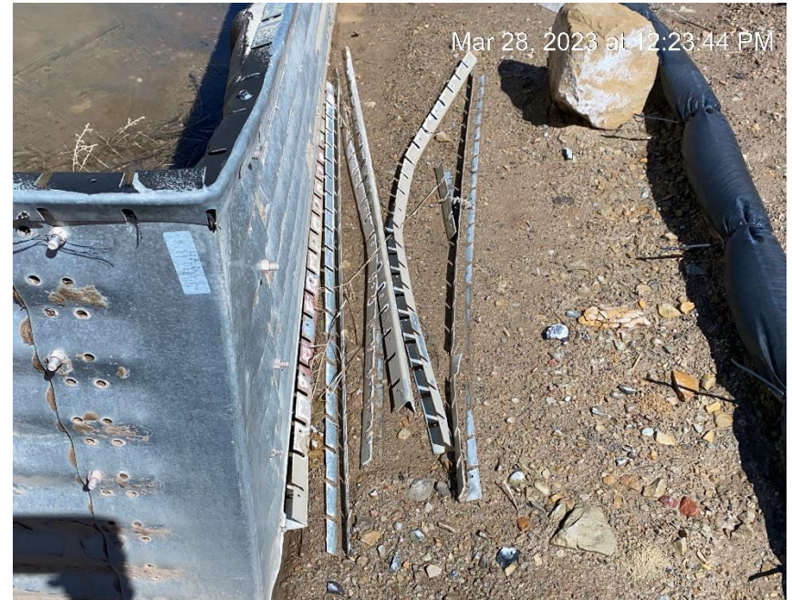
Random debris outside tank containment