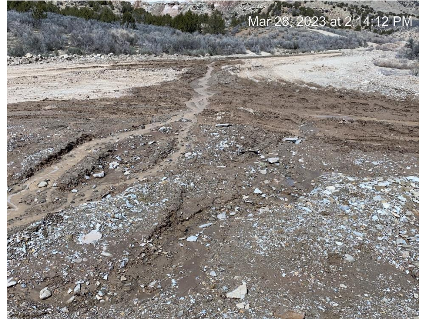
Lease road entrance at Wheeler Gulch Road