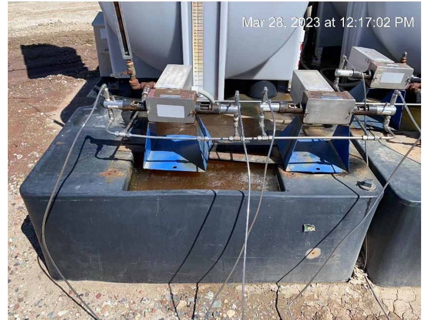
Chemical containment full