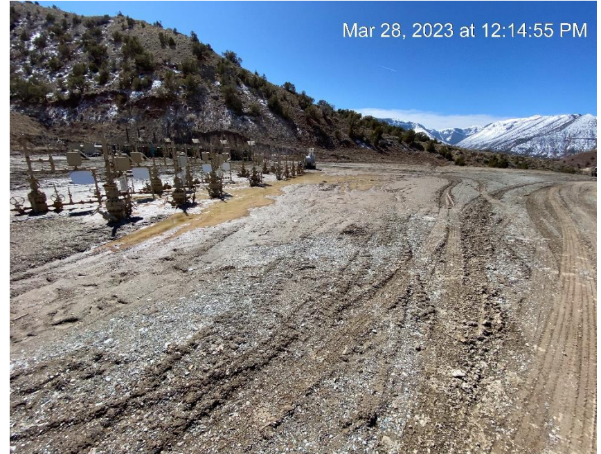
West view toward location entrance