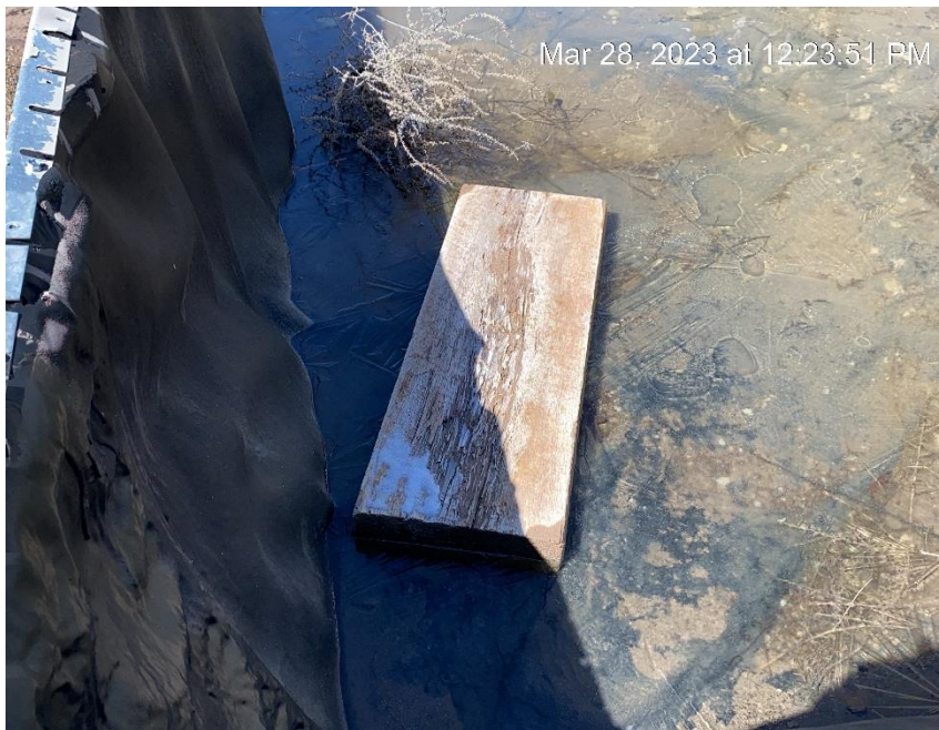
Random debris inside tank containment