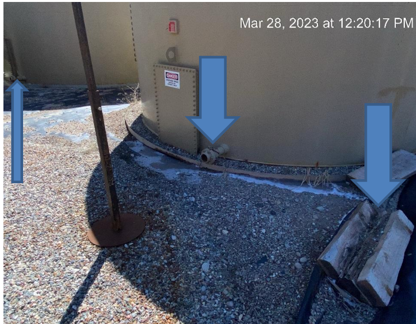
Open end tank valves. Random debris