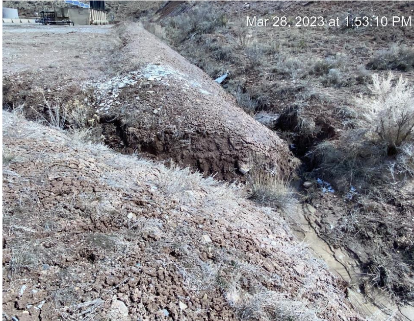
Erosion ditch coming off location