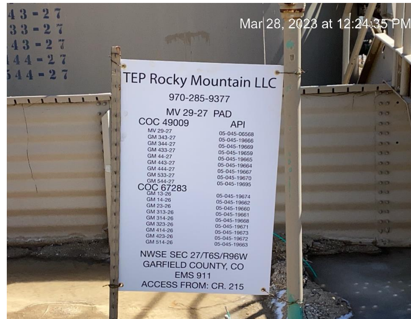
Sign at tank battery