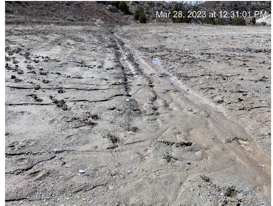
Location drainage off location