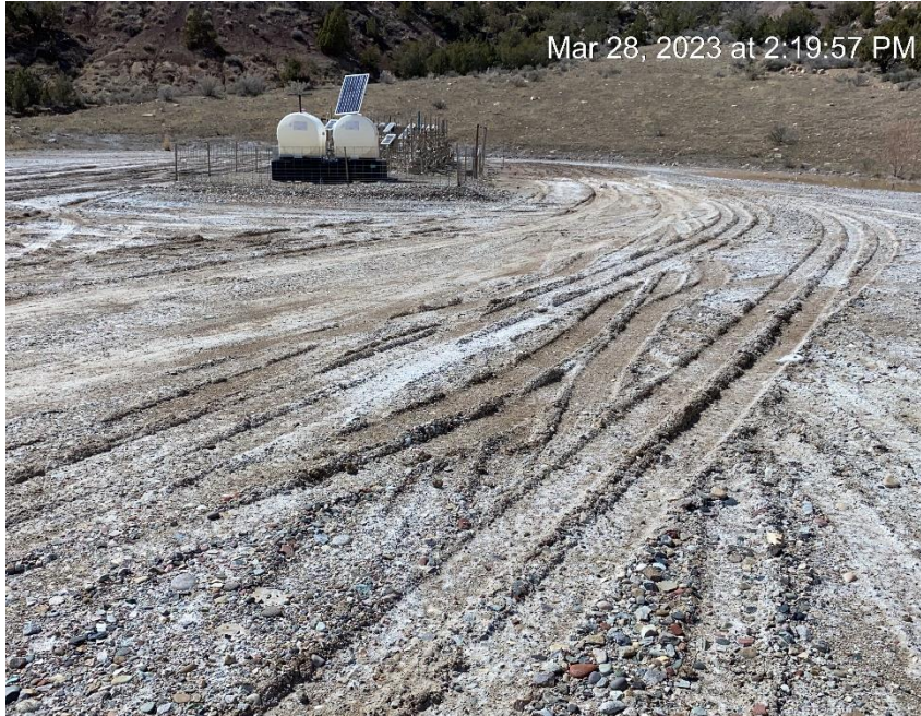
North view from entrance to location