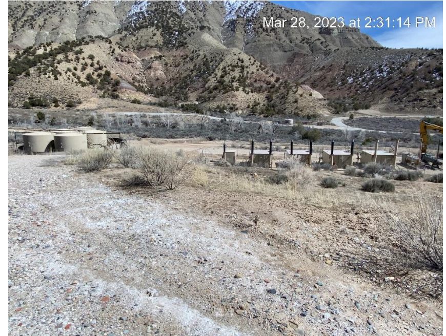
South view from entrance to location