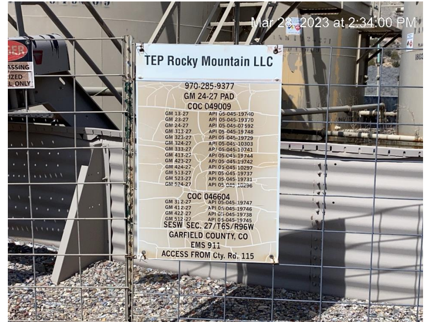
Sign at tank battery