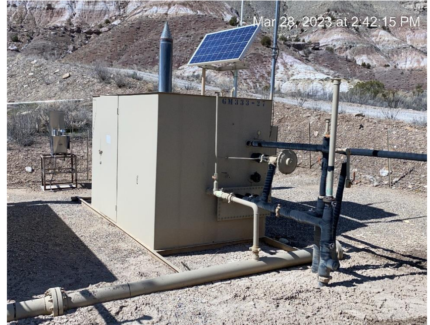
Gas meter calibration card not conspicuously posted.