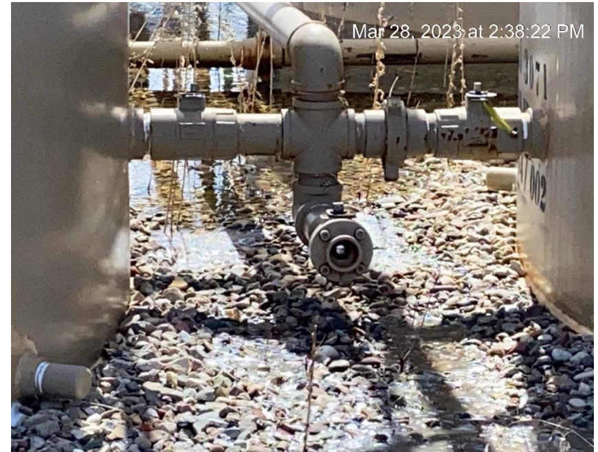
Open end tank valve