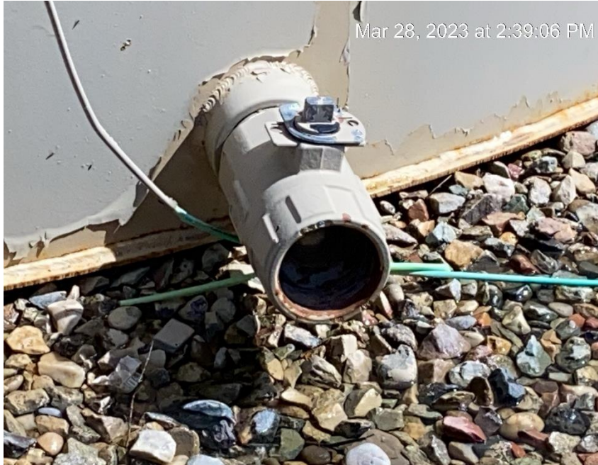
Open end tank valve