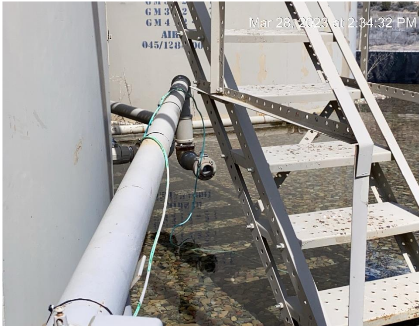
Open end tank valve