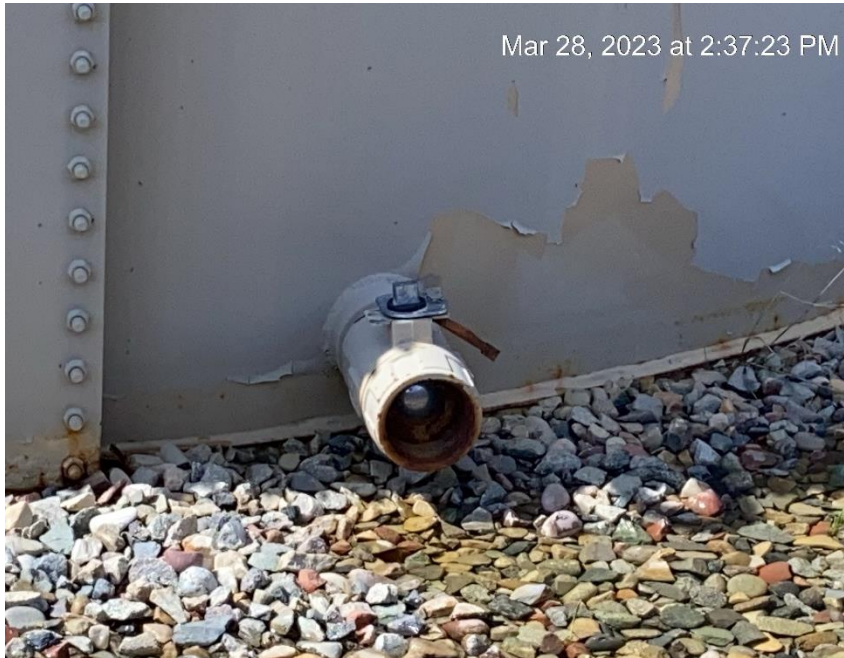
Open end tank valve