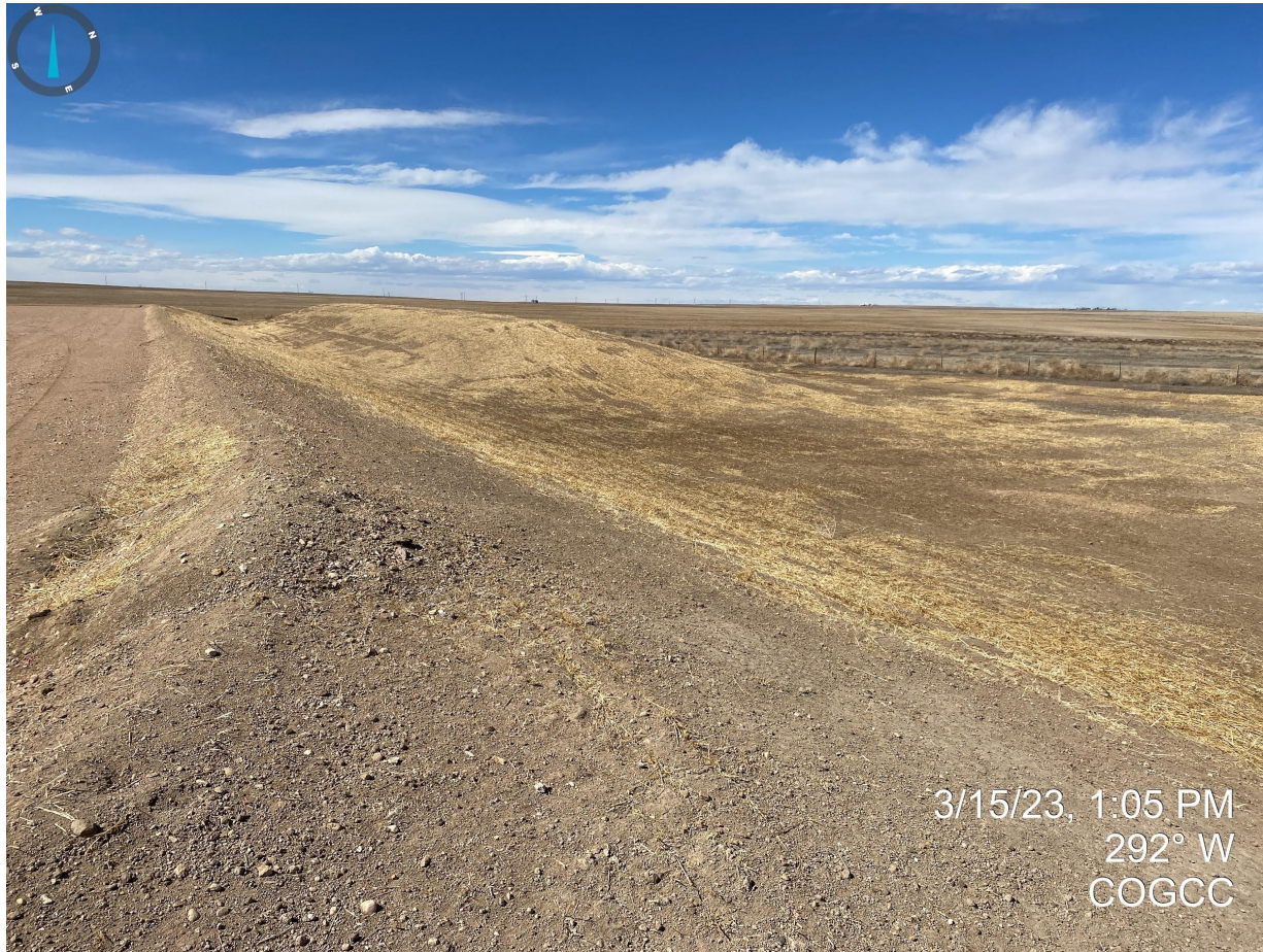
Photo 5. Facing west towards topsoil stockpile. See comments in Photo 3.