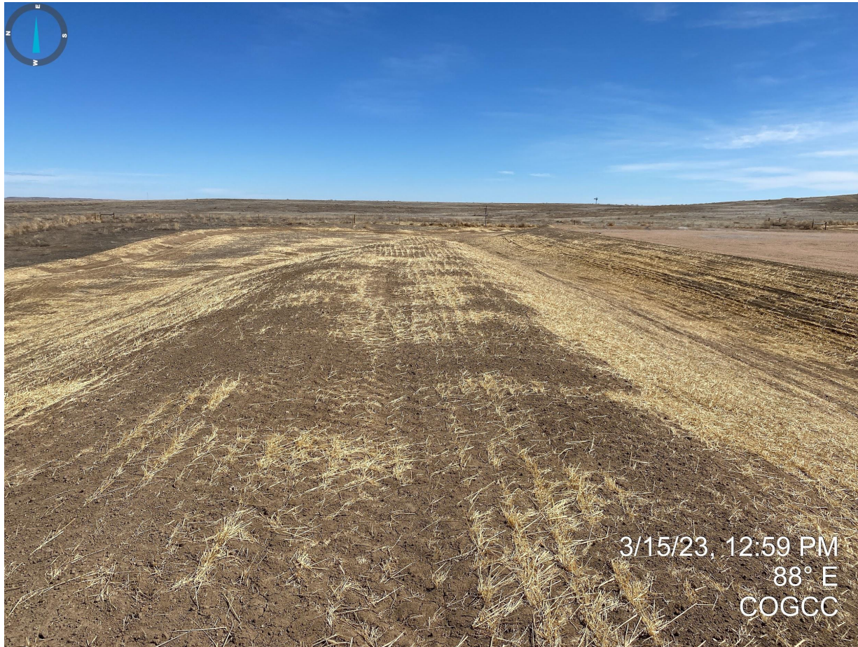
Photo 4. Facing east from topsoil stockpile. See comments in Photo 3.