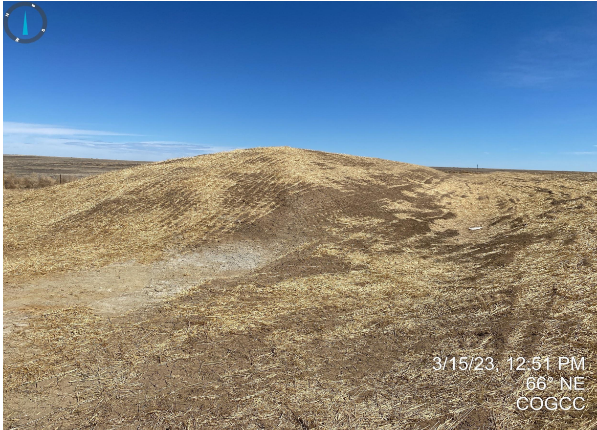
Photo 3. Facing northeast towards the topsoil stockpile. It does not appear the operator salvaged all of the topsoil from the location as staff calculated that the stockpile is approximately 5,925 cubic yards. The location should have had approximately 14,639 cubic yards of topsoil salvaged, not including the topsoil underneath the stockpile. The operator will need to import the difference (~8,700 cubic yards) to come into compliance with Rule 1002.b.