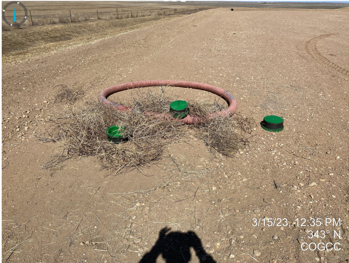
Photo 1. Facing north from the western side of the location. Unused equipment was observed on location during this inspection.