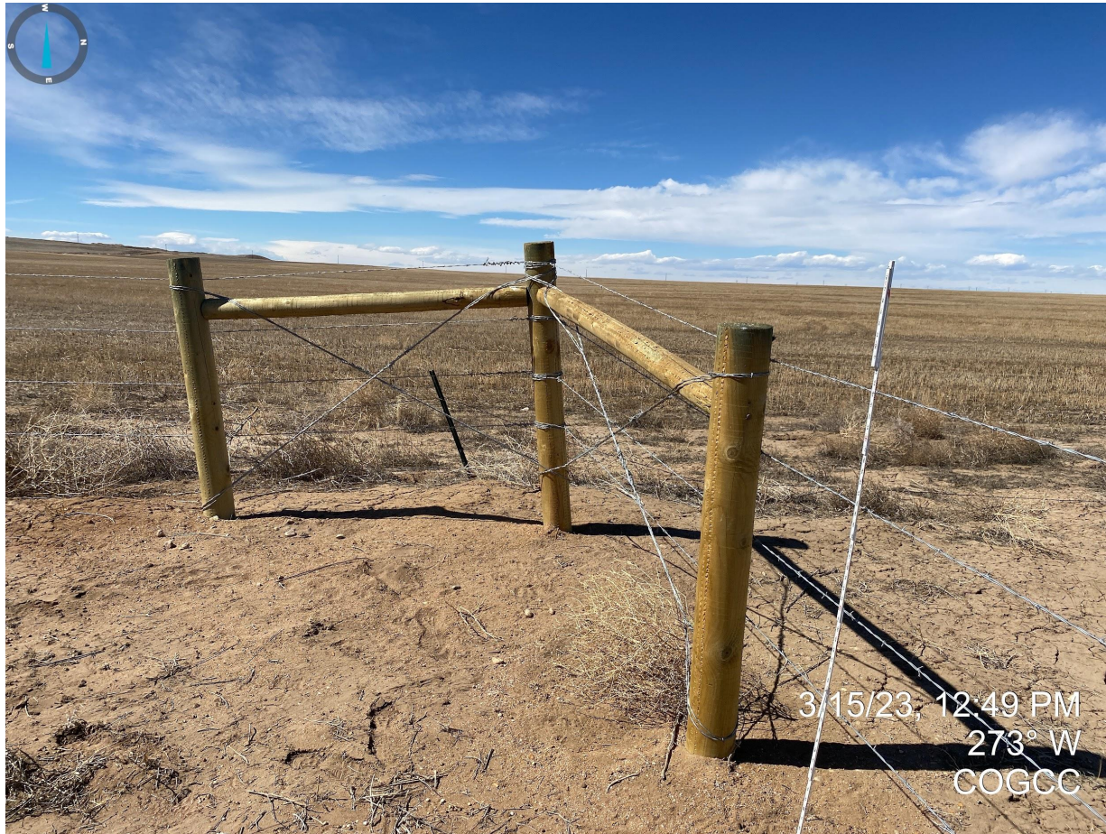
Photo 9. Facing west from the northwest corner of the location. Per Wildlife BMP/COA #9 on the Approved Form 2A (Doc #401906116), "The operator agrees to install raptor perch deterrents on equipment, fences, cross arms and pole tops in plains sharp-tailed grouse habitat". No raptor perch deterrents were observed along any of the fence line during this inspection.