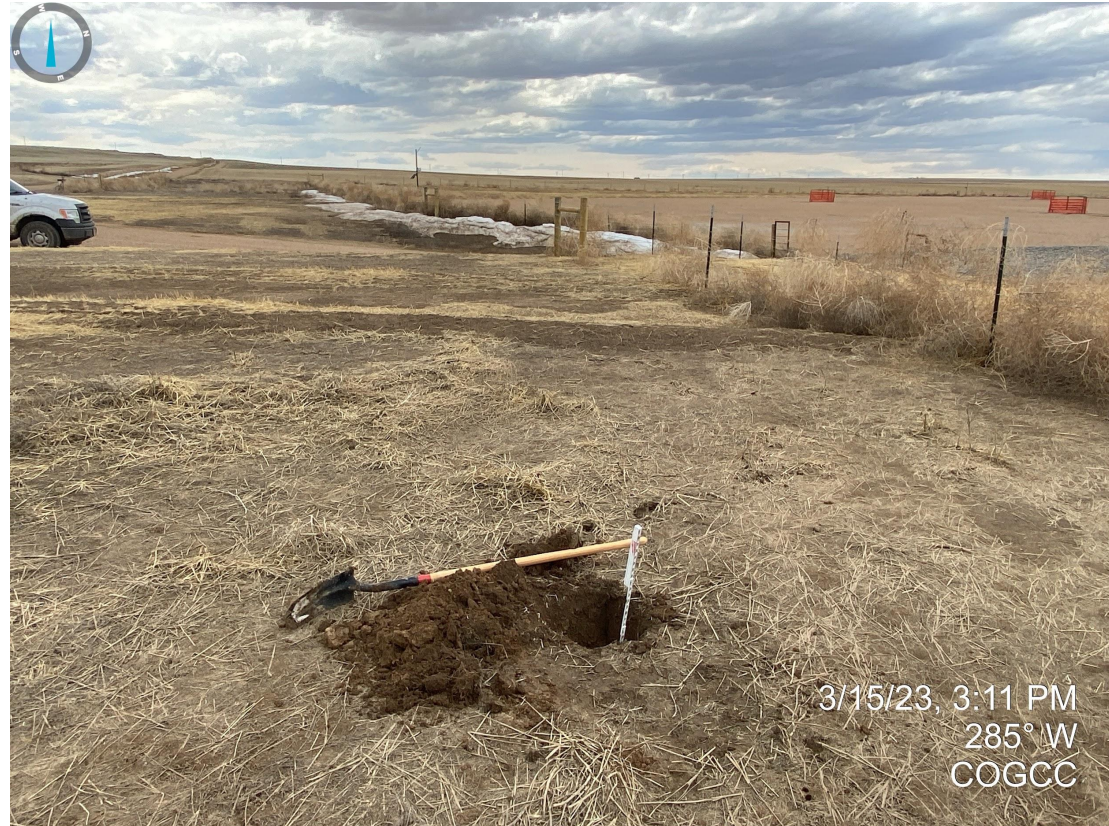
Photos 6 & 7. Close up photo of Staff soil pits, taken southeast of location entrance. Photo 6 (left) illustrates that approximately 10" of topsoil was observed from soil pit based on soil characteristics.