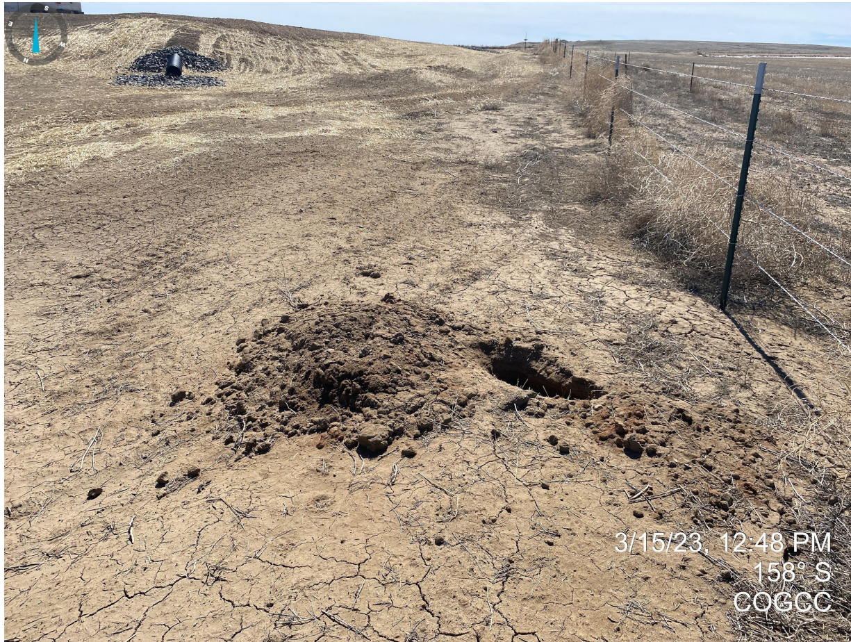
Photo 2. Facing south at the northwest corner of the location, near the sediment trap. An animal burrow was observed on the berm of the sediment trap and will need to be repaired per Rule 1002.f.(2)C.