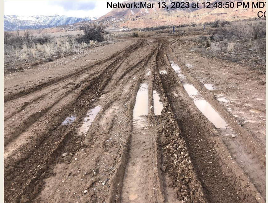
Access road and location entrance.