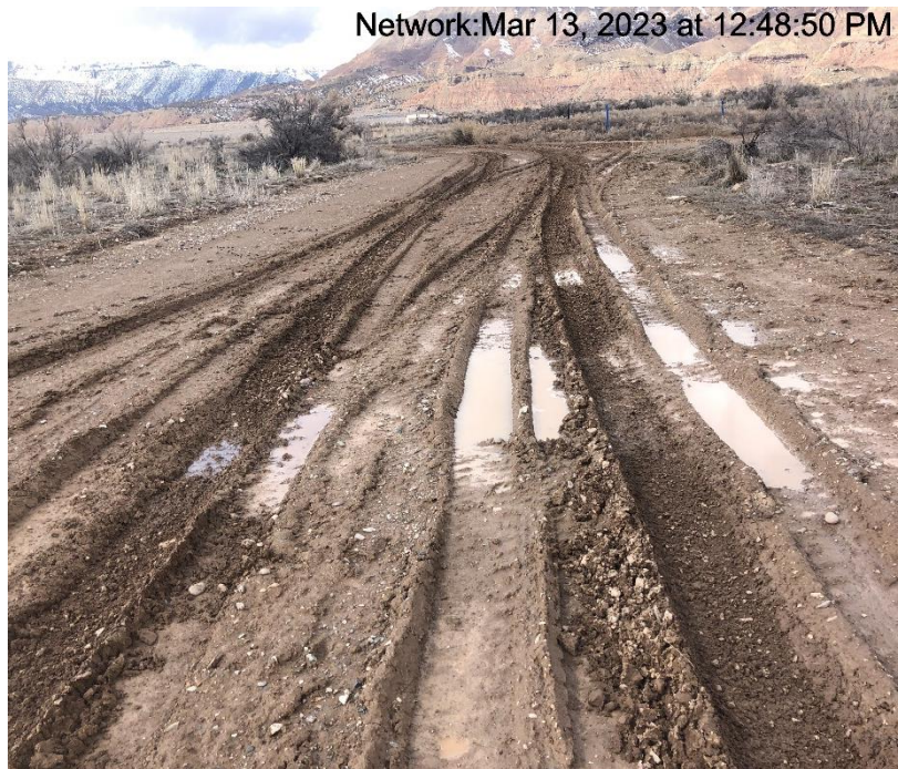
Photo #9234 Insufficient tracking BMP at entrance to location to minimize the transport of sediment.