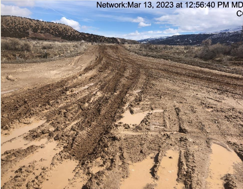
Photo #9251 Insufficient tracking BMP at entrance to access road to minimize the transportation of sediment.