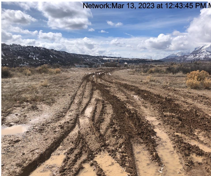
Photo #9233 Insufficient tracking BMP at entrance to location to minimize the transport of sediment.