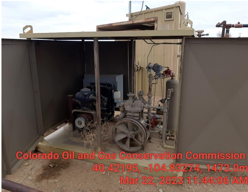
Photo 9 Unused equipment/Mechanical issue, pump and motor have no belts and piping has been removed not operational. Stained soil