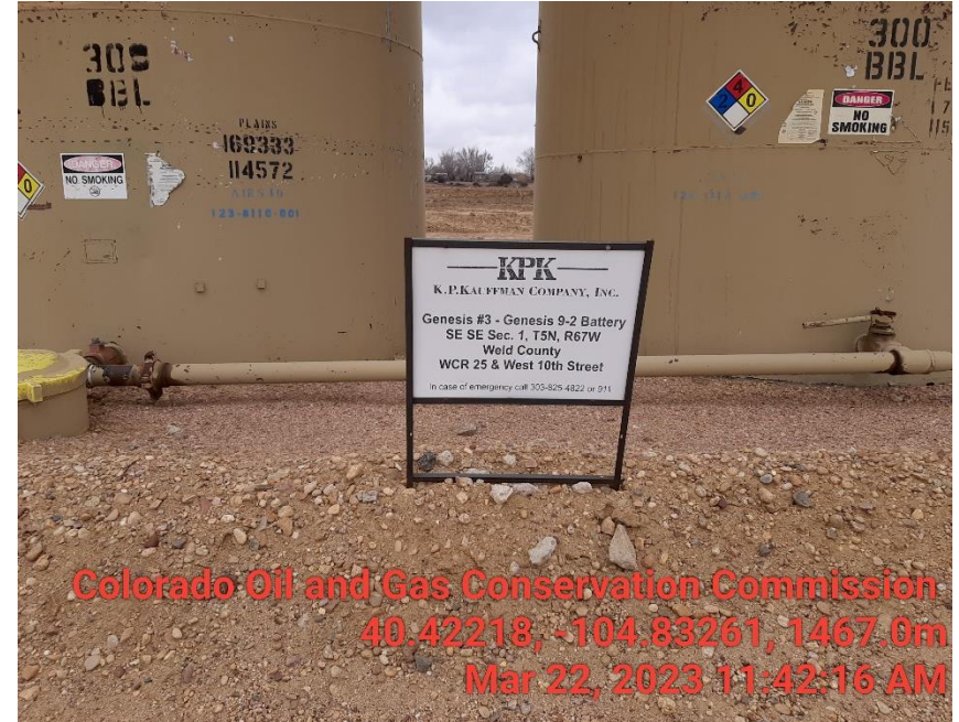
Photo 6 TNK BTRY sign