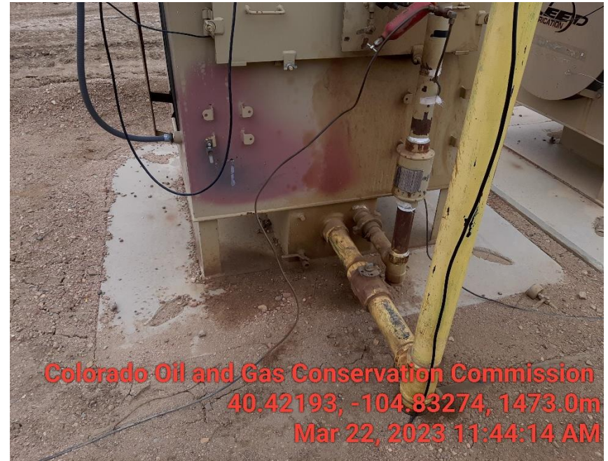
Photo 10 Stained soil/Mechanical issue piping on ECD