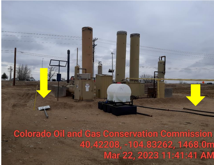
Photo 5 unused equipment sign and 2' hose.