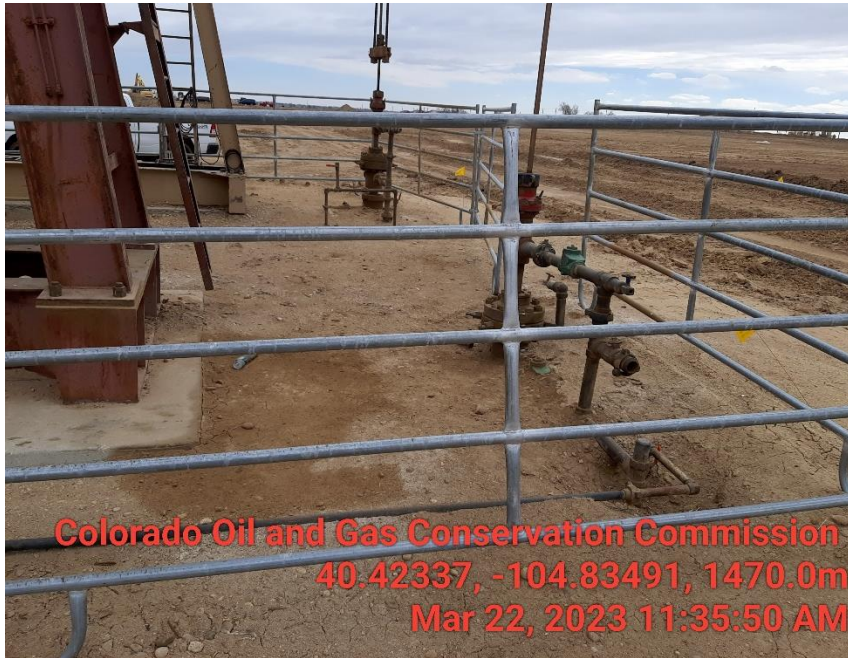
Photo 3 stained soil on Genesis 9-2