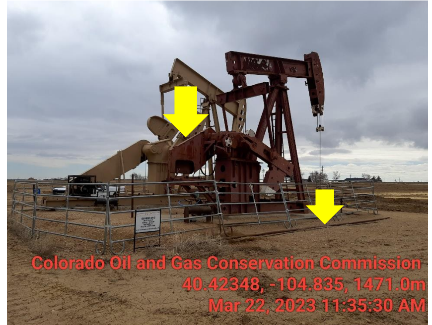
Photo 2 Genesis #9-2 PU has no motor, tubing and rod on ground. PU is considered unused equipment due to not having a motor.