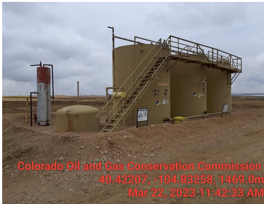
Photo 7 TNK BTRY