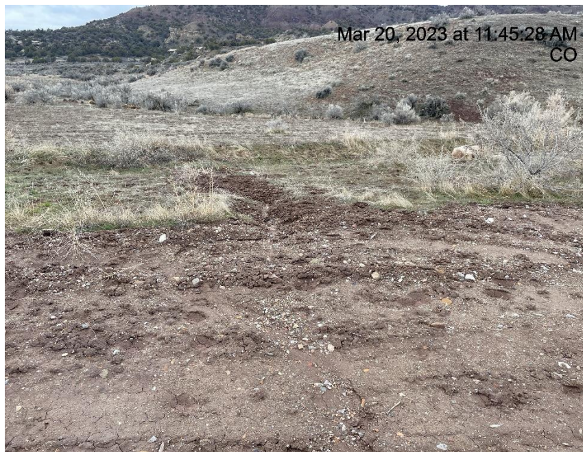
Photo # 2637 Rill erosion & transport of sediment off location (west side)