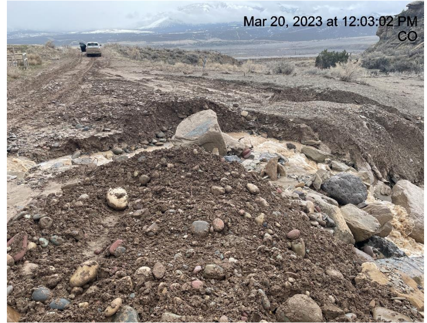
Photo # 2658 Degradation of roadway/insufficient BMP's/erosion of area near road