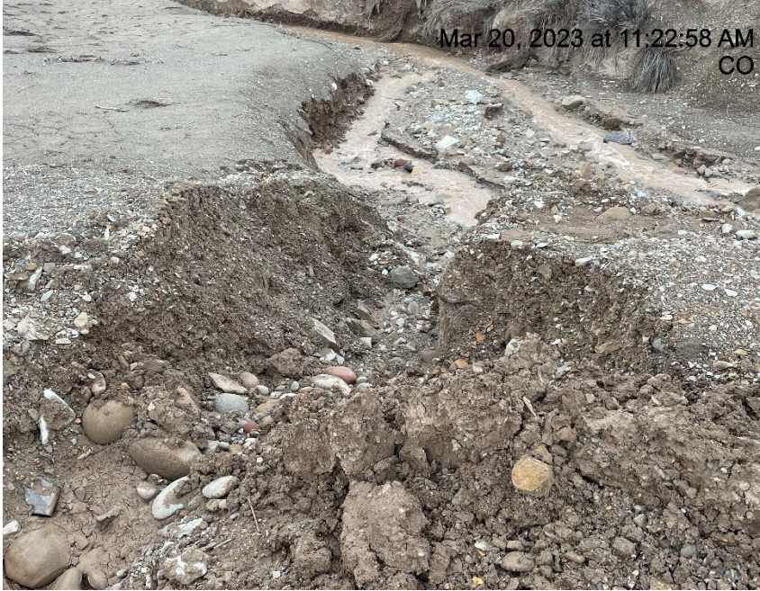
Photo # 2613 Degradation of roadway/insufficient BMP's/erosion of area near road