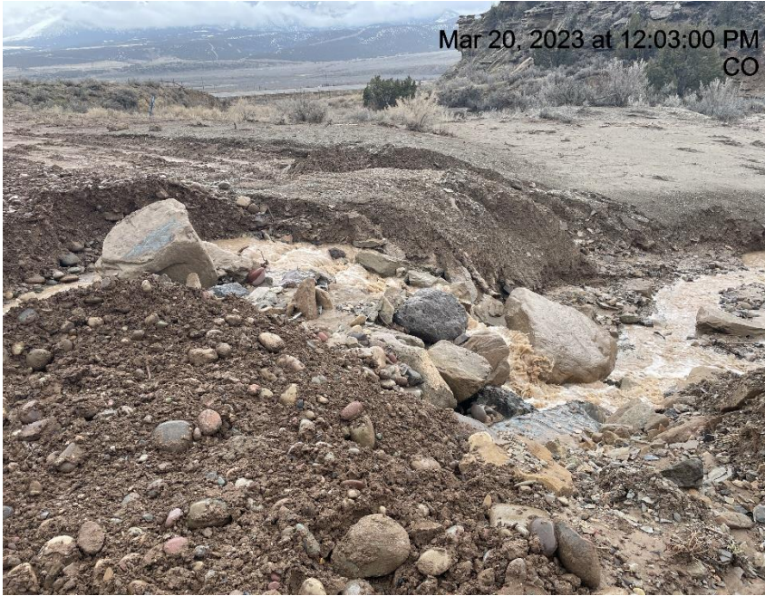
Photo # 2657 Degradation of roadway/insufficient BMP's/erosion of area near road