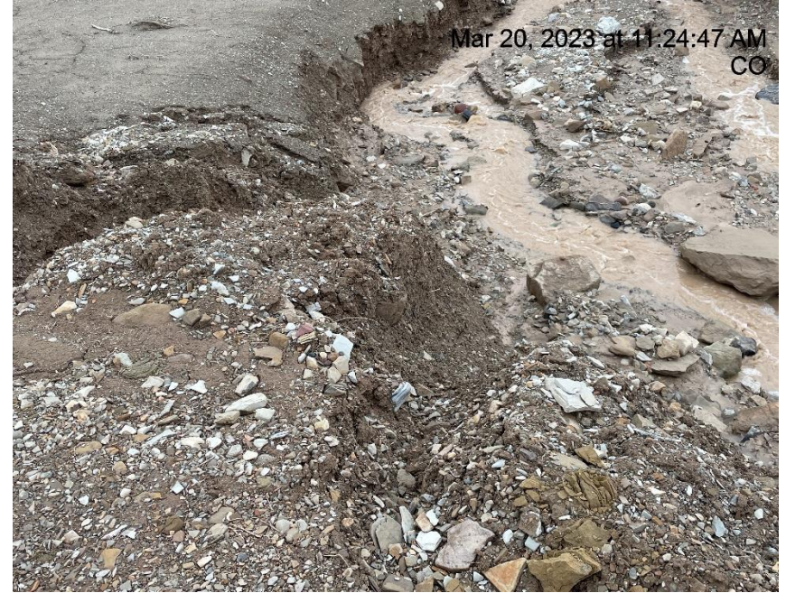
Photo # 2618 Degradation of roadway/insufficient BMP's/erosion of area near road