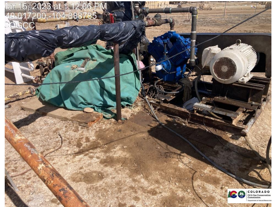
Pic 12 transfer motor, stained soil needs to be removed.