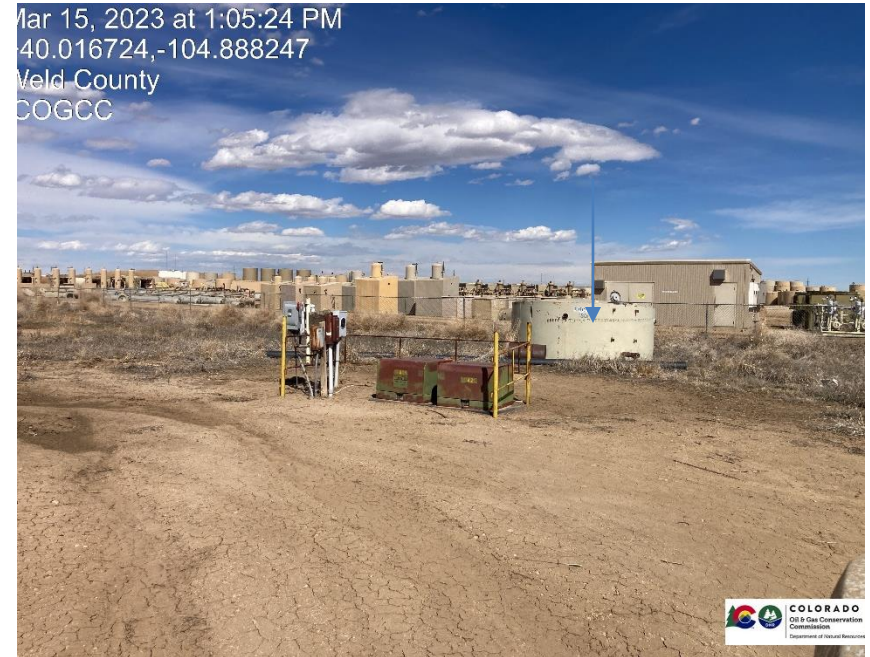
Pic 2 unused tank on location needs to be removed