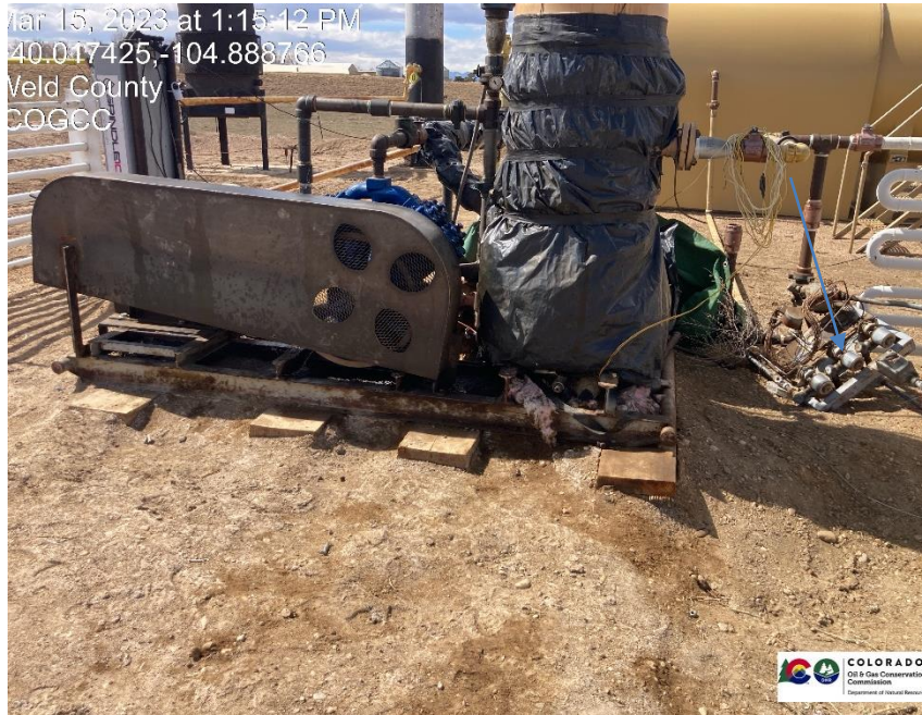
Pic 17 transfer pump, trash and stained soil needs to be removed.