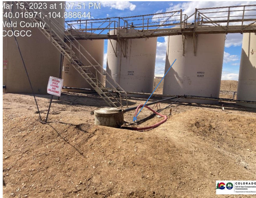
Pic 5 tanks, stained soil near loadout line.