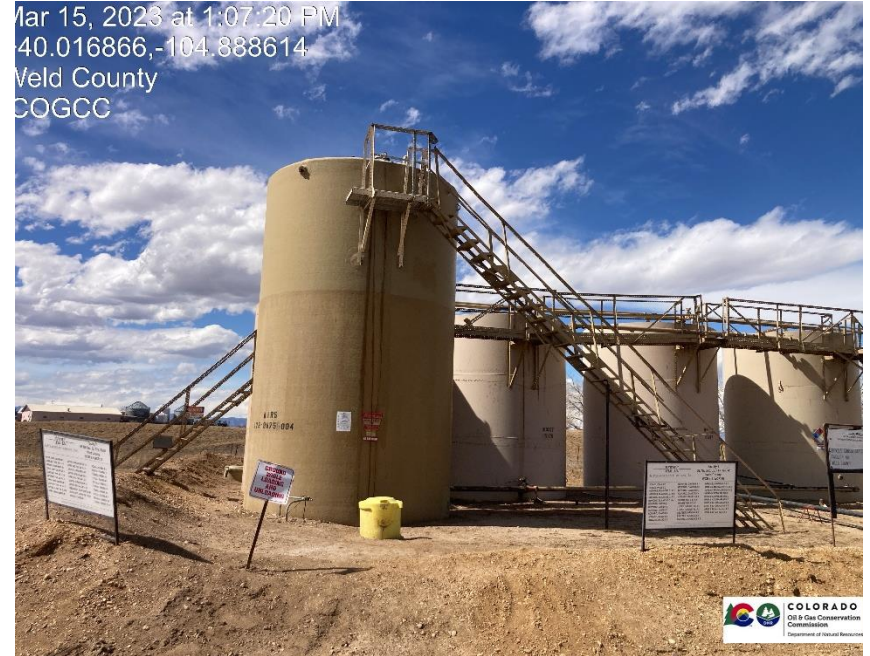
Pic 4 Tanks

Mar 15, 2023 at 1:07:20 PM 40.016866,-104.888614 Veld County COGCC