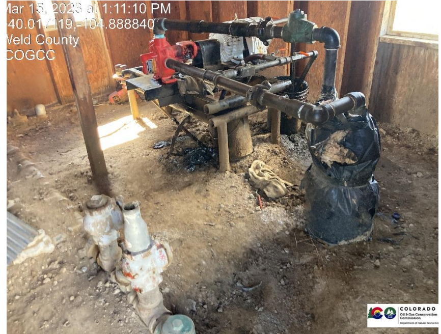
Pic 8 stained soil in motor house needs to be removed

Mar 15, 2023 at 1:11:10 PM 40.017119, -104.888840 Veld County COGCC