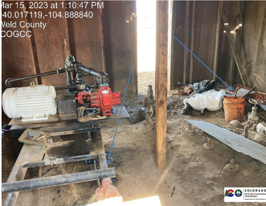
Pic 7 Motor house, trash and unused equipment needs to be removed from motor house. Stained soil needs to be removed

Mar 15, 2023 at 1:10:47 PM 40.017119, -104.888840 Veld County COGCC