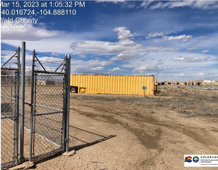
Pic 3 tank on location needs to be removed

Mar 15, 2023 at 1:05:32 PM 40.016724,-104.888110 Veld County COGCC