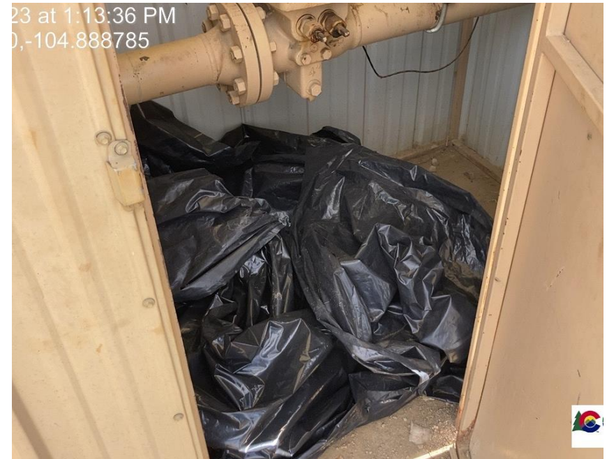
Pic 14 trash inside gas meter run needs to be removed