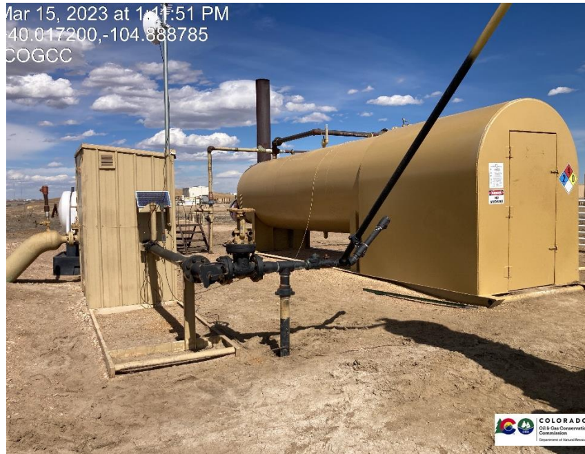
Pic 11 GMR, Separator