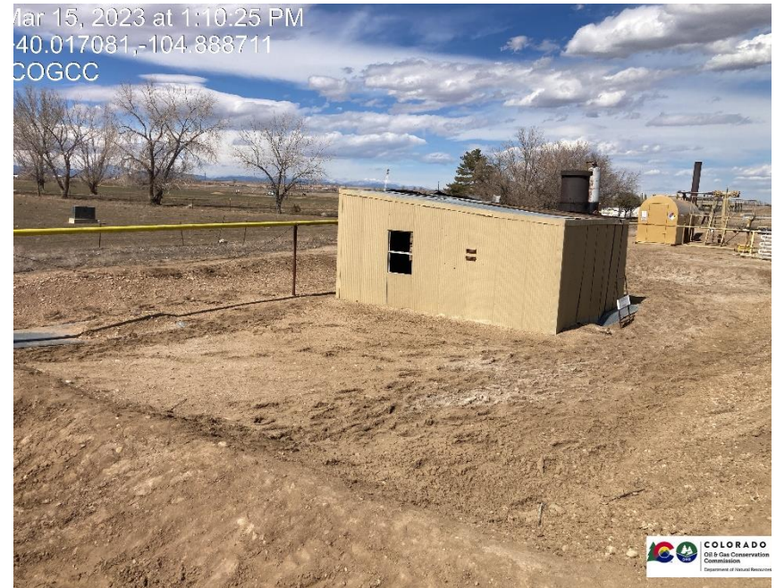
Pic 6 Motor house