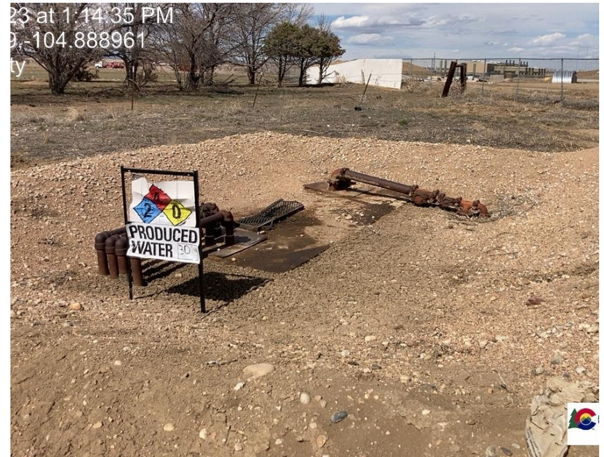
Pic 16 flow manifold, stained soil needs to be removed