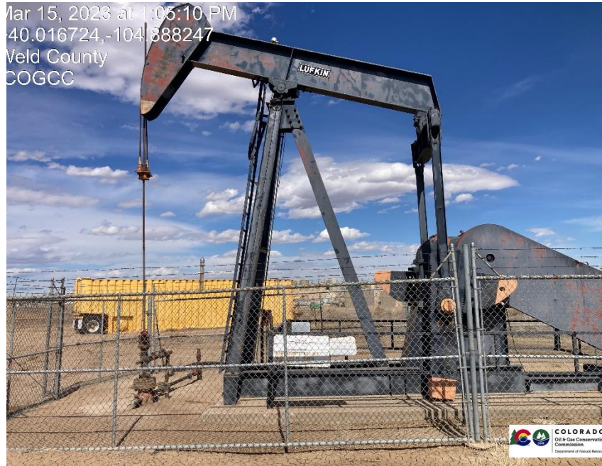
Pic 1 wellhead