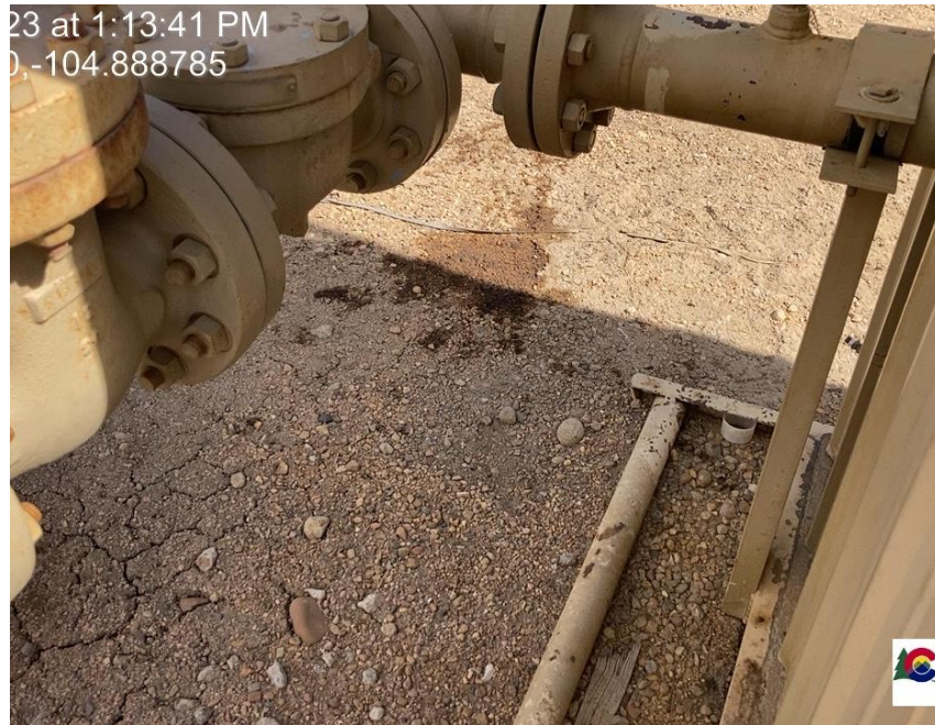
Pic 15 stained soil by gas meter run needs to be removed