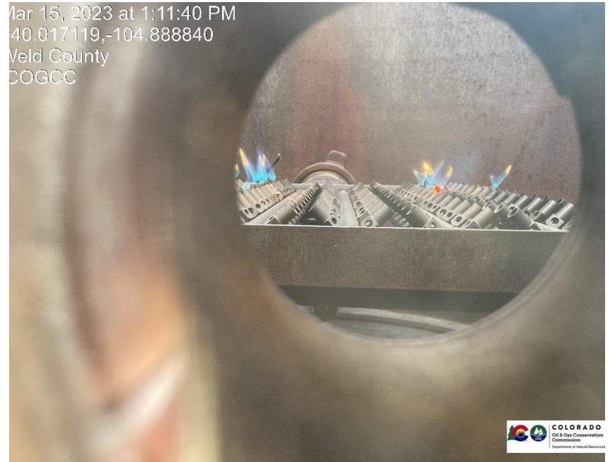
Pic 10 ECD flame.

Mar 15, 2023 at 1:11:40 PM 40.017119,-104.888840 Veld County COGCC