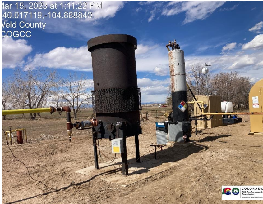
Pic 9 ECD, Separator

Mar 15, 2023 at 1:11:22 PM 40.017119,-104.888840 Veld County COGCC