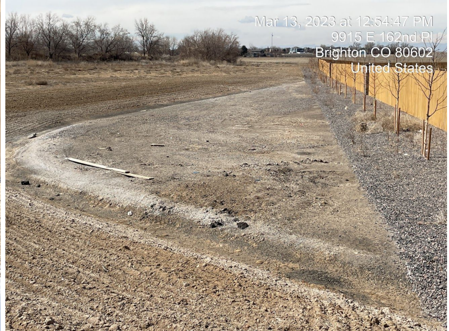
Photo 7. Photo of outside the perimeter fence, trash and weed debris accumulated in the landscaping.