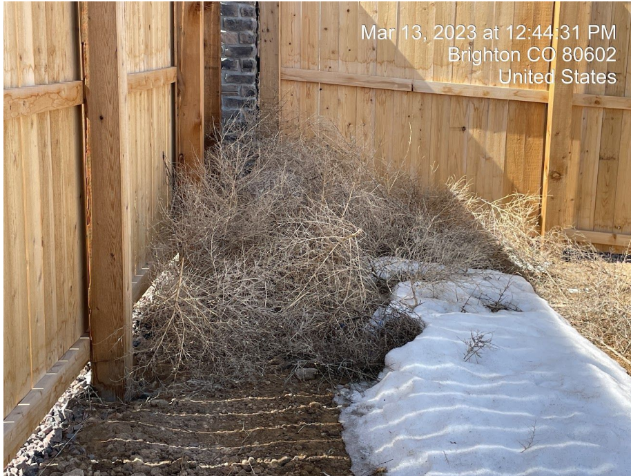
Photo 6. Photo taken of weed debris in the corners of the perimeter fence.