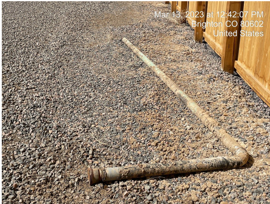
Photo 4. Photo taken of unused piping on site