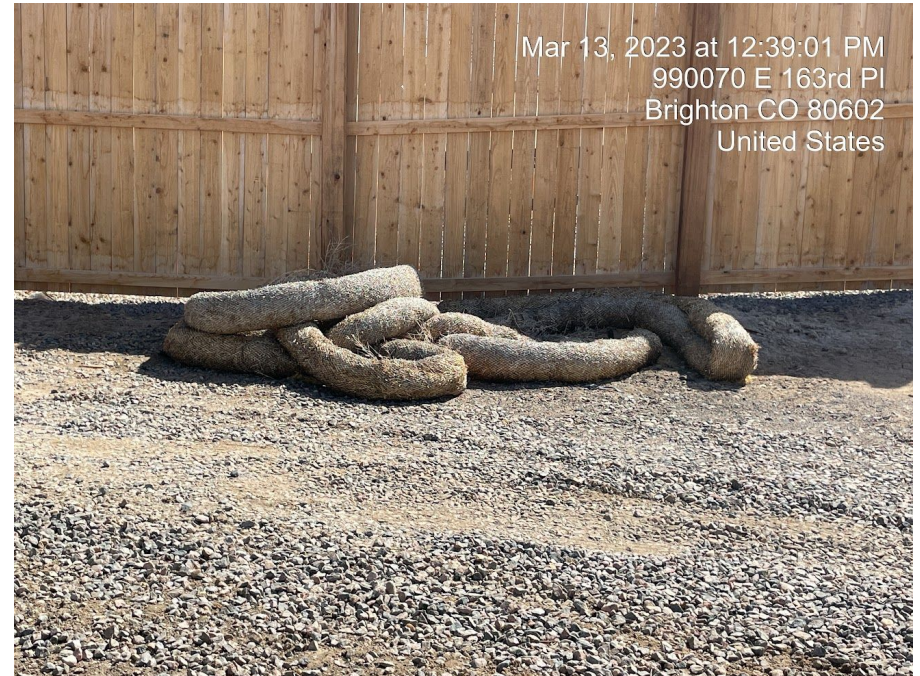
Photo 3. Photo taken of unused straw wattles on site.