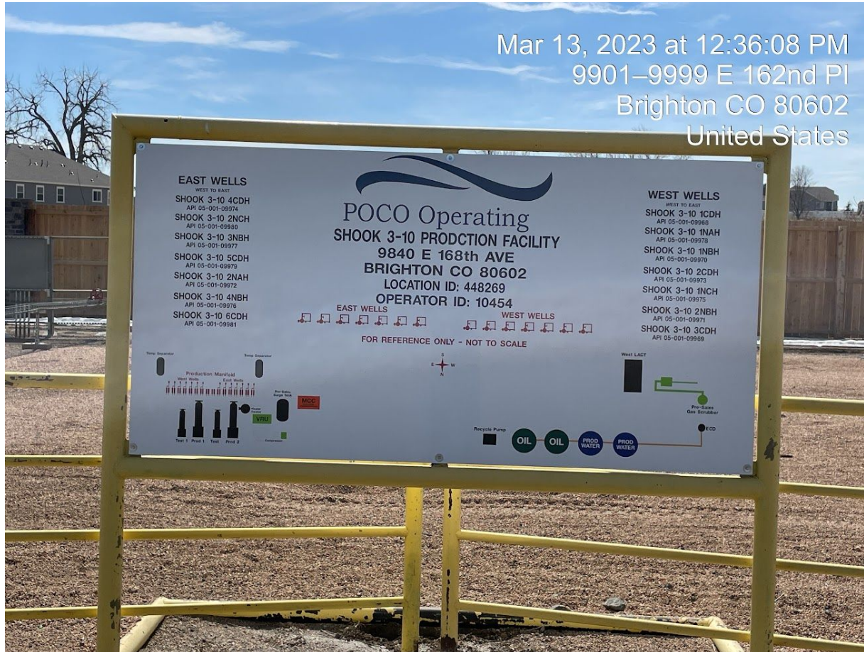
Photo 1. Photo taken of location sign at entrance of location.