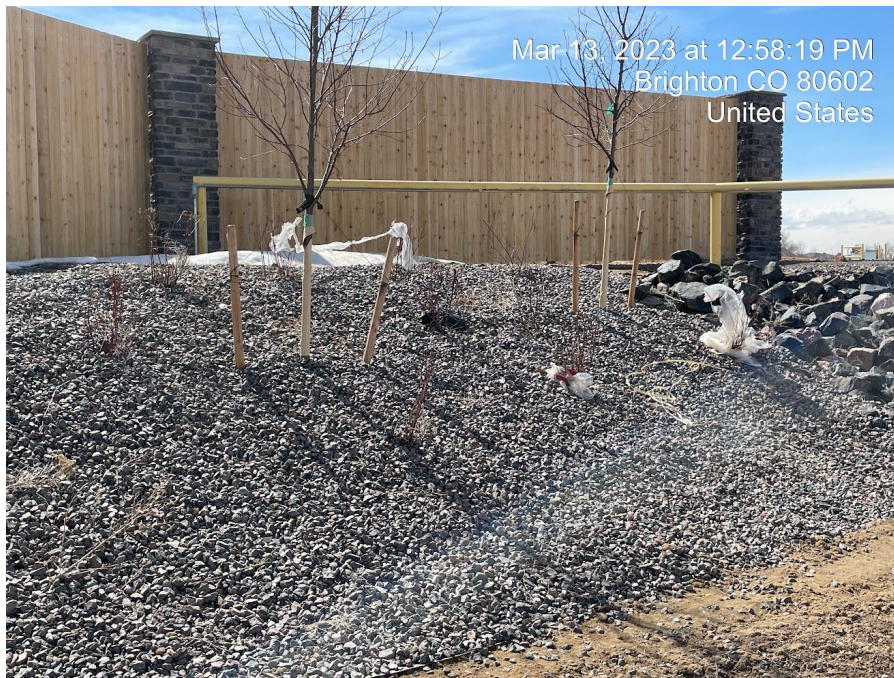
Photo 8. Photo of trash blown onto site's landscaping.