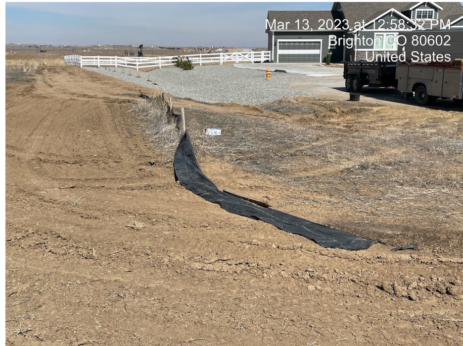
Photo 9. Photo of downed silt fence at entrance of location.