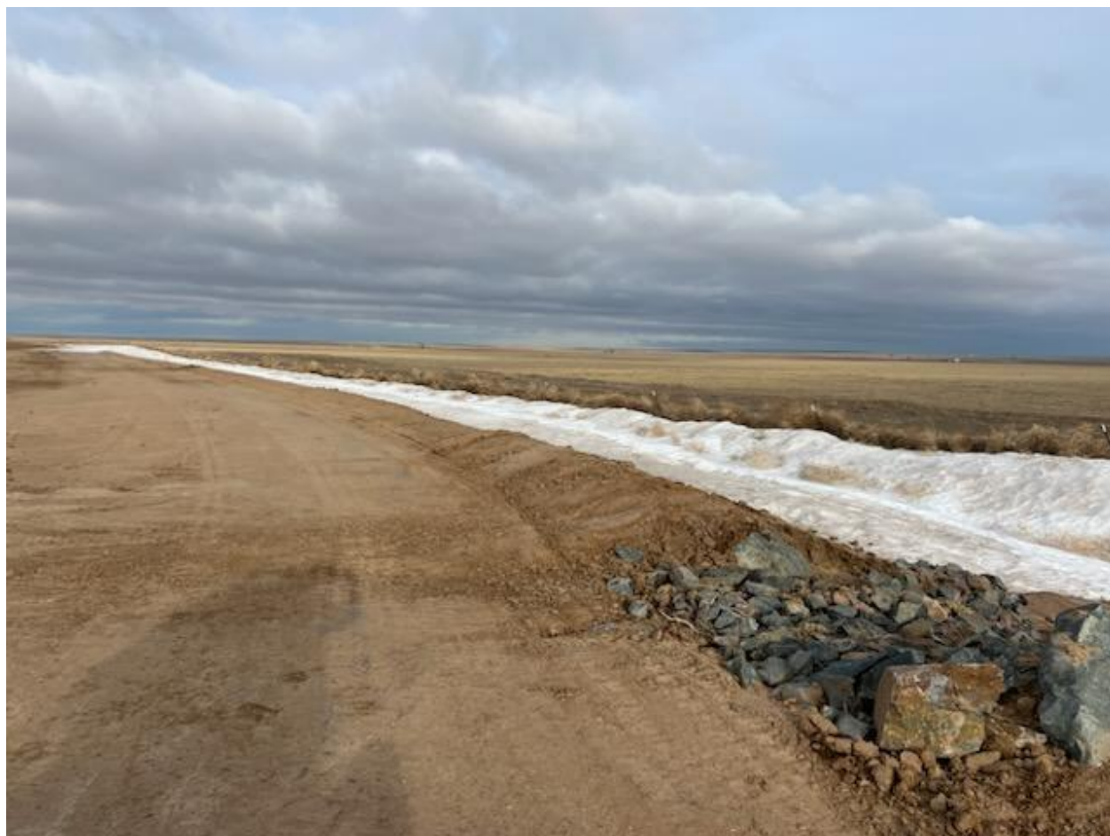
Inspection Photos Location Name: Cinnamon Teal Pad Location ID: 454592