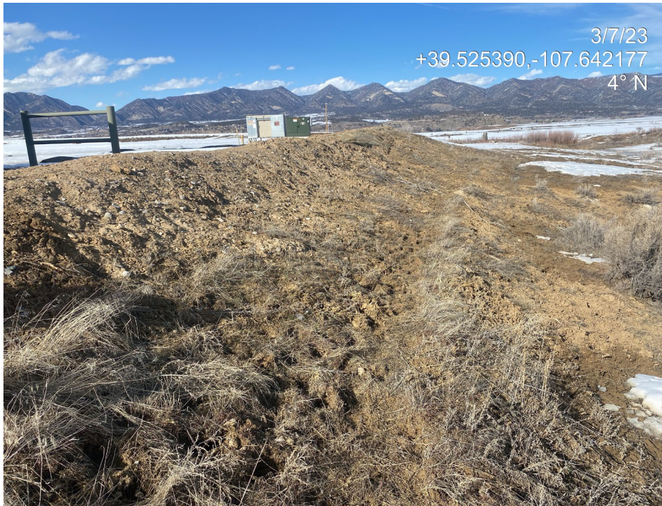
Photo 5. Photos show eastern interim areas/slopes. No perennial vegetation observed. Bare ground and annual species dominate. Stormwater BMPs have only been installed on a small portion of the slope are in disrepair. Soils are bare, unprotected.