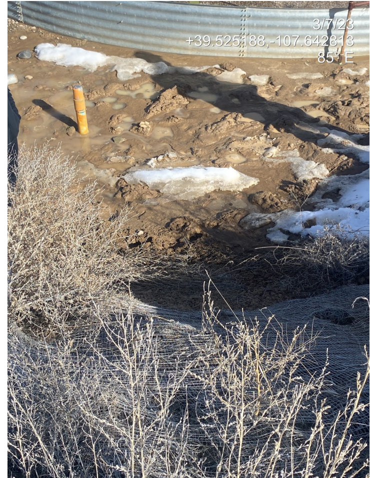
Photo 4. Photos shows the cut slope to the south of the location. BMPs (erosion control blankets) are in disrepair and are degrading. Erosion is evident. Note rill erosion (left) and sediment accumulation at the base of the cut (right) indicating loss of soil from the slope.