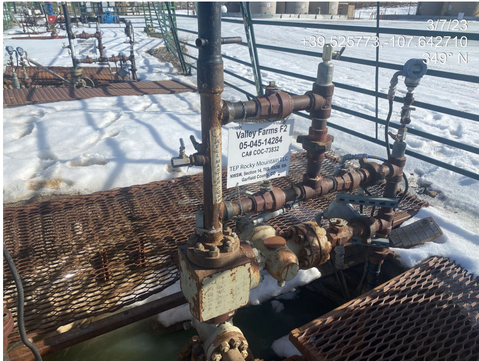
Photo 2. Photos show well API # 045-14284. Bubbles were rising in stormwater within the well cellar, indicative of a potential leak.