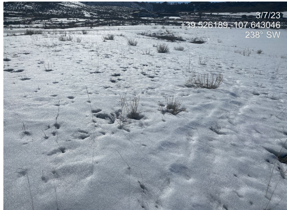
Photo 6. Photos show an example of interim areas to the north (left) and west (right). Perennial species appear established.