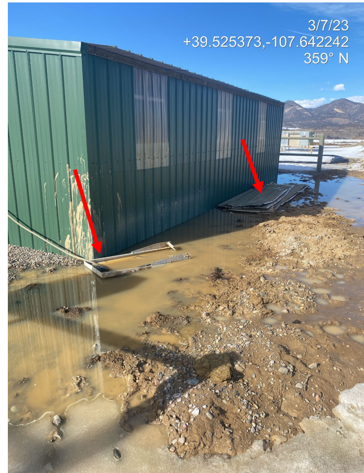
Photo 3. Photos show storage of supplies/unused equipment within the tank battery secondary containment (left) and debris, (right) including electrical equipment in disrepair within a puddle.