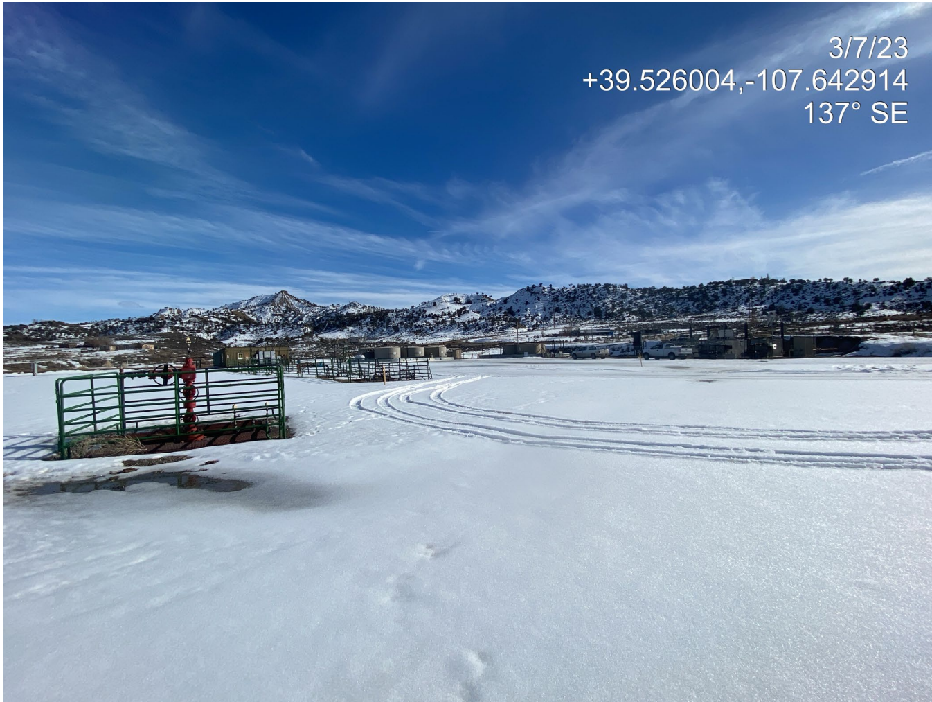
Photo 1. Photo taken from the north shows an overview of the location.