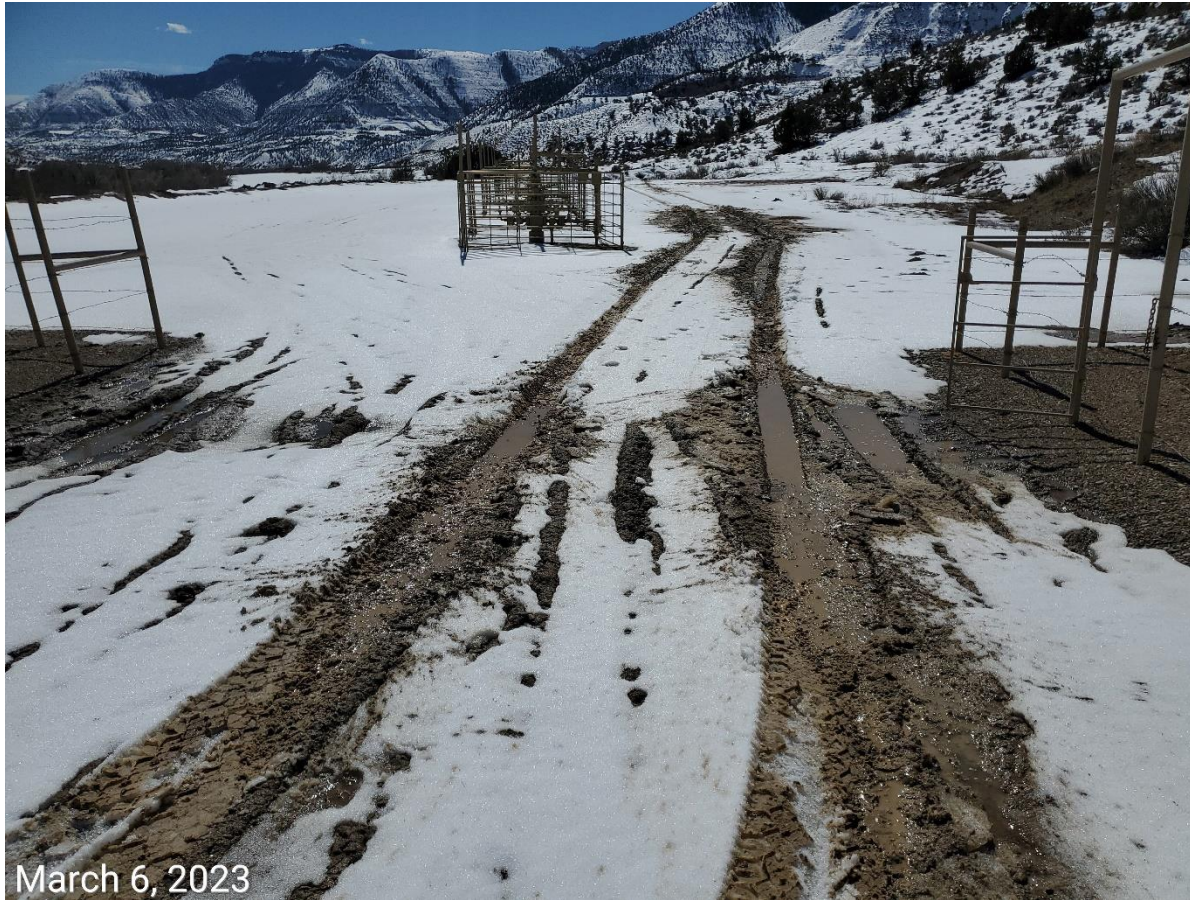
Photo 4: Photos 4-8 examples showing BMPs to stabilize, as well as to minimize degradation, tracking and sediment transport are missing or insufficient at the Location and access road.