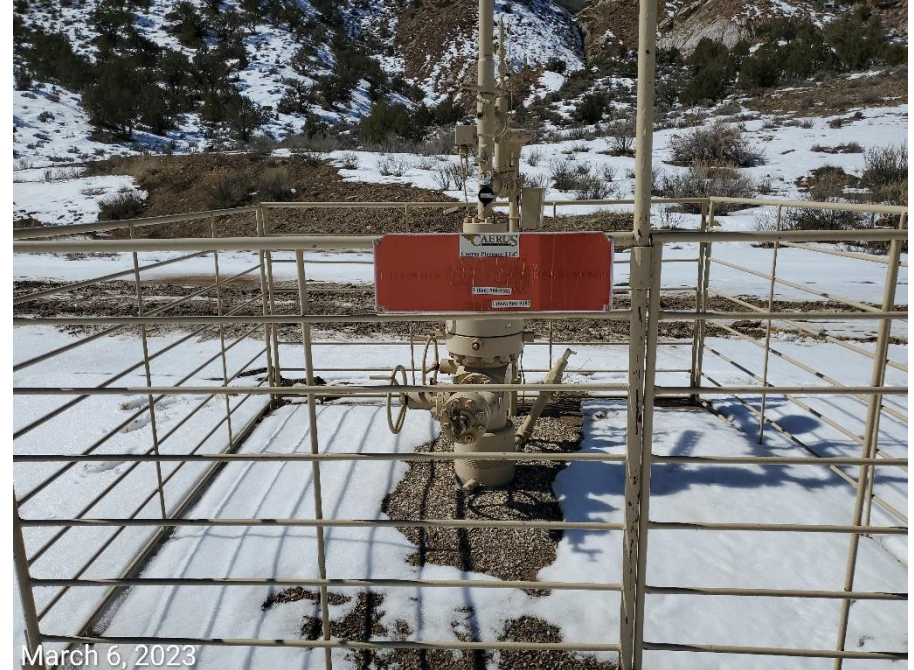
Photo 1: Photos left shows signage missing from the 24B-12D well. Photo right example showing remaining signs are becoming illegible.