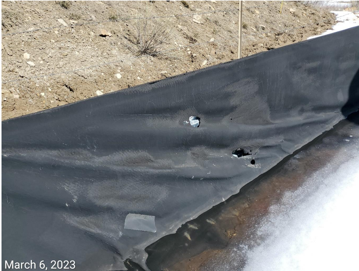
Photo 2: Photos 2-3 examples showing various holes/tears observed throughout liner at the tank battery.