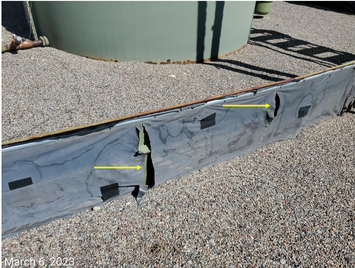
Photo 4: Photo shows various tears/holes observed within liner; liner no longer impervious to contain a spill.