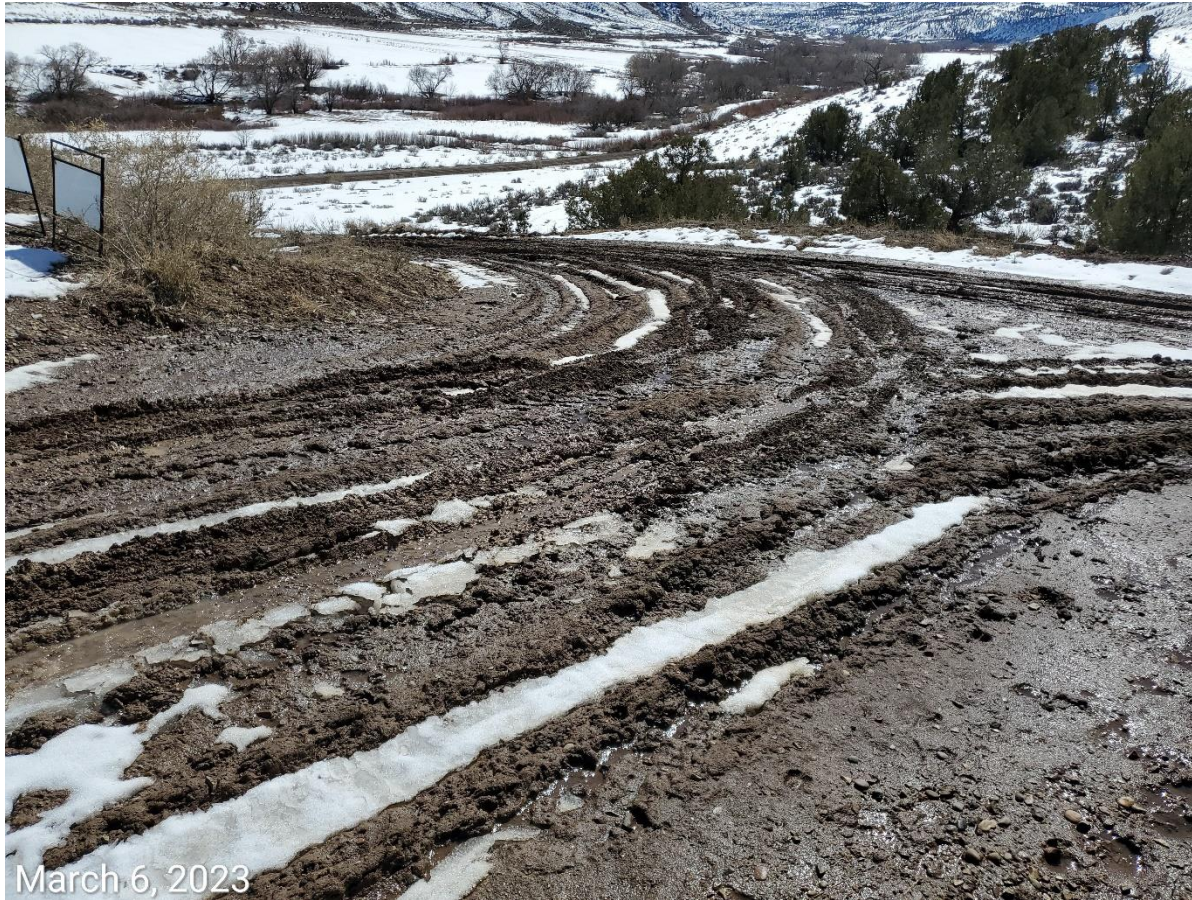
Photo 5: Photo taken from the location entrance. Photo shows BMPs to minimize degradation, tracking and sediment transport are missing or insufficient at the Location and access road.