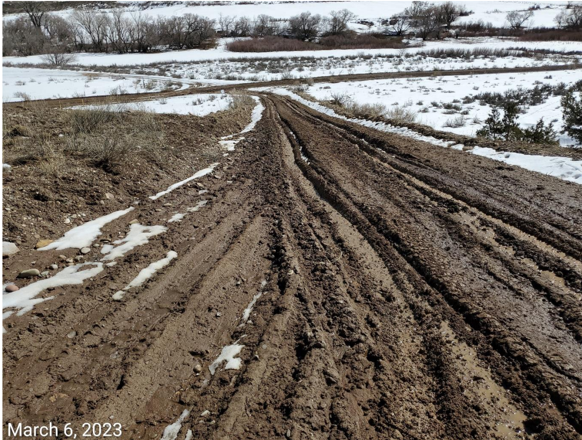
Photo 6: Photos 6-11 examples showing BMPs to manage runoff, minimize degradation, tracking and sediment transport are missing or insufficient at the access road.