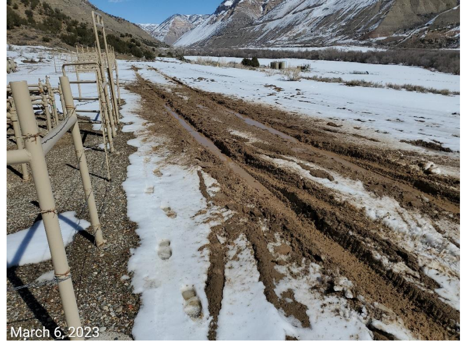
Photo 3: Photos example showing BMPs to degradation, tracking and sediment transport are missing or insufficient on the Location.