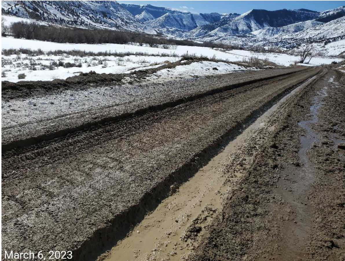
Photo 5: Photos 5-7 examples showing tracking, degradation and sediment transport along access road; BMPs to manage runoff, minimize tracking, degradation and sediment transport are missing or insufficient along the main North/South access road leading to the Location.