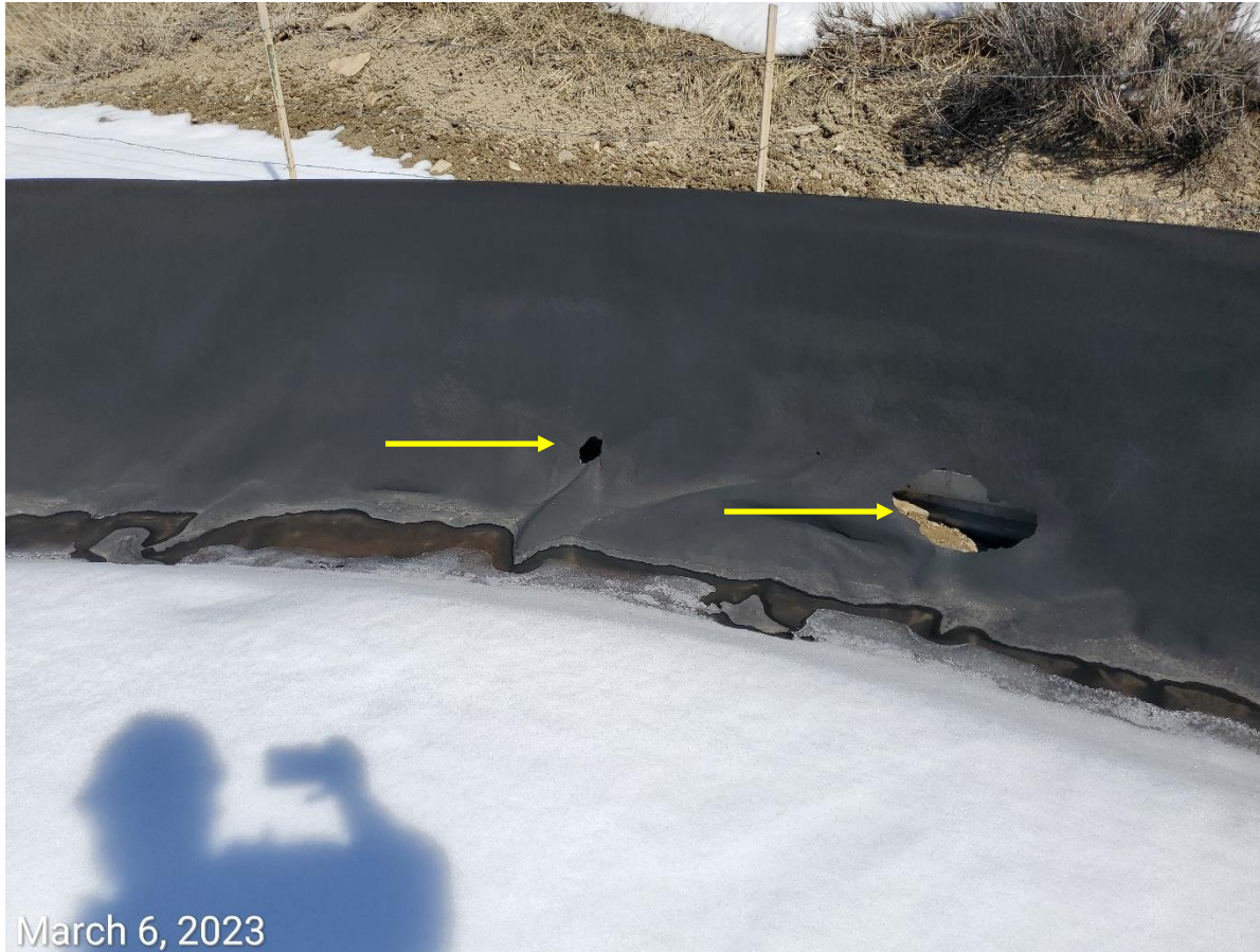
Photo 1: Photos 1-4 examples showing liner integrity at the tank battery remains compromised.