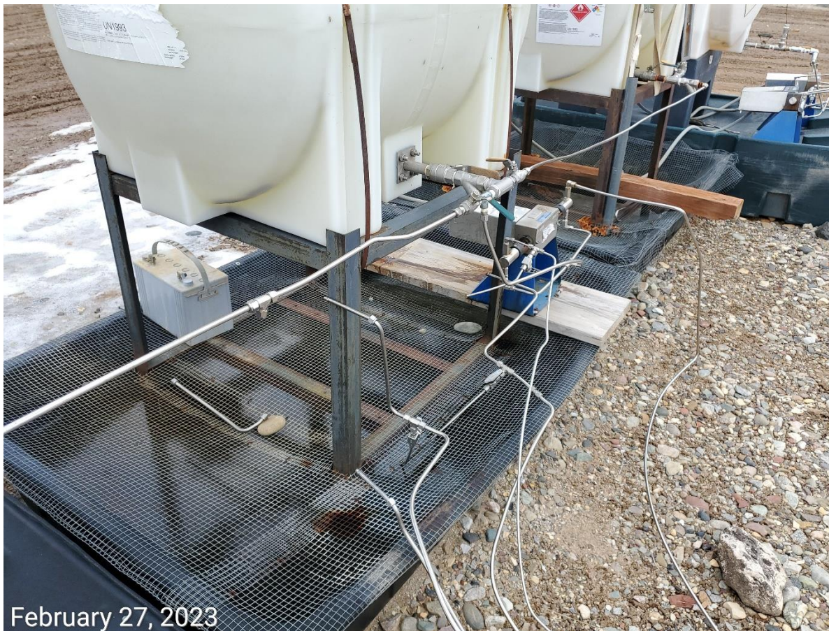
Photo 5: Methanol tanks- containment BMPs partially filled with fluids. Advise removal of fluids to ensure containment BMP remains in proper functioning condition.