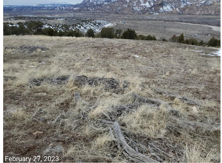
Photo 6: Photos 6-8 provide overview of the Interim areas of the Location. Limited reclamation inspection due to winter conditions; areas appear to be progressing towards 1003 standards.