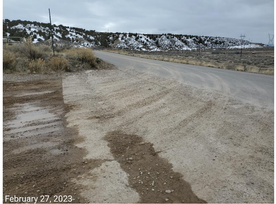
Photo 9: Photo taken from the access road entrance, from the County Road (Stone Quarry Rd). Photos show BMPs to minimize tracking and sediment transport are missing or insufficient; tracking/sediment transport from the access road onto the County Road observed.