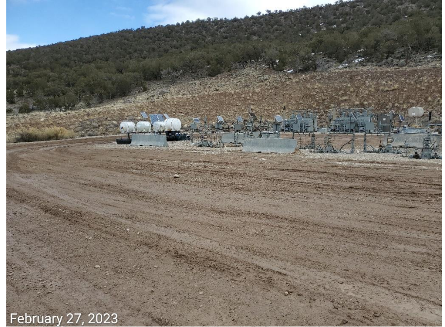
Photo 1: Photos 1-2 taken from the west end of the Location. Photos provide an overview of the Location from north, northeast, southeast to south.