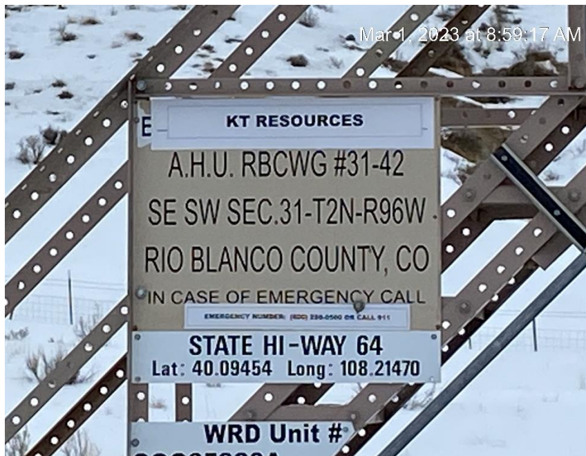
Sign at tank battery