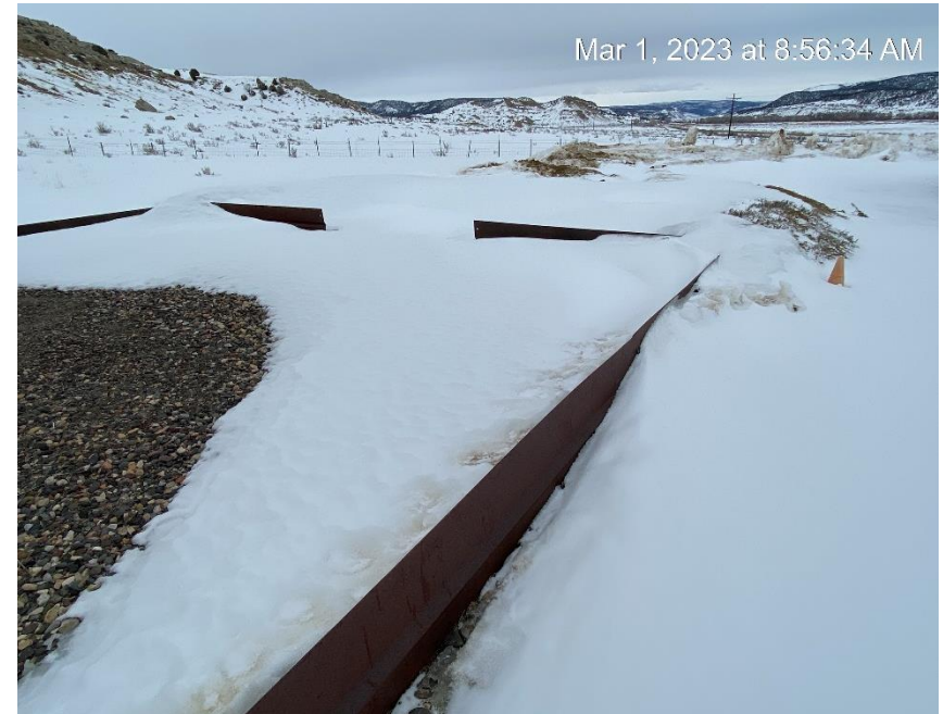
Earth berm repair on end of metal berm