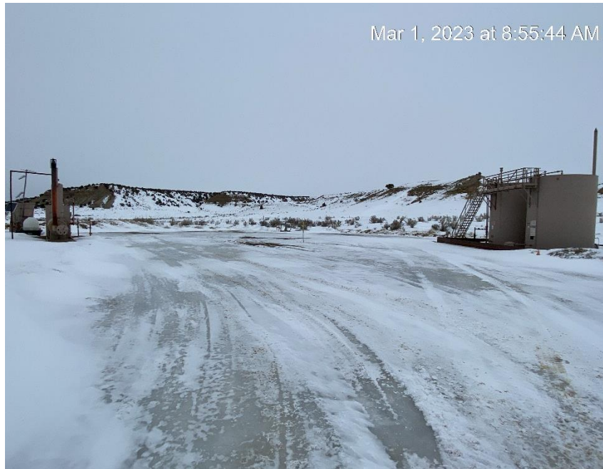
From entrance to location