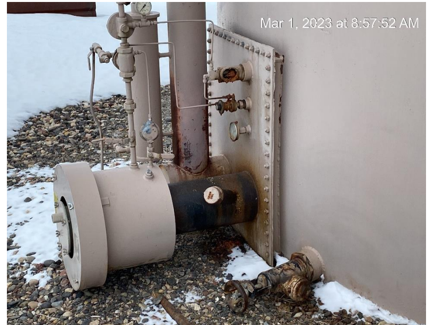
Stained soil below heater leak