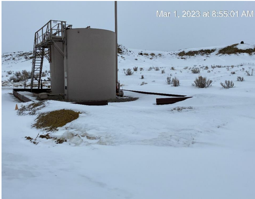
Earth berm repair on end of metal berm