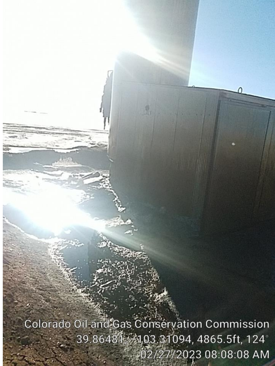
North side of treater inside berms.

Colorado Oil and Gas Conservation Commission 39.86481, -103.31094, 4865.5ft, 124° 02/27/2023 08:08:08 AM