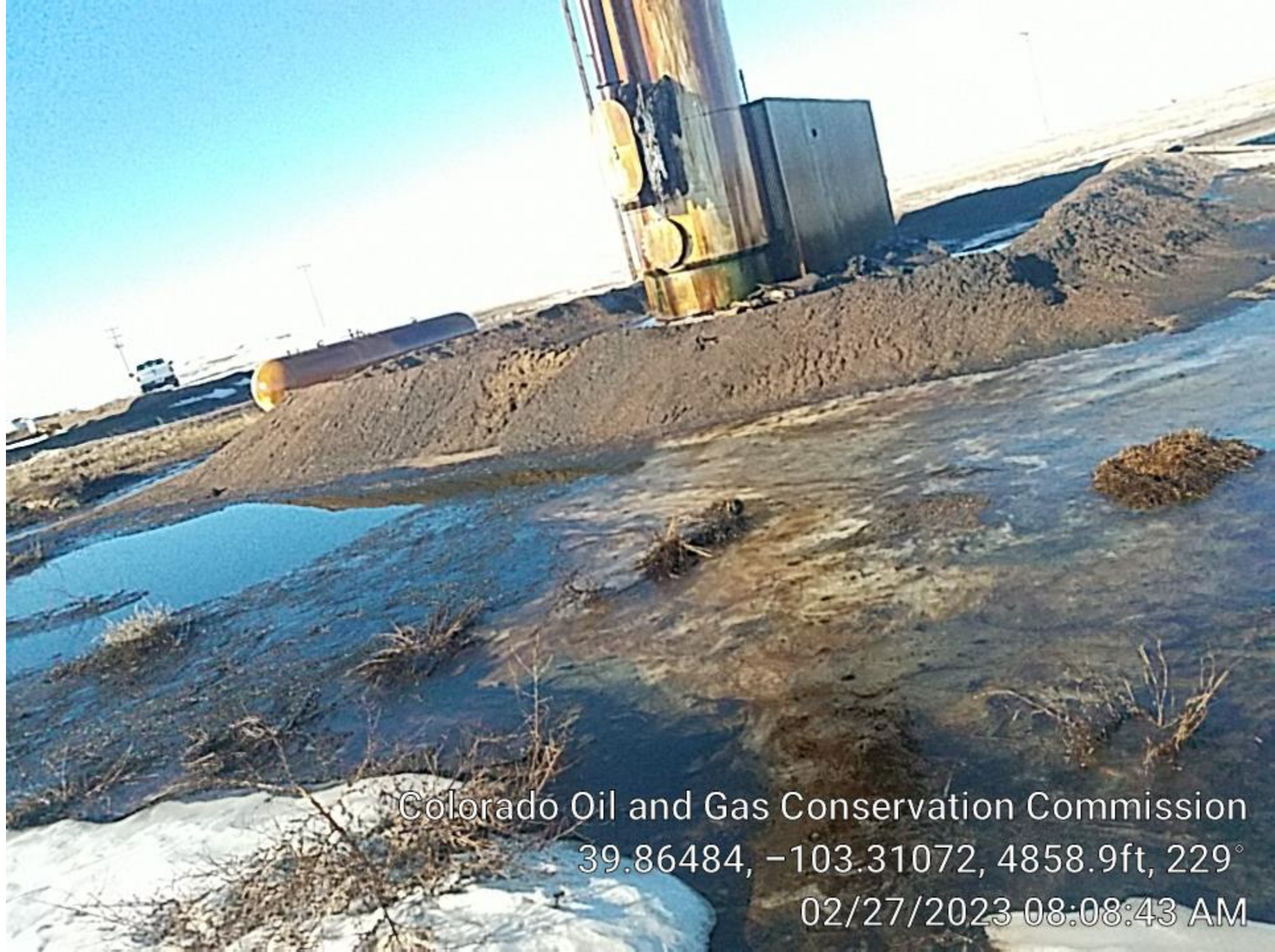
East side of treater berms.

Colorado Oil and Gas Conservation Commission 39.86484, -103.31072, 4858.9ft, 229° 02/27/2023 08:08:43 AM