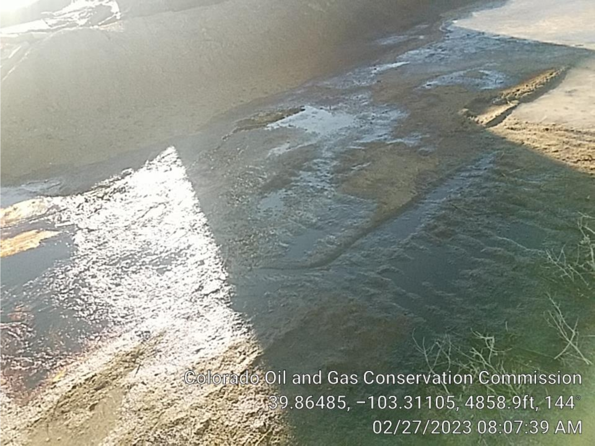
North side of treater berms.

Colorado Oil and Gas Conservation Commission 39.86485, -103.31105, 4858.9ft, 144° 02/27/2023 08:07:39 AM