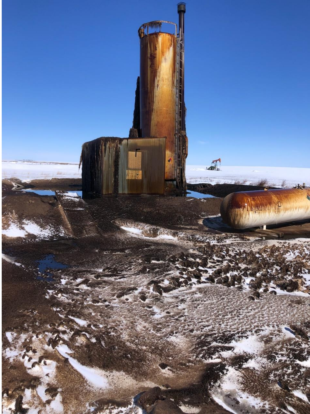
2/23/2023 photo pumper.