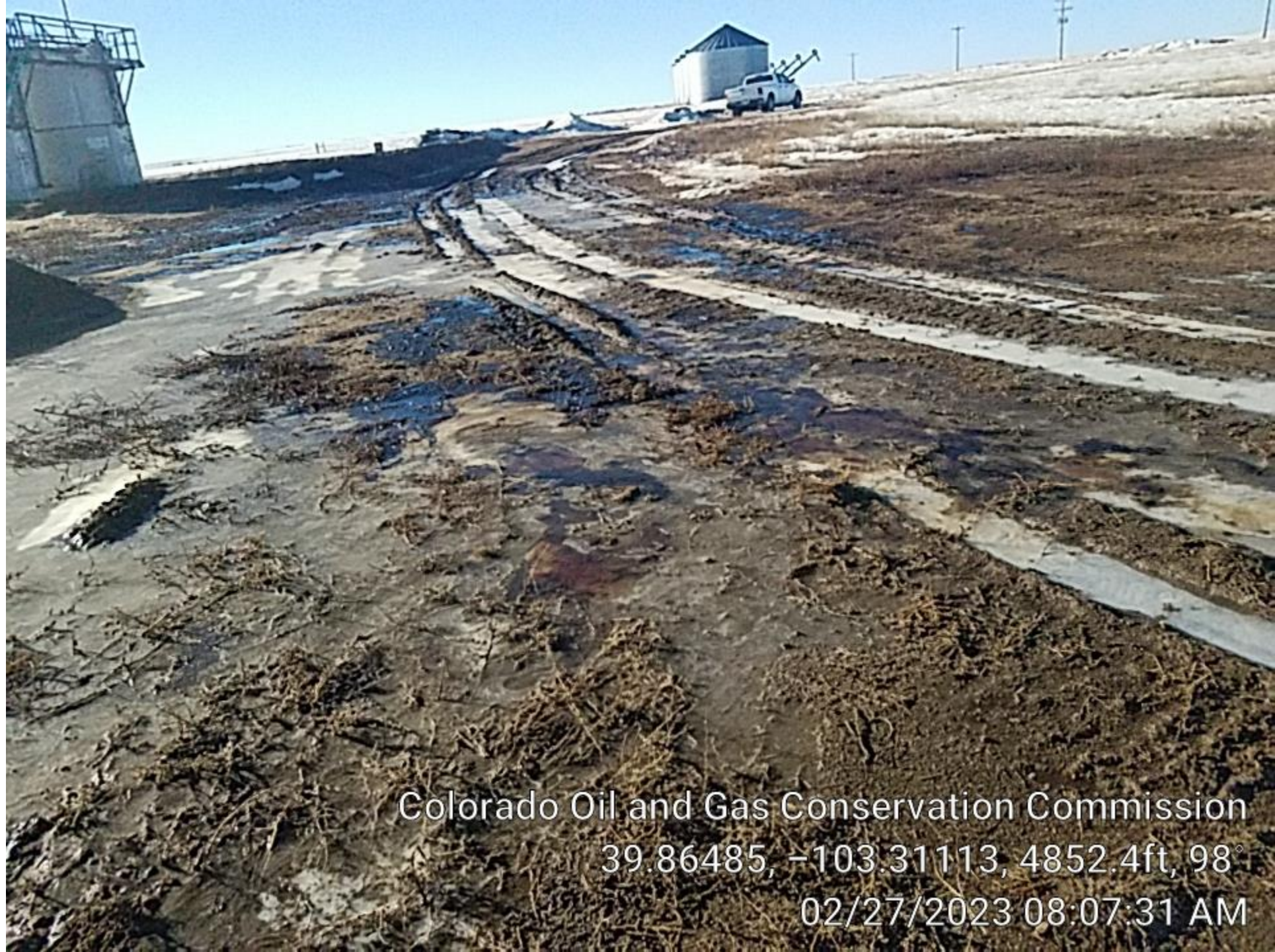
West side of tank battery.

Colorado Oil and Gas Conservation Commission 39.86485, -103.31113, 4852.4ft, 98° 02/27/2023 08:07:31 AM