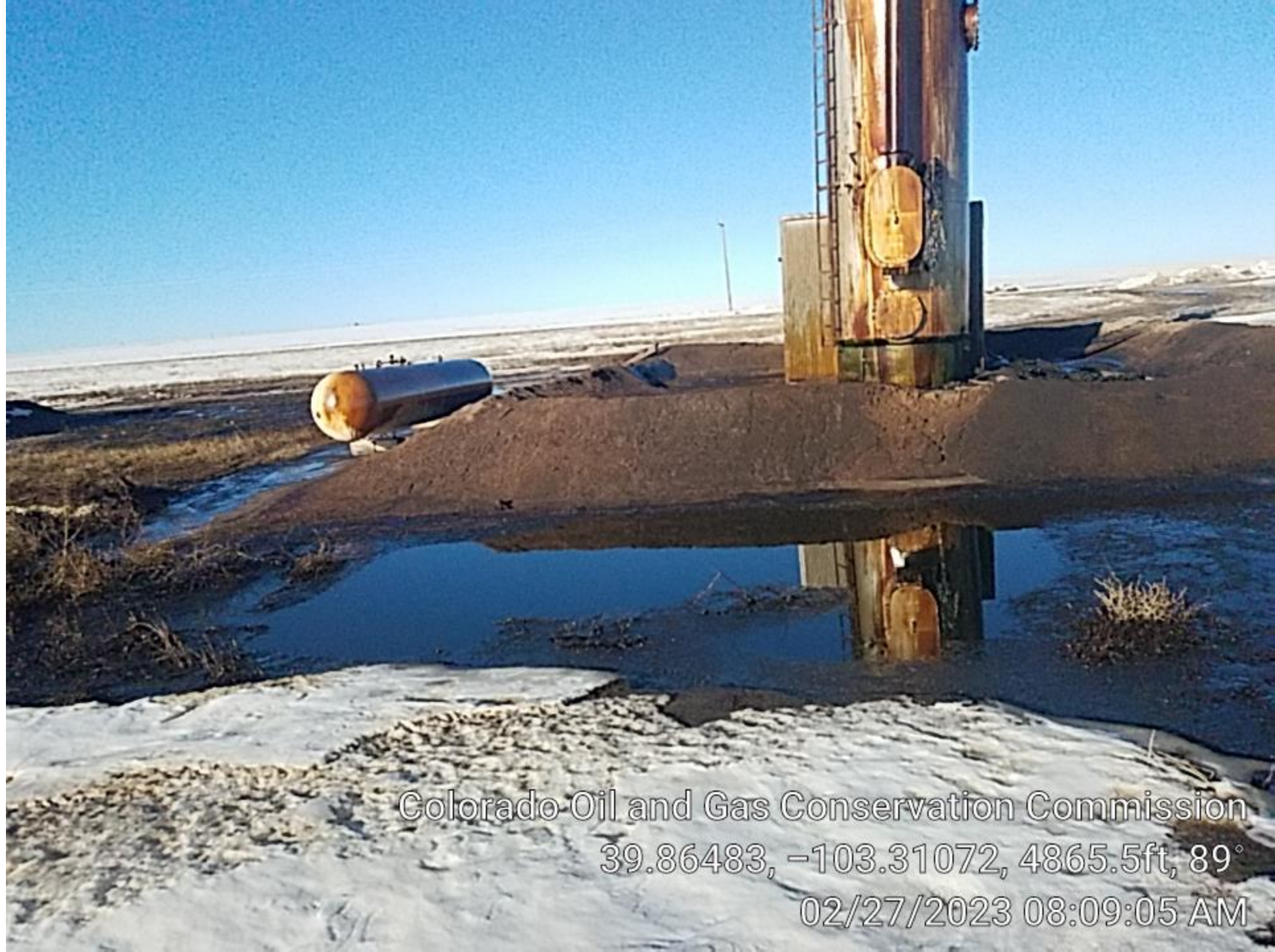
East side of treater berms.

Colorado Oil and Gas Conservation Commission 39.86483, -103.31072, 4865.5ft, 89° 02/27/2023 08:09:05 AM