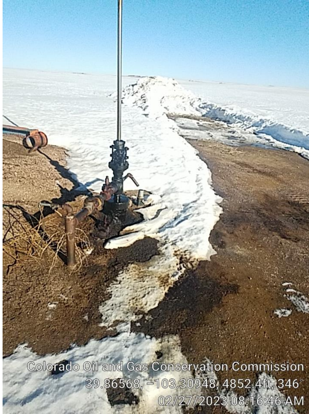
Stained soil at wellhead.

Colorado Oil and Gas Conservation Commission 39.86568, -103.30948, 4852.4ft, 346° 02/27/2023 08:16:46 AM