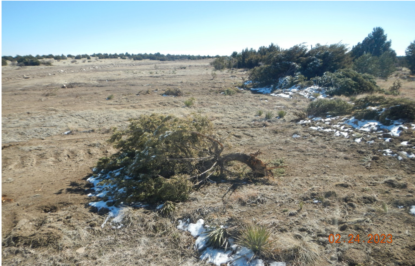
Photo 9. There are trees and soil pushed out along the area of trenching. All tree debris will need to be removed. Soil pushed out will need to be replaced.