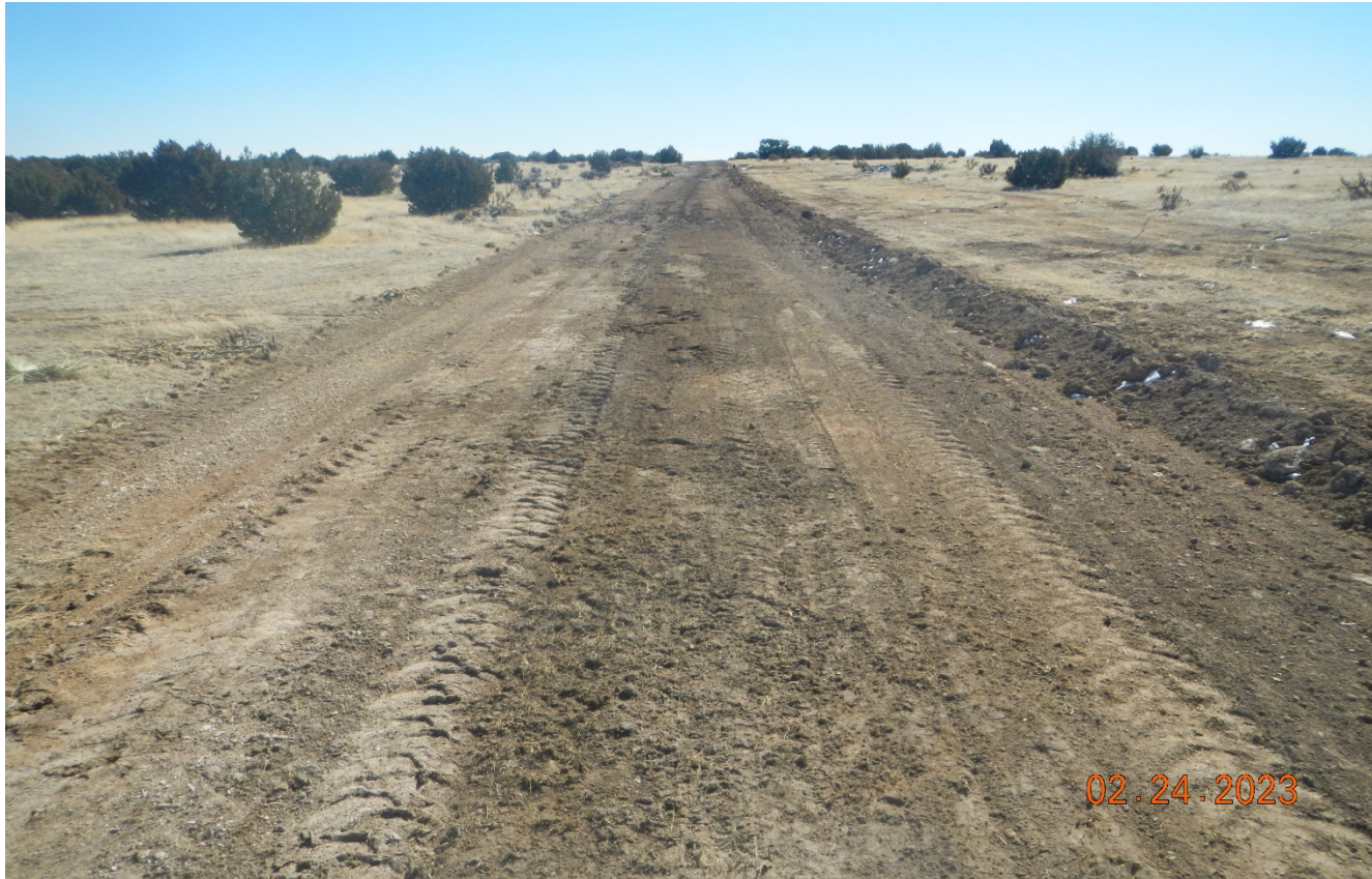
Photo 8. Facing southeast toward the flowline trenching disturbance.