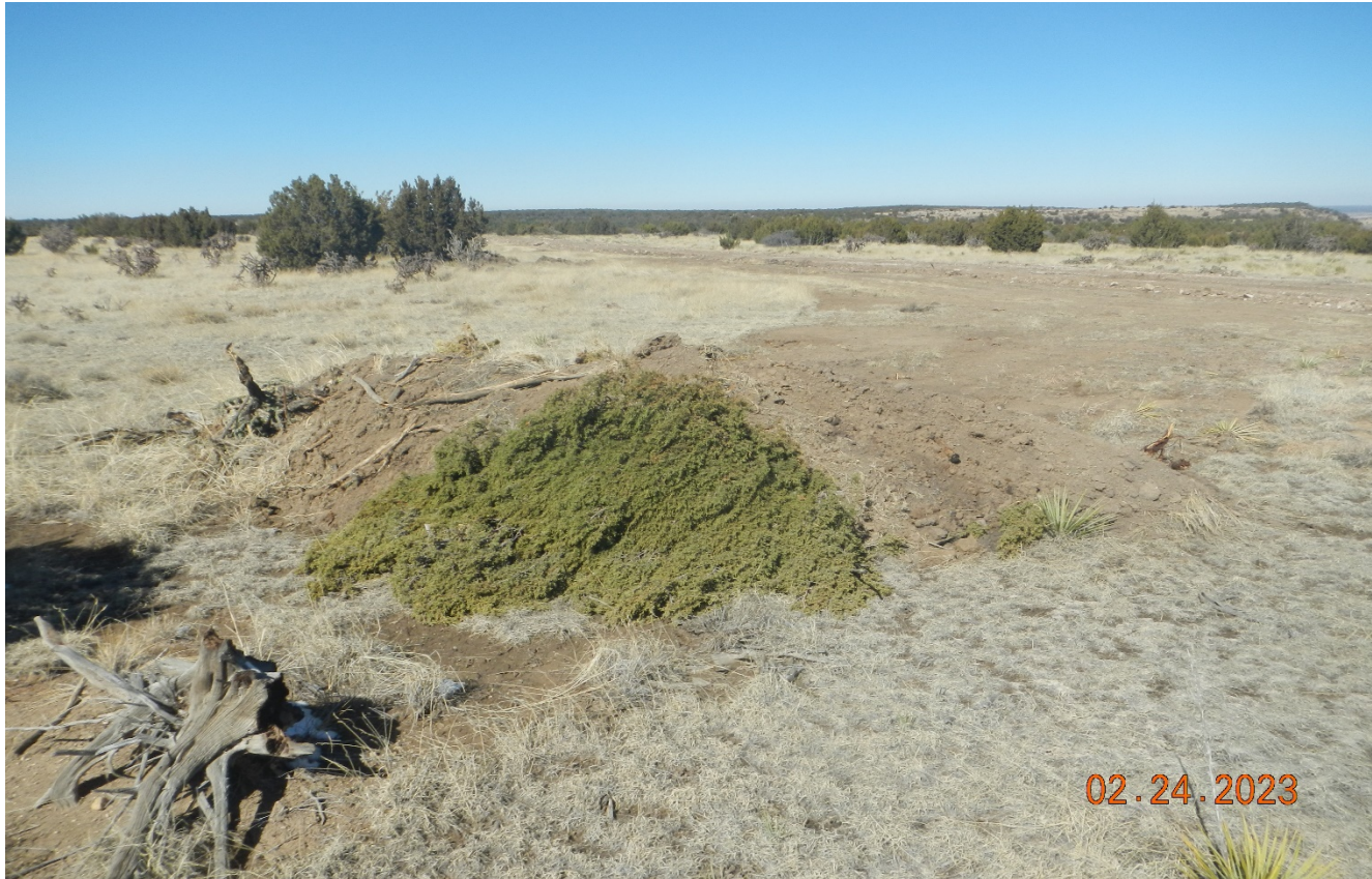
Photo 10. There are trees and soil pushed out along the area of trenching. All tree debris will need to be removed. Soil pushed out will need to be replaced.