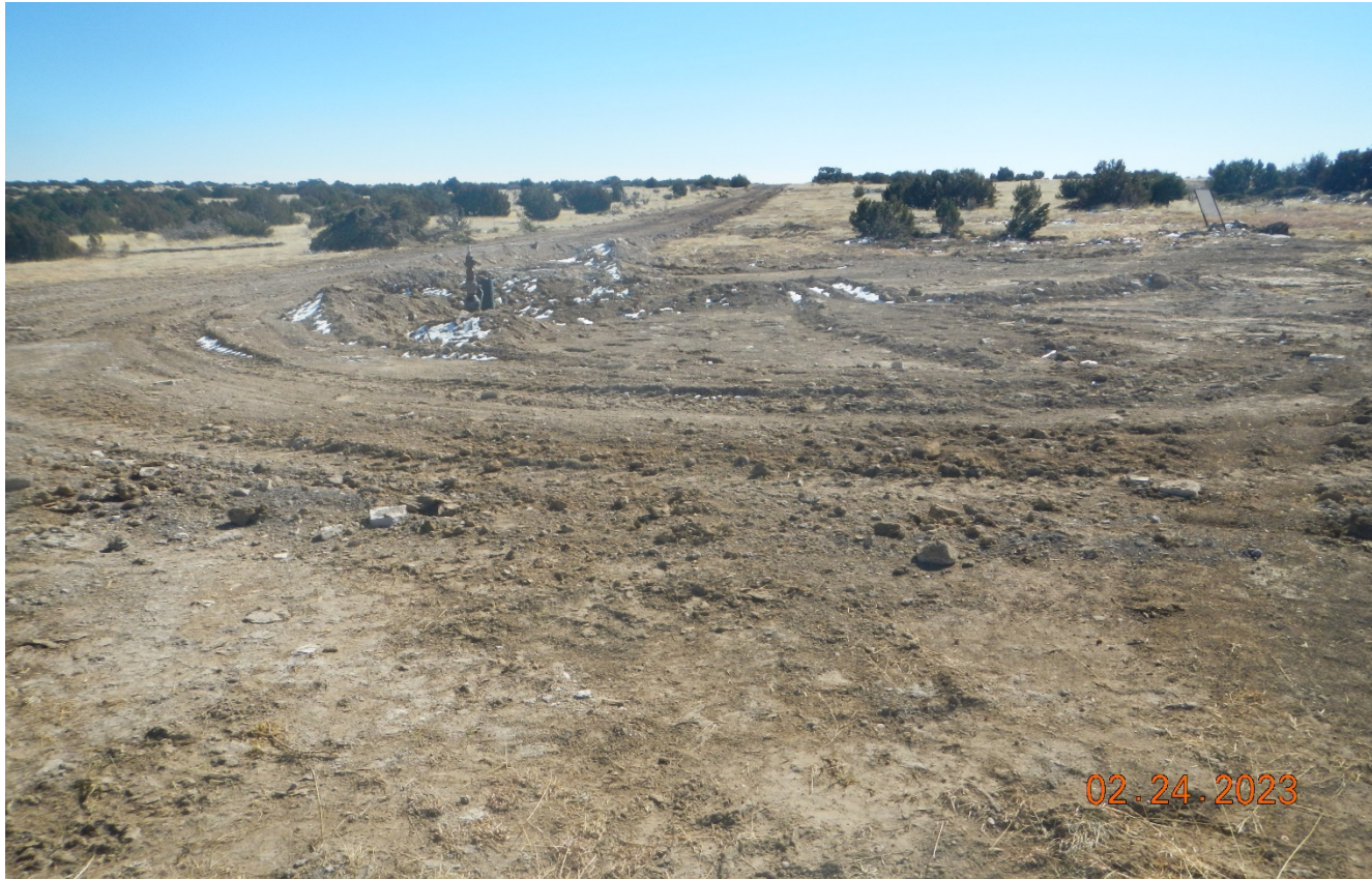
Photo 6. Facing southeast at the wellsite. Flowline trenching was performed from the well to the processing plant located approx. 1 mile southeast.