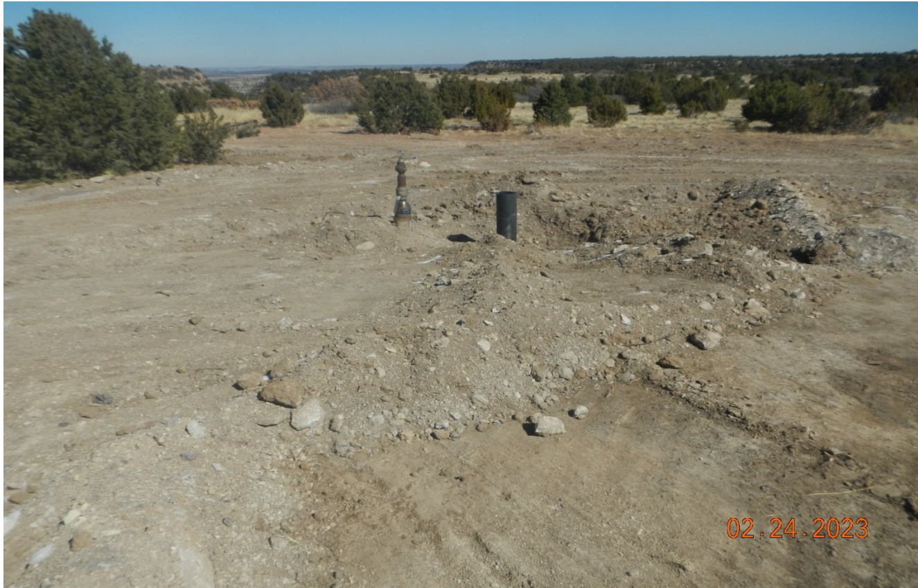
Photo 5. Facing east toward the wellsite. There is soil mixing throughout this area and soils are not salvage and protected from degradation and compaction.