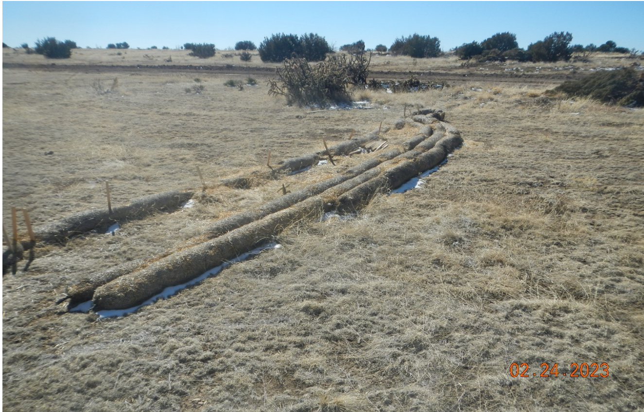
Photo 7. Stormwater BMP's at the location are not maintained or installed.