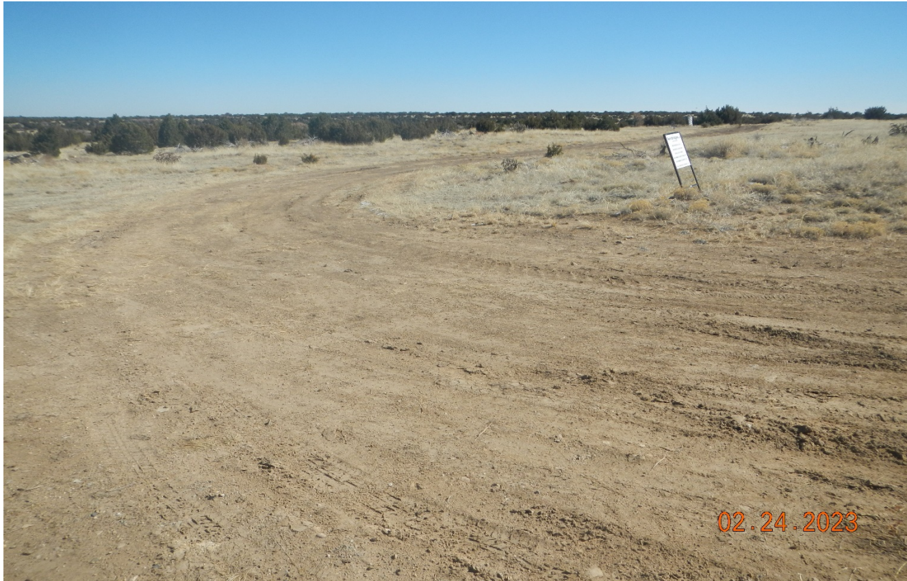
Photo 1. Facing southeast toward the access road. Sign posted at road does not reflect current operator.