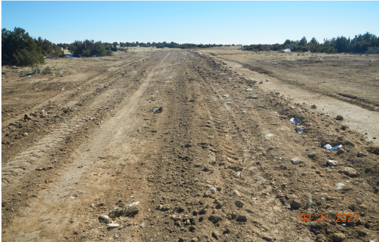
Photo 11. Facing southeast toward the flowline trenching disturbance. There were scattered rocks along the disturbance and it does not appear topsoil was separated along the flowline.