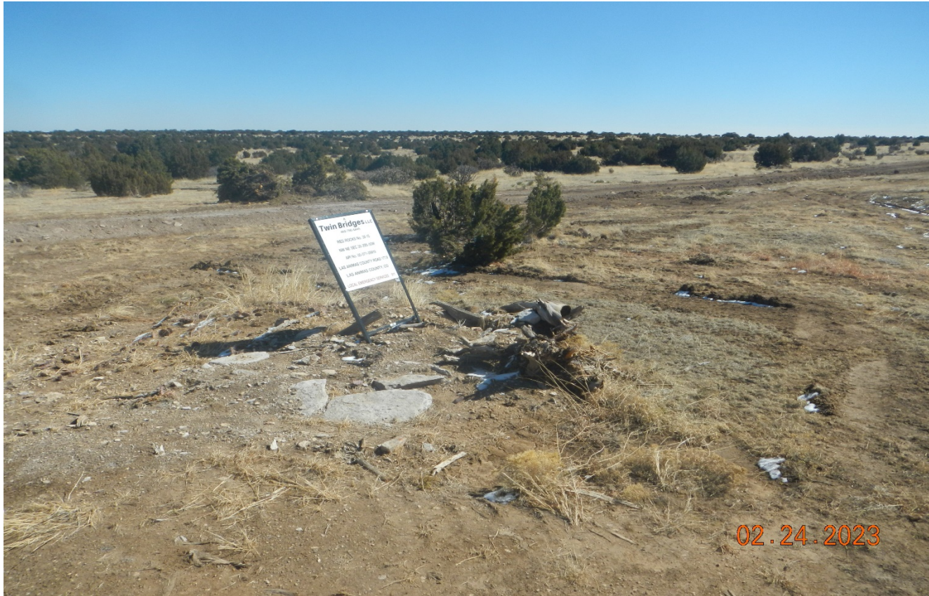
Photo 4. Sign posted at the location does not reflect the current operator. No emergency operator contact number posted.