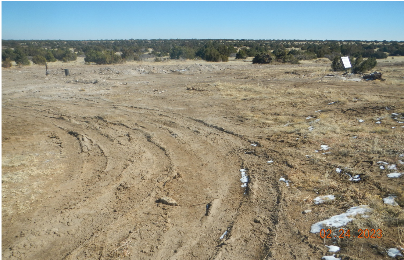
Photo 3. Facing southeast toward the location.