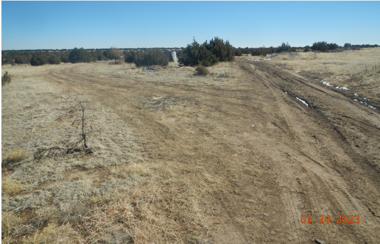
Photo 2. Facing southeast along the access road. Vehicles are not staying on the access road and causing additional disturbance. Vehicle traffic must be limited to the access road only.