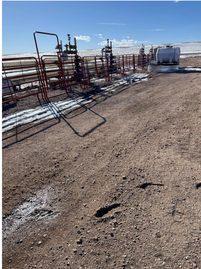
Photo 1. Facing northwest towards the wellheads. Tumbleweeds were removed throughout the site equipment. This is now removed.