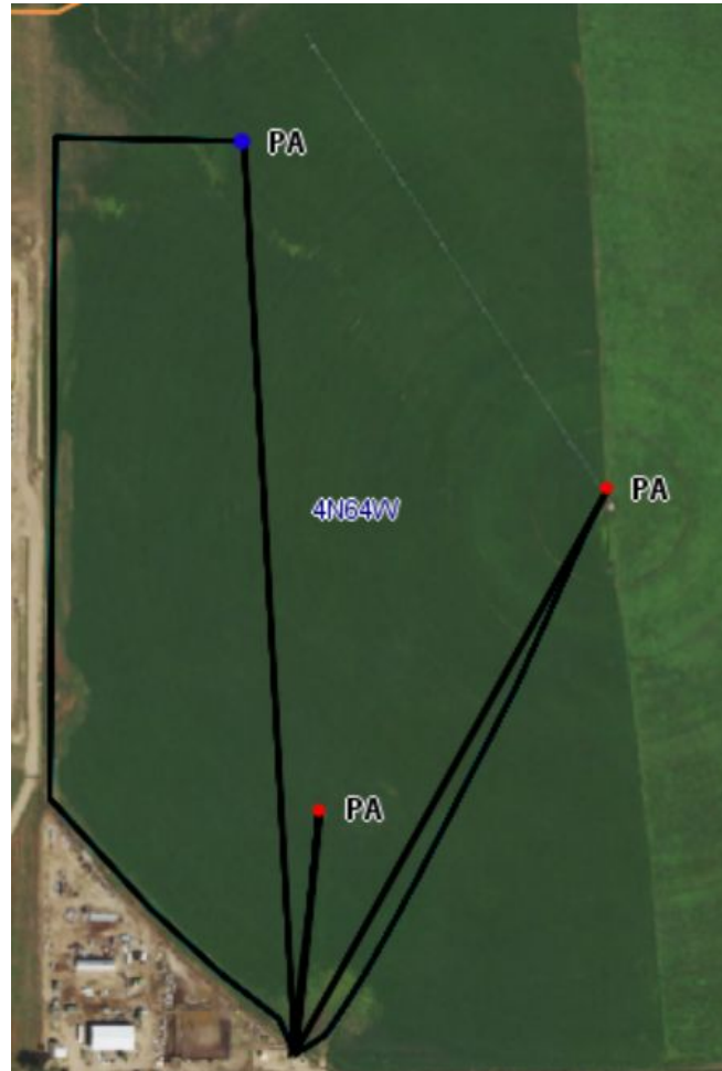
Photo 2. COGCC Online Map aerial imagery 2019 with subject well (blue dot), related wells (red dots), tank battery (south center) and flowlines (black lines).