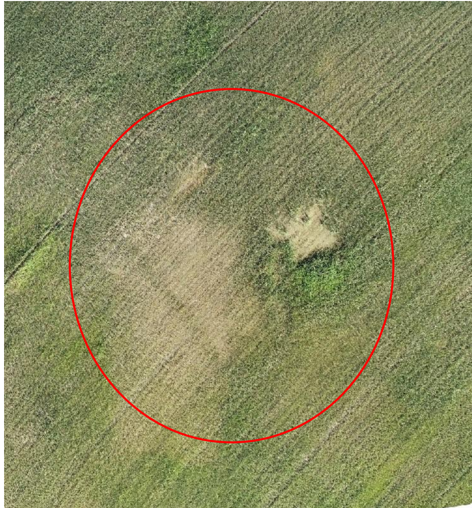
Photo 4. Zoomed in Orthomosaic drone aerial imagery taken from 200 ft (Sept. 2022). Illustrates lack of growth on and around the well location (red circle).