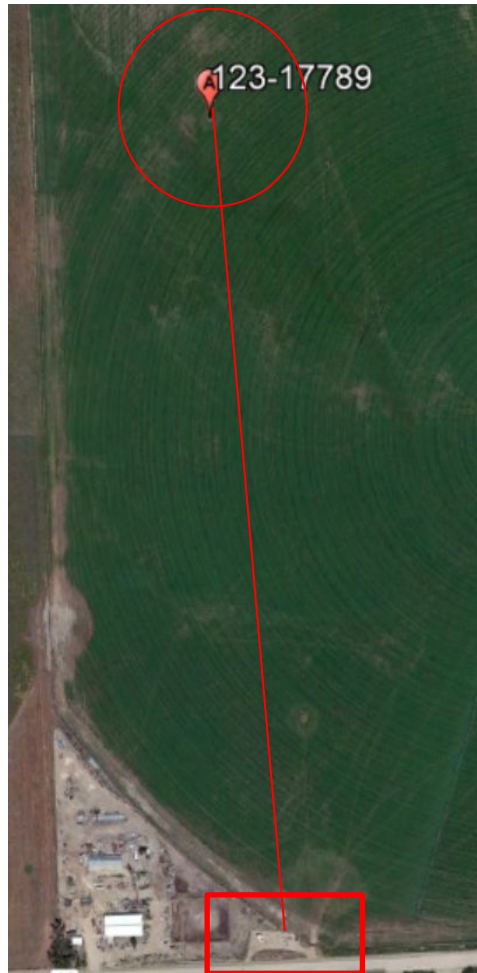
Photo 1. Google Earth aerial imagery taken 6/2019 during active operations. Photo illustrates the well location (red circle), tank battery (red rectangle), and approximate flowlines (red line).