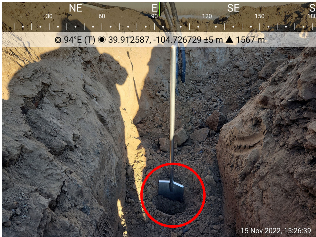
Photo 3: SS02 collected at former flow line from well head to compressor , 11/15/2022.