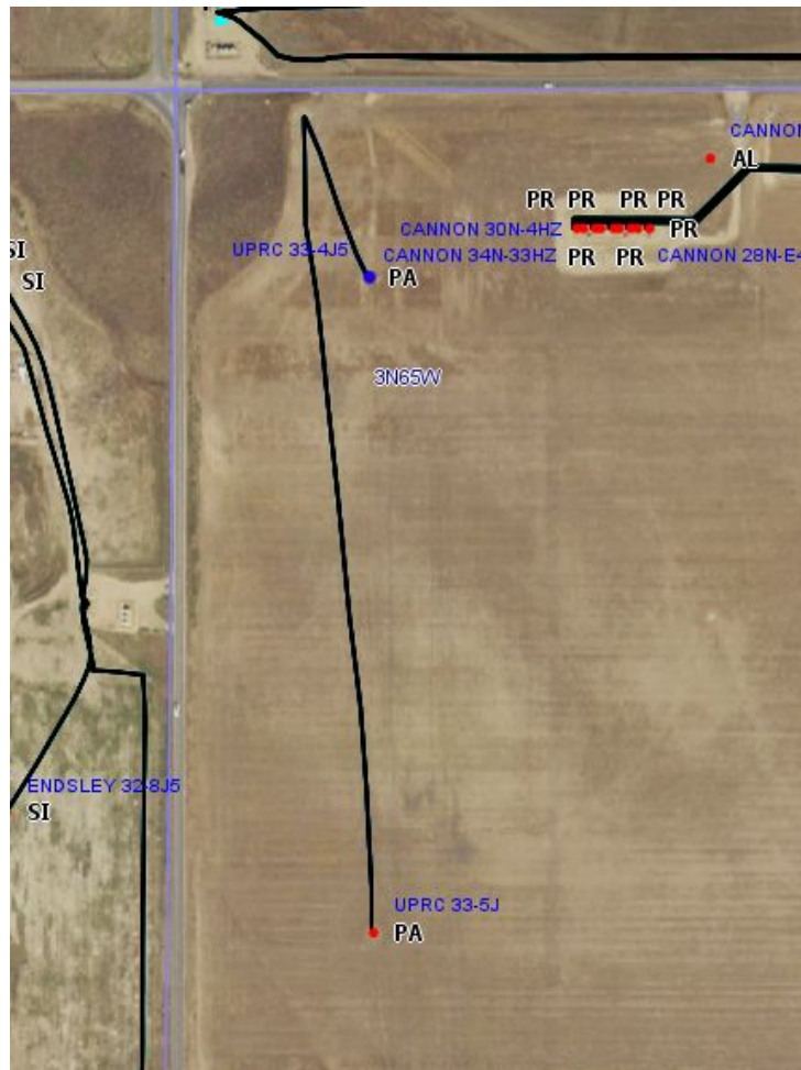
Photo 2. COGCC Online Map aerial imagery 2019 with related wells (red dots), subject well (blue dot), tank battery (near northwest corner) and flowlines (black lines).