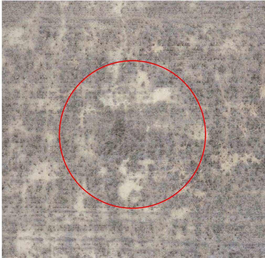
Photo 4. Zoomed in Orthomosaic taken from 200 ft (Oct. 2022). Illustrates rangeland growth similar to surroundings on and around the well location (red circle). Appears similar to rest of area, however crop height cannot be fully evaluated. Another inspection is required when crop is actively growing.