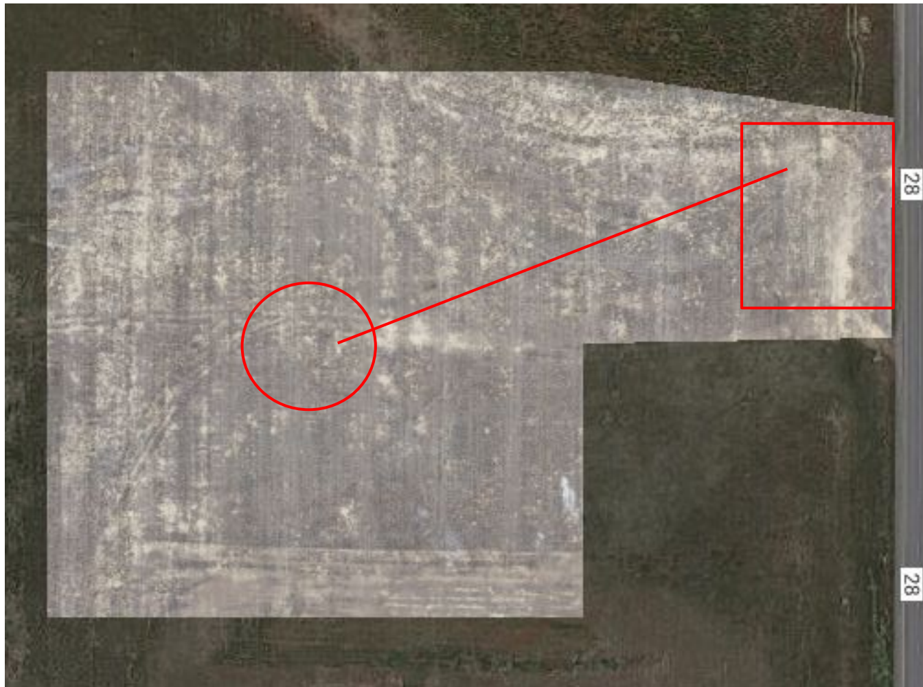
Photo 3. Orthomosaic drone aerial imagery taken from 200 ft (Oct. 2022). Illustrates rangeland growth on and around the well location (red circle), flowline (red line), and tank battery (red rectangle).