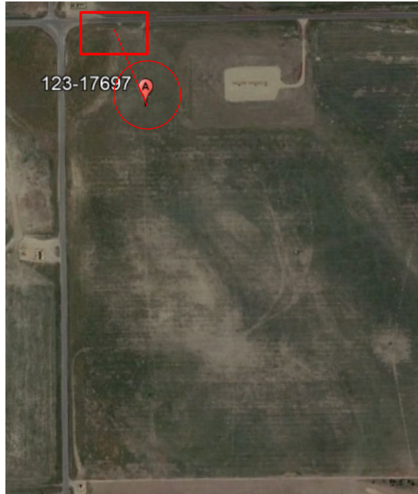
Photo 1. Google Earth aerial imagery taken 10/2015 during active operations. Photo illustrates the well location (red circle), tank battery (red square), and flowline (red line).